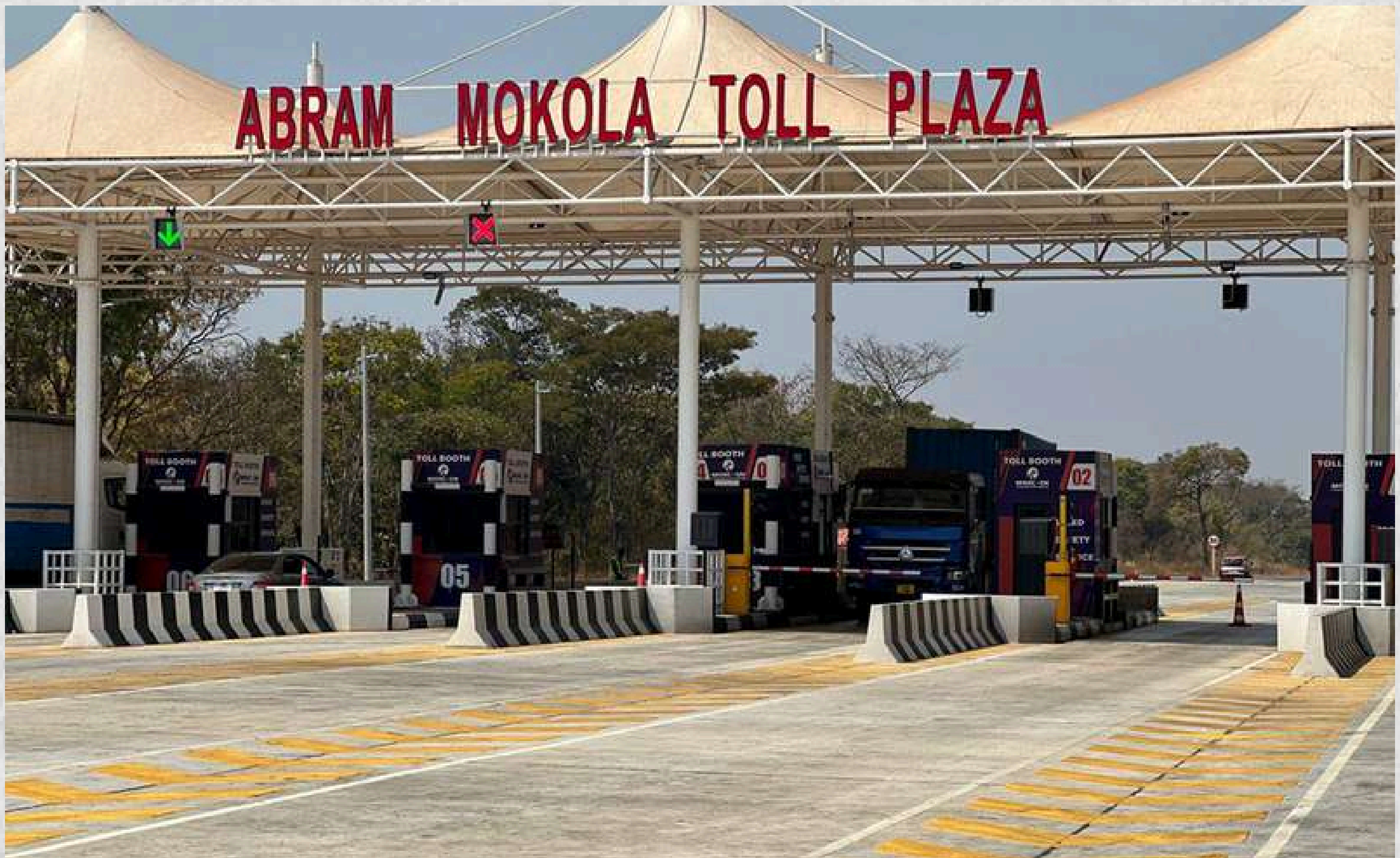
Newly constructed Toll plaza named Abram Mokola located along the 45 kilometres Masangano-Fisenge-Luanshya Road on the Copperbelt.