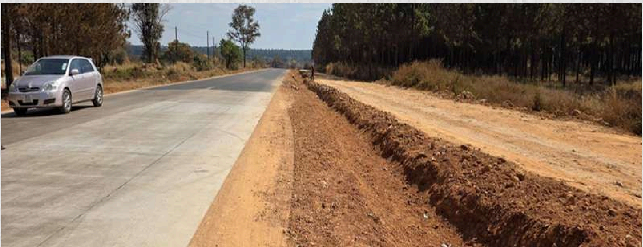
Rehabilitated section of the Ndola-Sakania-Mufulira Road.

The Concession Agreement for the finance, design, build, operate, maintain, and transfer of 55 kilometres of the Ndola-Sakania-Mufulira Road and border infrastructure at Sakania on the Copperbelt Province was signed with Messrs. Jaswin Ports Limited and the Government of the Republic of Zambia through the RDA, the Ministry of Finance and National Planning and the Ministry of Commerce, Trade and Industry.