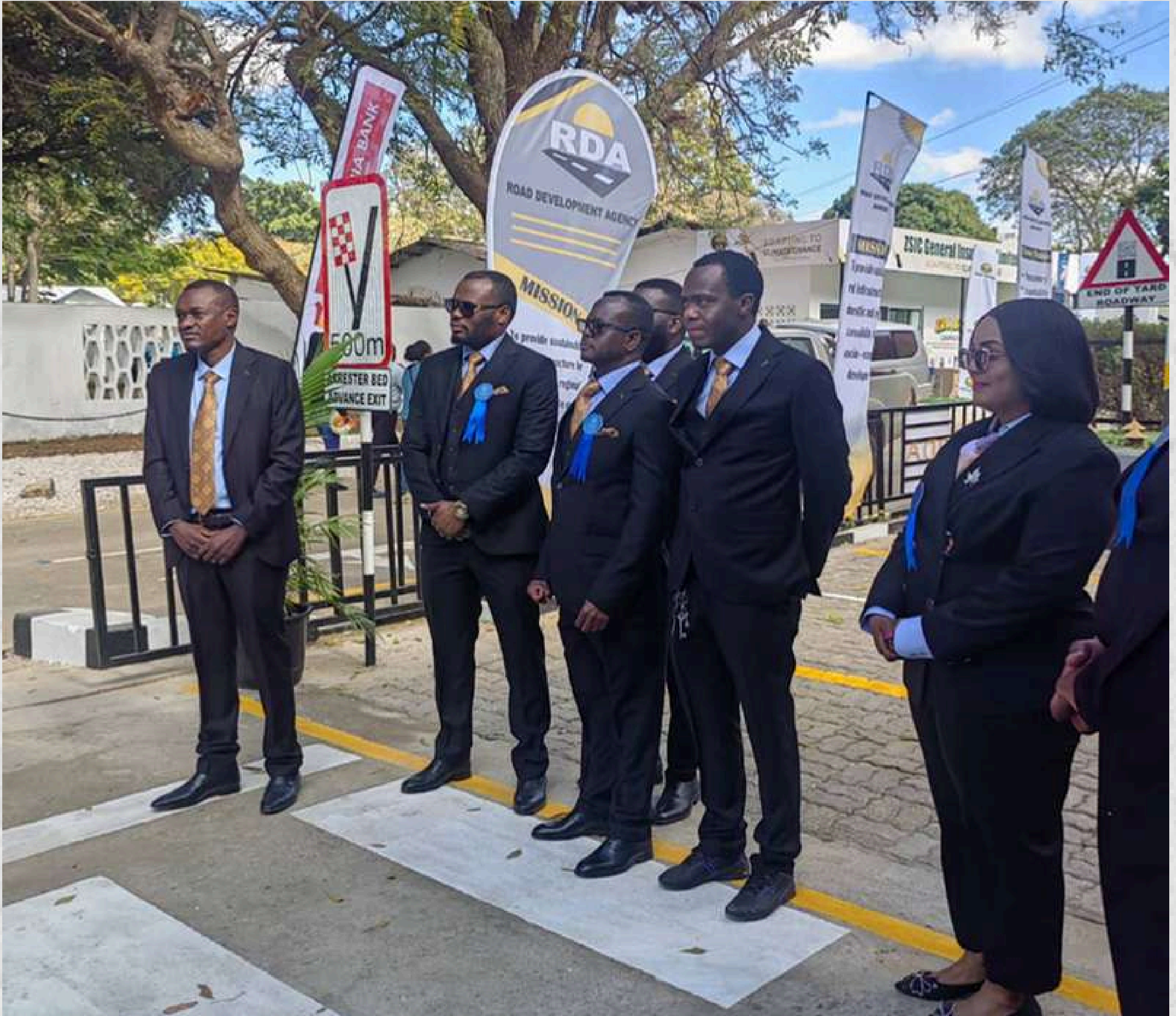
RDA participants at the 97th Zambia Agricultural and Commercial Show.