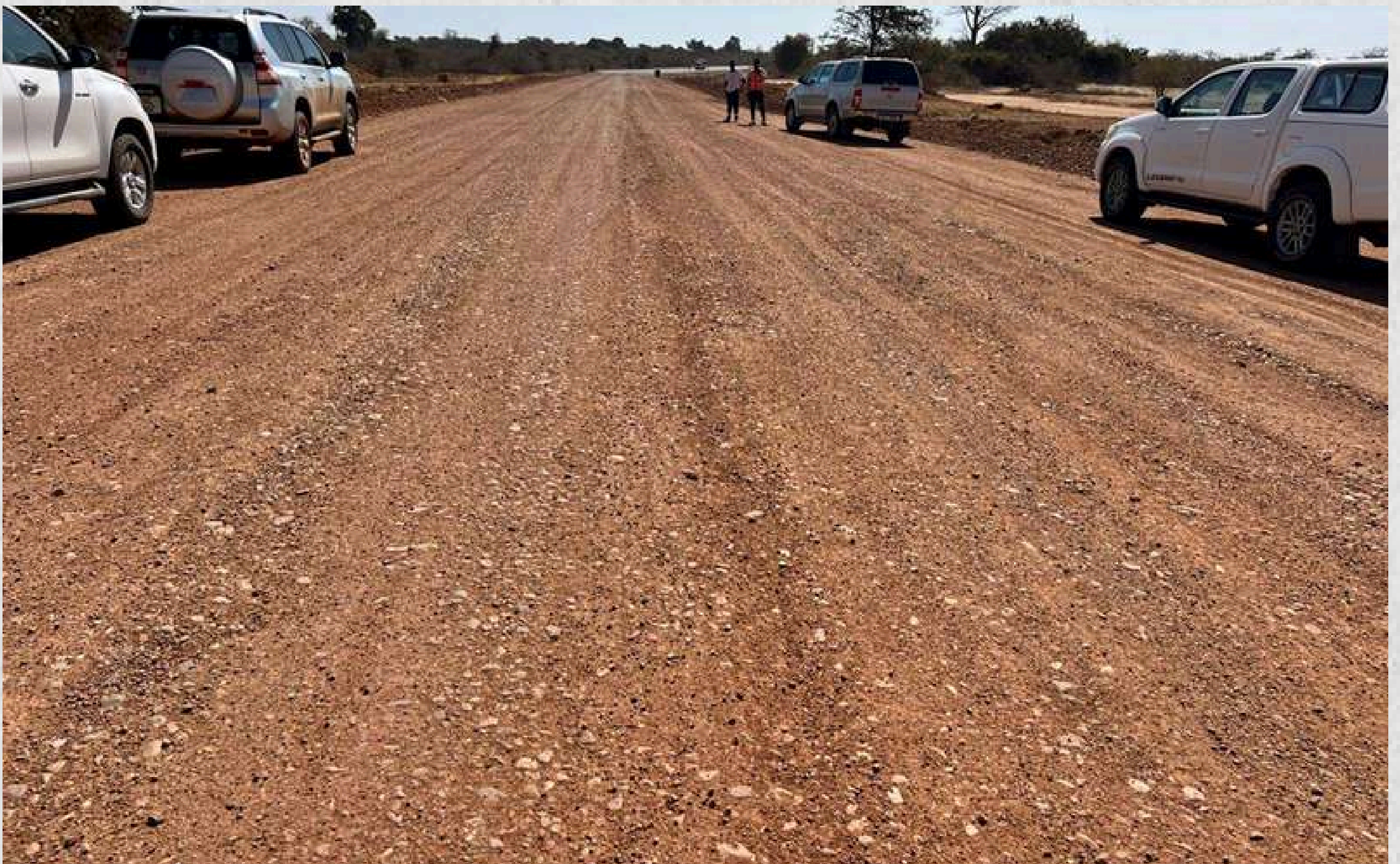
Works on the Monze-Niko Road in Southern Province.

The new structure will allow water to pass safely beneath it during heavy rains without compromising the bridge's integrity, thereby enhancing safety and durability.