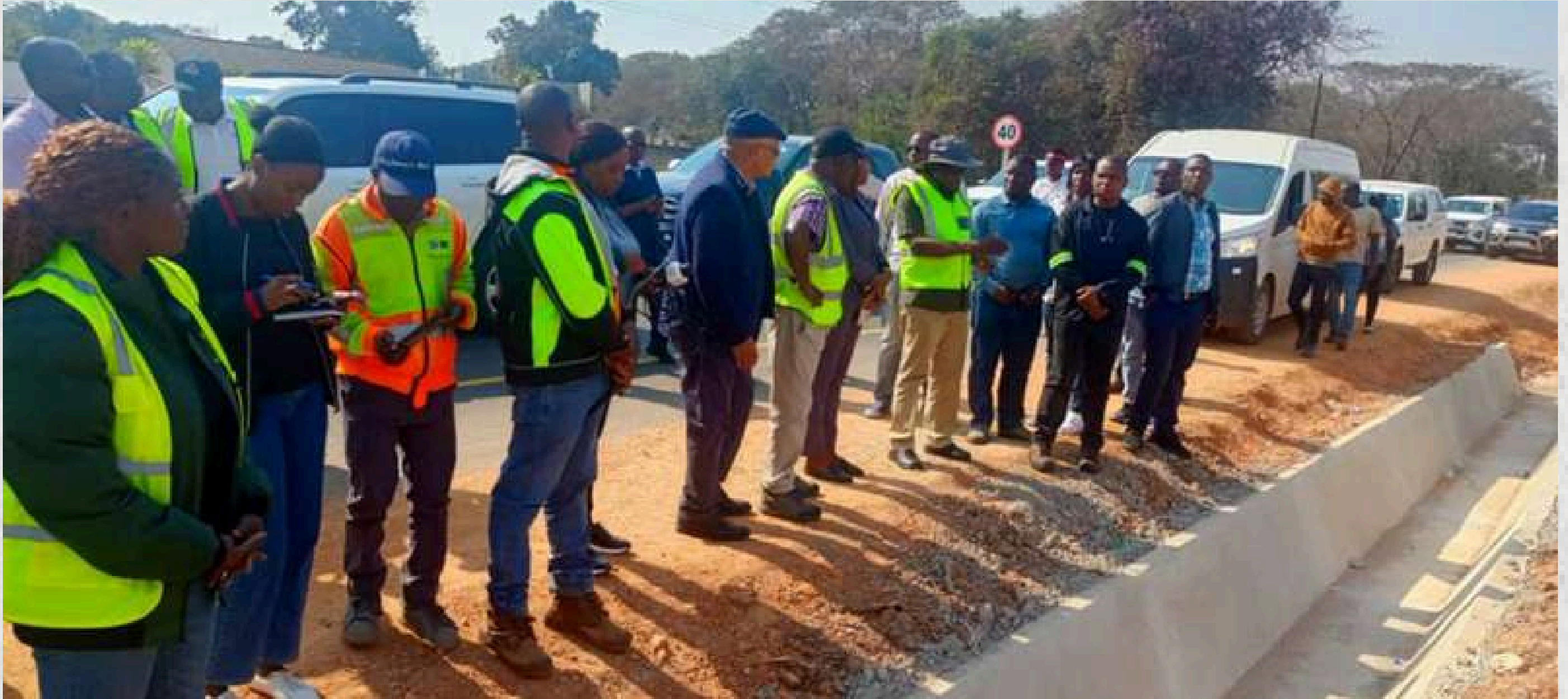
Infrastructure, Housing, and Urban Development Minister, Hon. Eng. Charles Lubasi Milupi inspecting works on the Ndola-Sakania-Mufulira Road on the Copperbelt Province.

Minister of Infrastructure, Housing, and Urban Development, Hon. Eng. Charles Lubasi Milupi has expressed satisfaction with the quality and progress of works on the Ndola–Sakania-Mufulira Road on the Copperbelt Province.