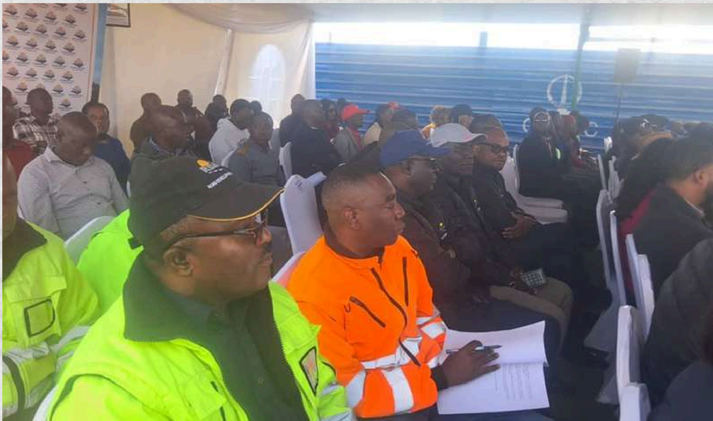
RDA Staff and guests following the proceedings.

"This will be done within the Government's Policy directive of the right price, specified quality, and delivered timely," he said.