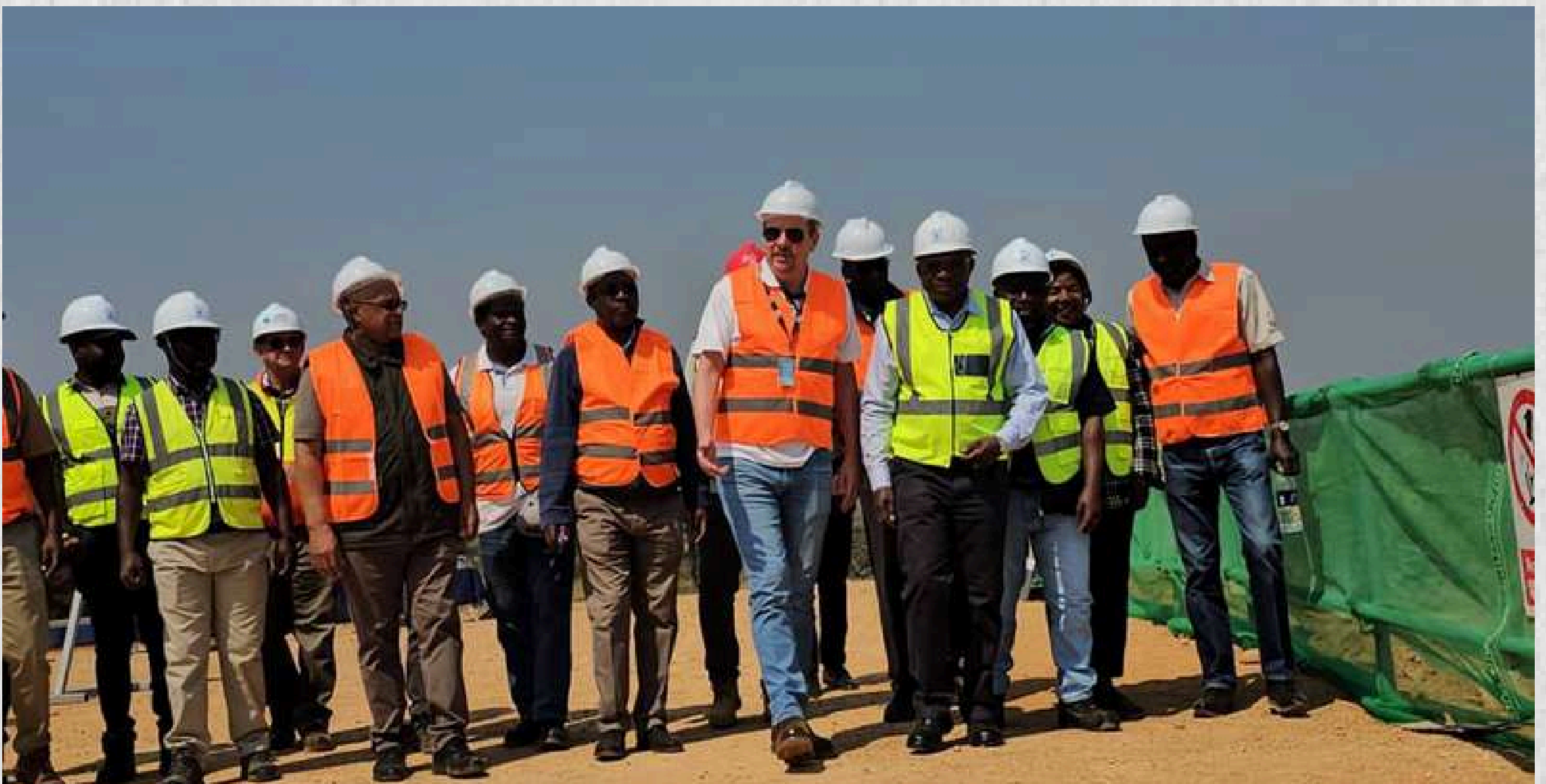
Infrastructure, Housing and Urban Development Minister, Hon. Eng. Charles Milupi led PPP Council, MIHUD and RDA Officials to inspect construction works of the Kasomeno-Mwenda Road and Bridge Project in Mwense District.

The facility is part of the Kasomeno–Mwenda Toll Road Project, being implemented under a Public-Private Partnership (PPP) financing model by the Concessionaire Groupe Européen de Développement (GED) Africa/Zambia Limited, and the project sponsor is Duna Aszfalt.