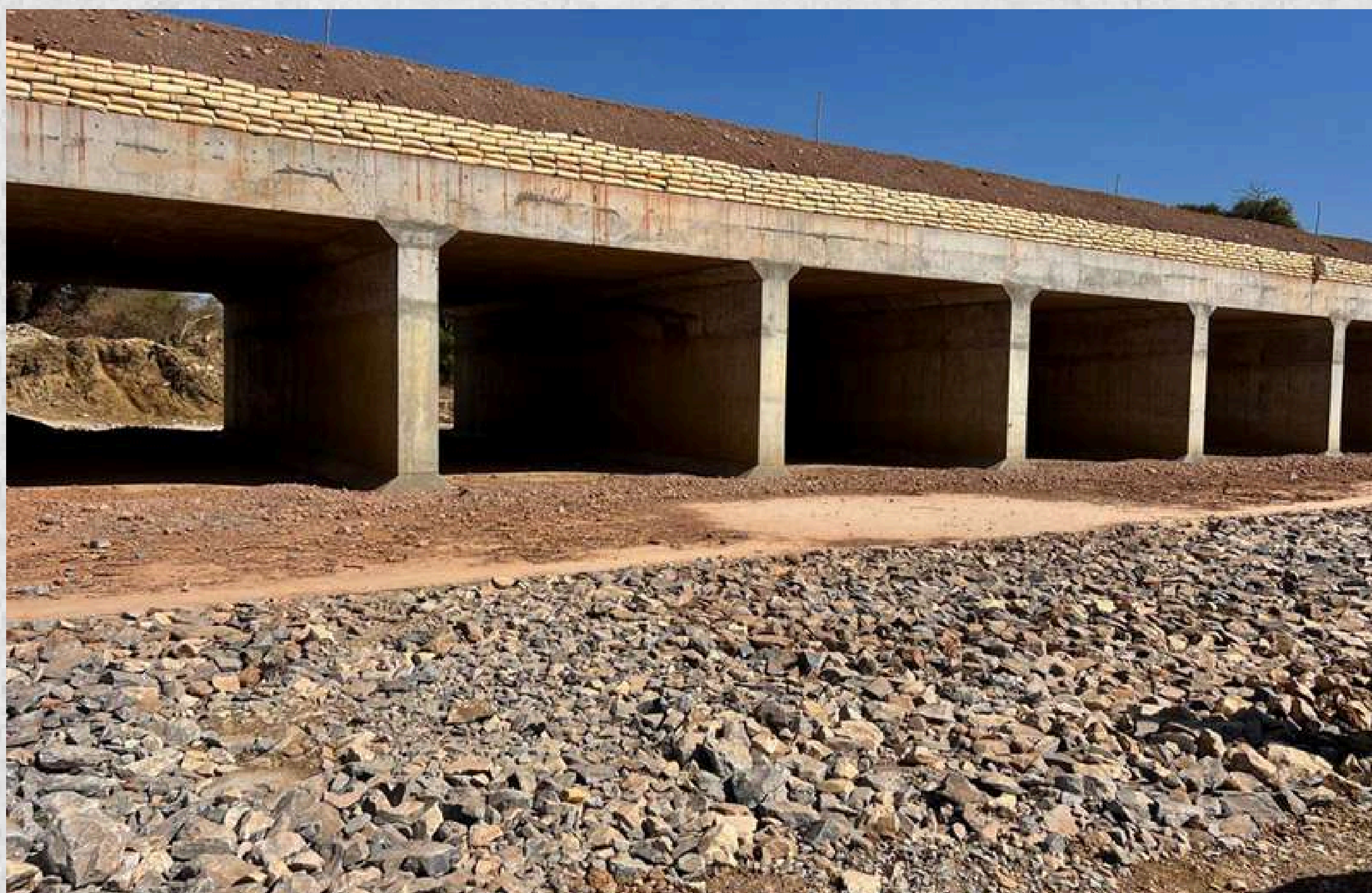
Newly constructed six-cell, 6mX4m in-situ box culvert at Chikumbwe Stream, designed to improve the drainage structure.