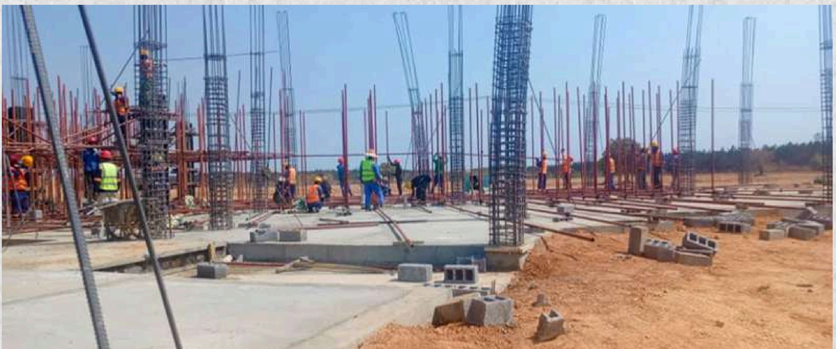
Construction works of the One Stop Border Post at Mokambo.

The scope of work includes road construction and border infrastructure development.