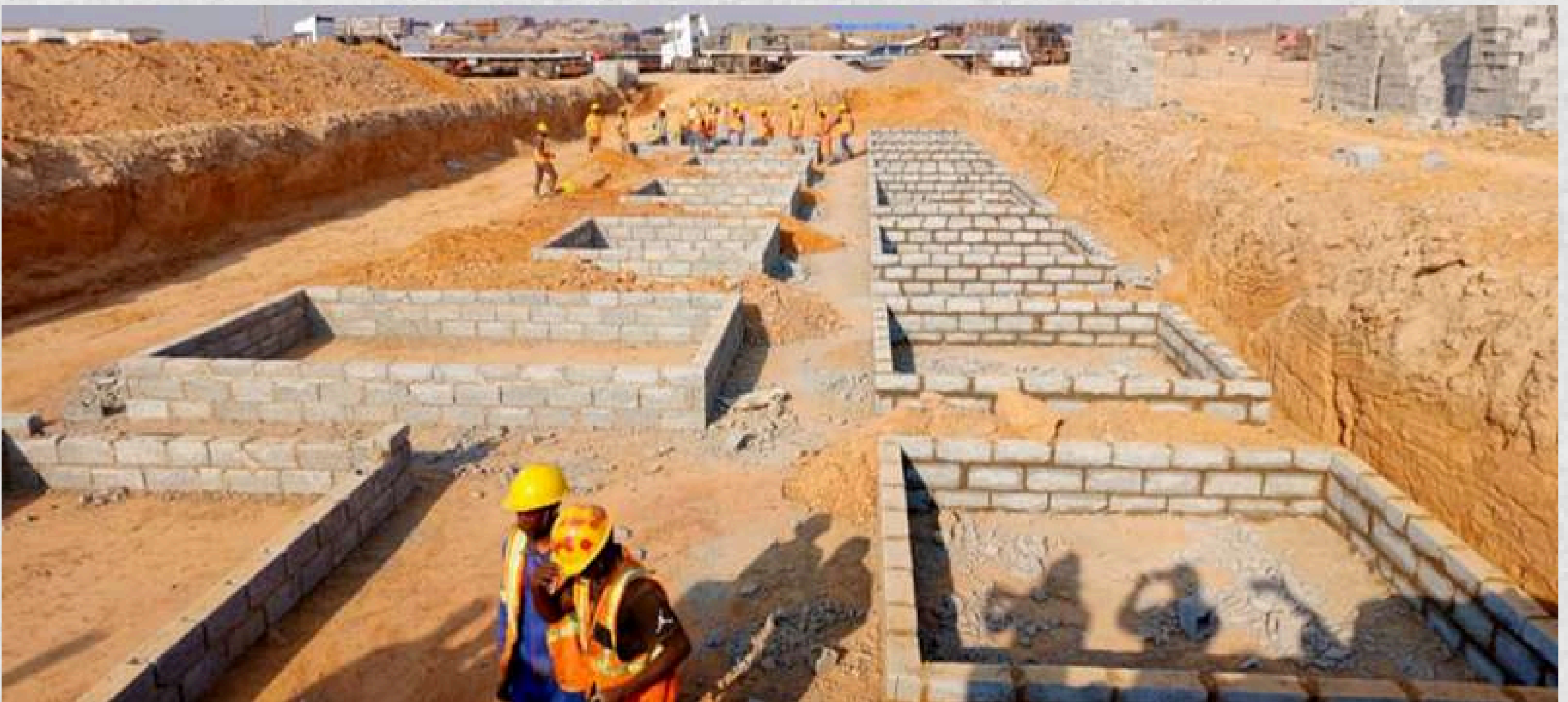
Construction works and Kasumbalesa OSBP.

The Minister was accompanied by members of the Public Private Partnership (PPP) Council, Officials from the Ministry, the Road Development Agency (RDA), and the National Road Fund Agency (NRFA).