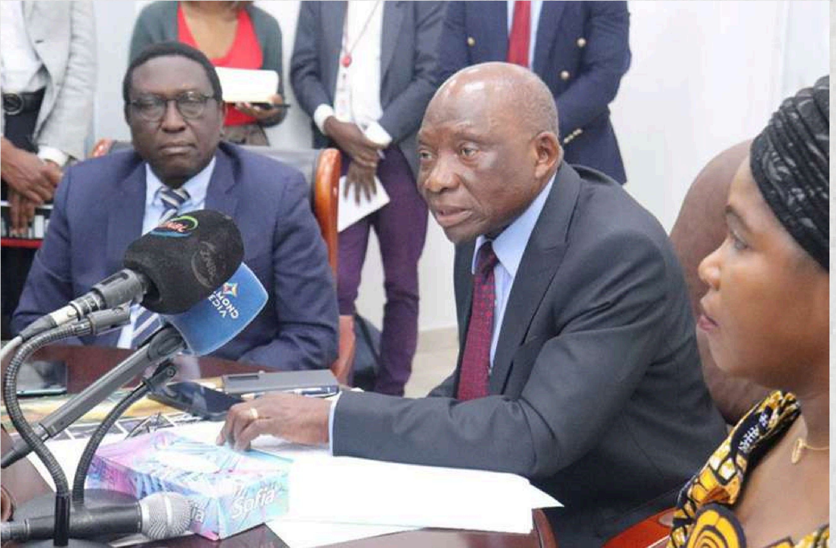
Infrastructure, Housing and Urban Development Minister, Hon. Eng. Charles Lubasi Milupi giving his remarks during the signing of contracts upgrading of the D387 Road from T1 to Chikankata in Southern Province and the upgrading to bituminous standard of approximately 80 kilometres of the Samfya-Kasaba Road via Lubwe including 5 kilometres of Township Roads in Lubwe, Luapula Province.