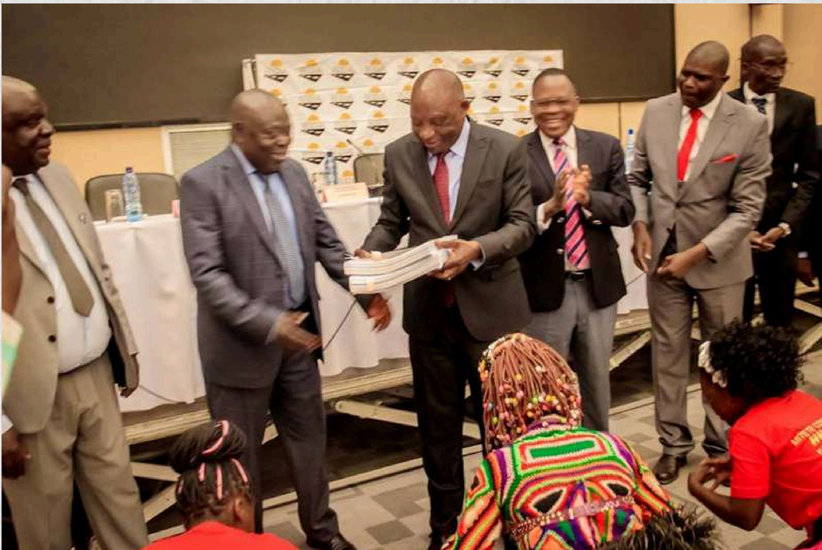
Infrastructure, Housing and Urban Development Minister, Hon. Eng. Charles L. Milupi receives the signed contracts.