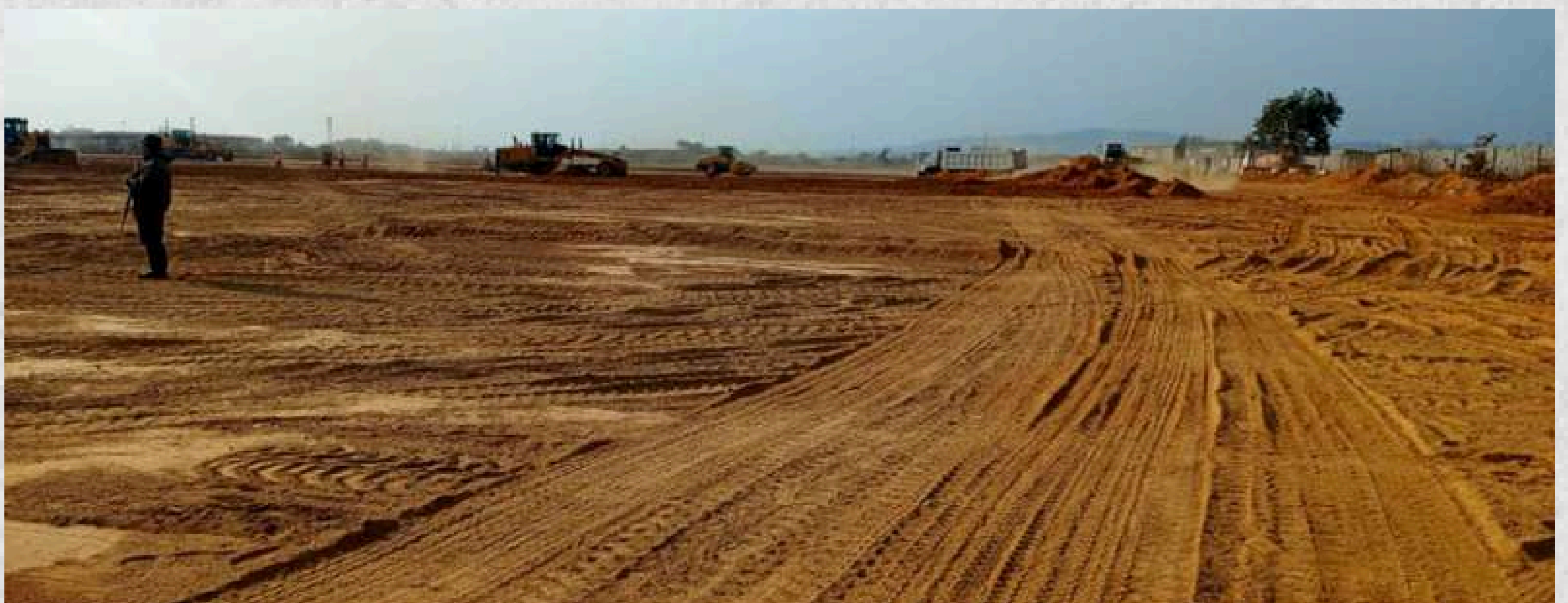
Construction works at Kasumbalesa OSBP.