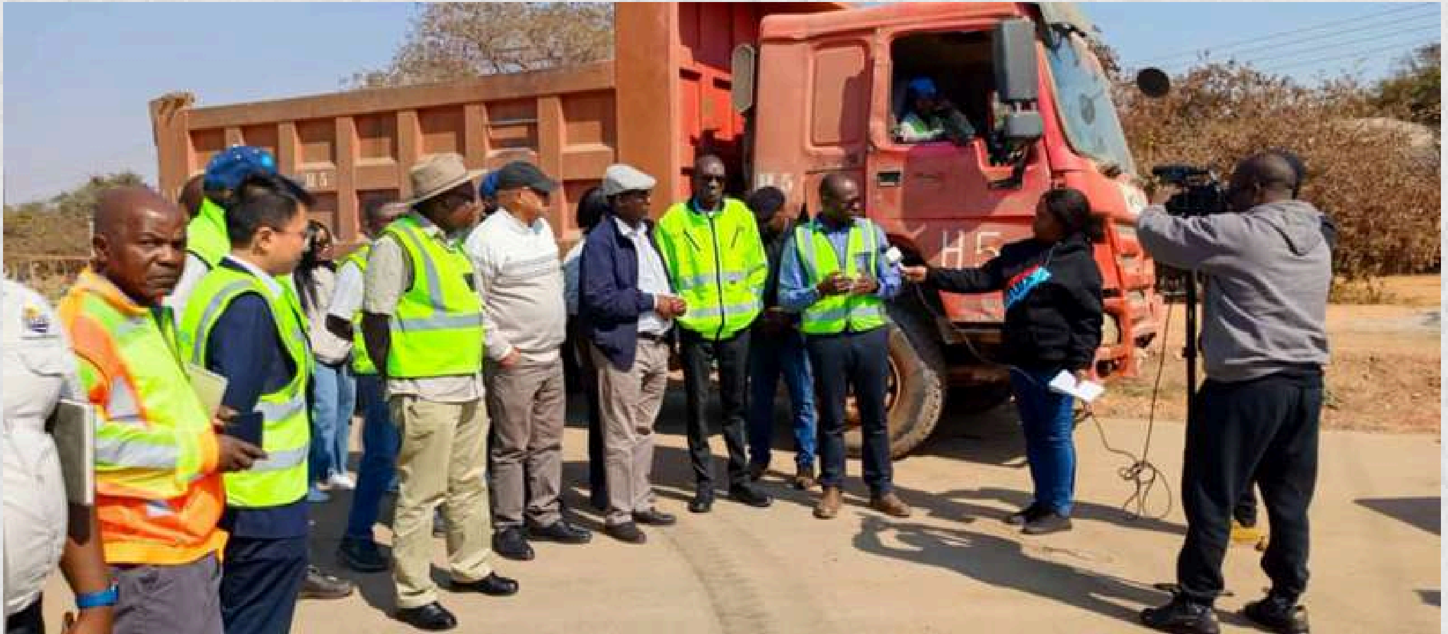
Infrastructure, Housing and Urban Development Minister, Hon. Eng. Charles Milupi during the inspection of the Materials Laboratory at the MOIC-LN Construction Camp.

Infrastructure, Housing and Urban Development Minister, Hon. Eng. Charles Milupi has emphasized the importance of protecting Zambia's roads, especially in light of the significant investment in infrastructure projects.