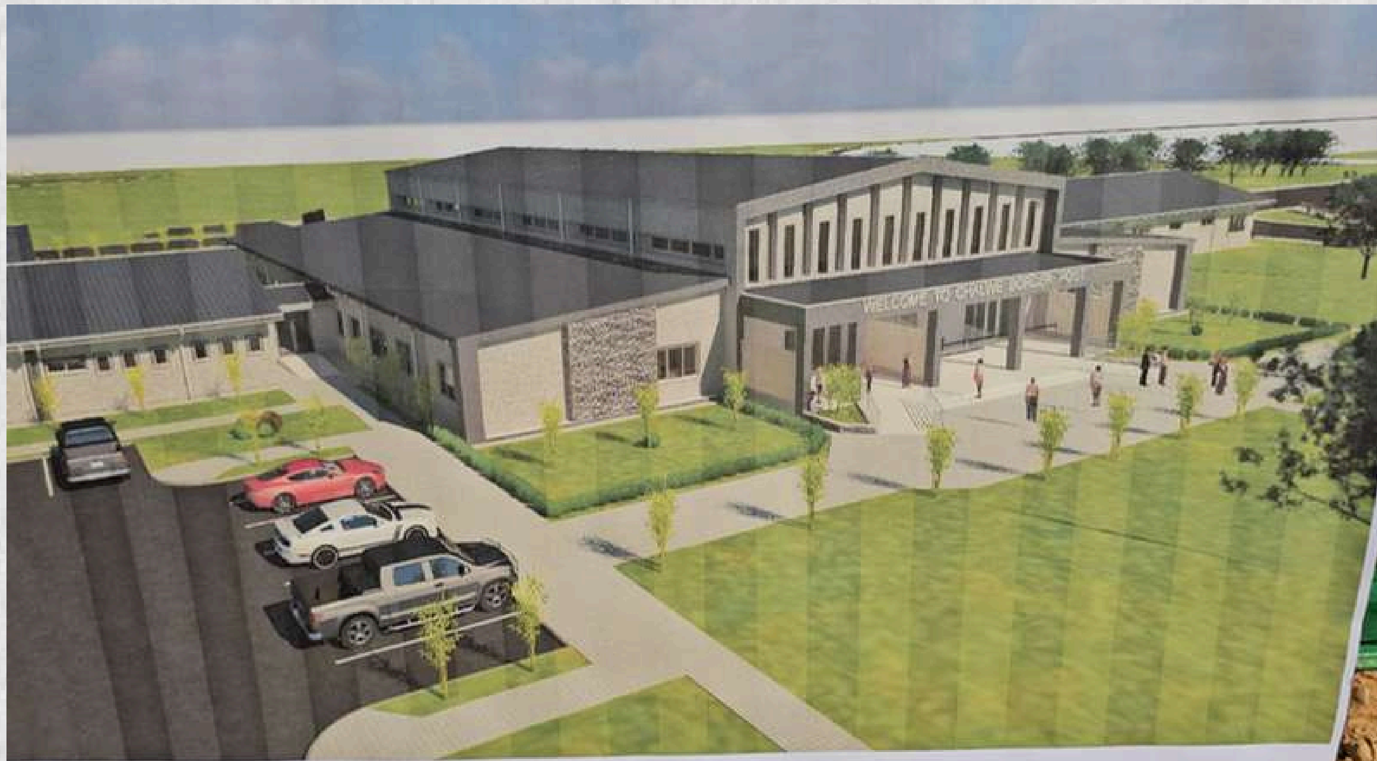
Artistic outlook of the of Kasomeno-Mwenda One Stop Border Post (OSBP).