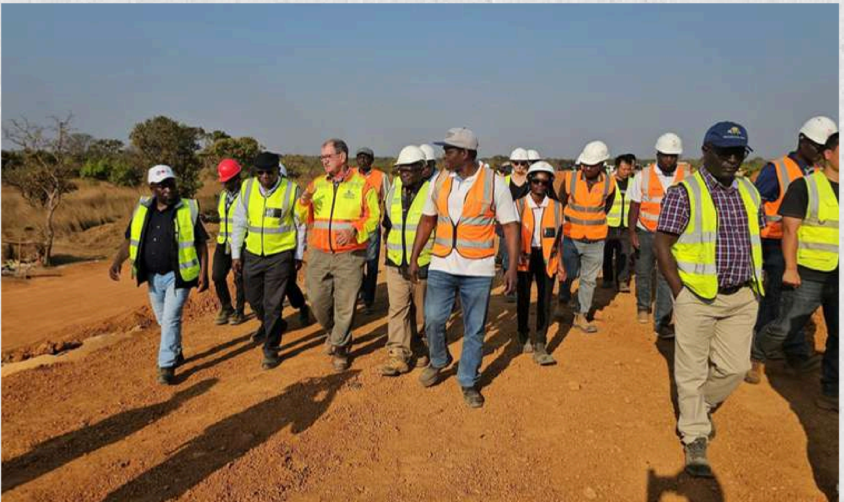
Infrastructure, Housing and Urban Development Minister, Hon. Eng. Charles Milupi led PPP Council, MIHUD and RDA Officials to inspect construction works of the Kasomeno-Mwenda Road and Bridge Project in Mwense District.

He was accompanied by members of the PPP Council, officials from the Ministry, Road Development Agency (RDA), and National Road Fund Agency (NRFA).