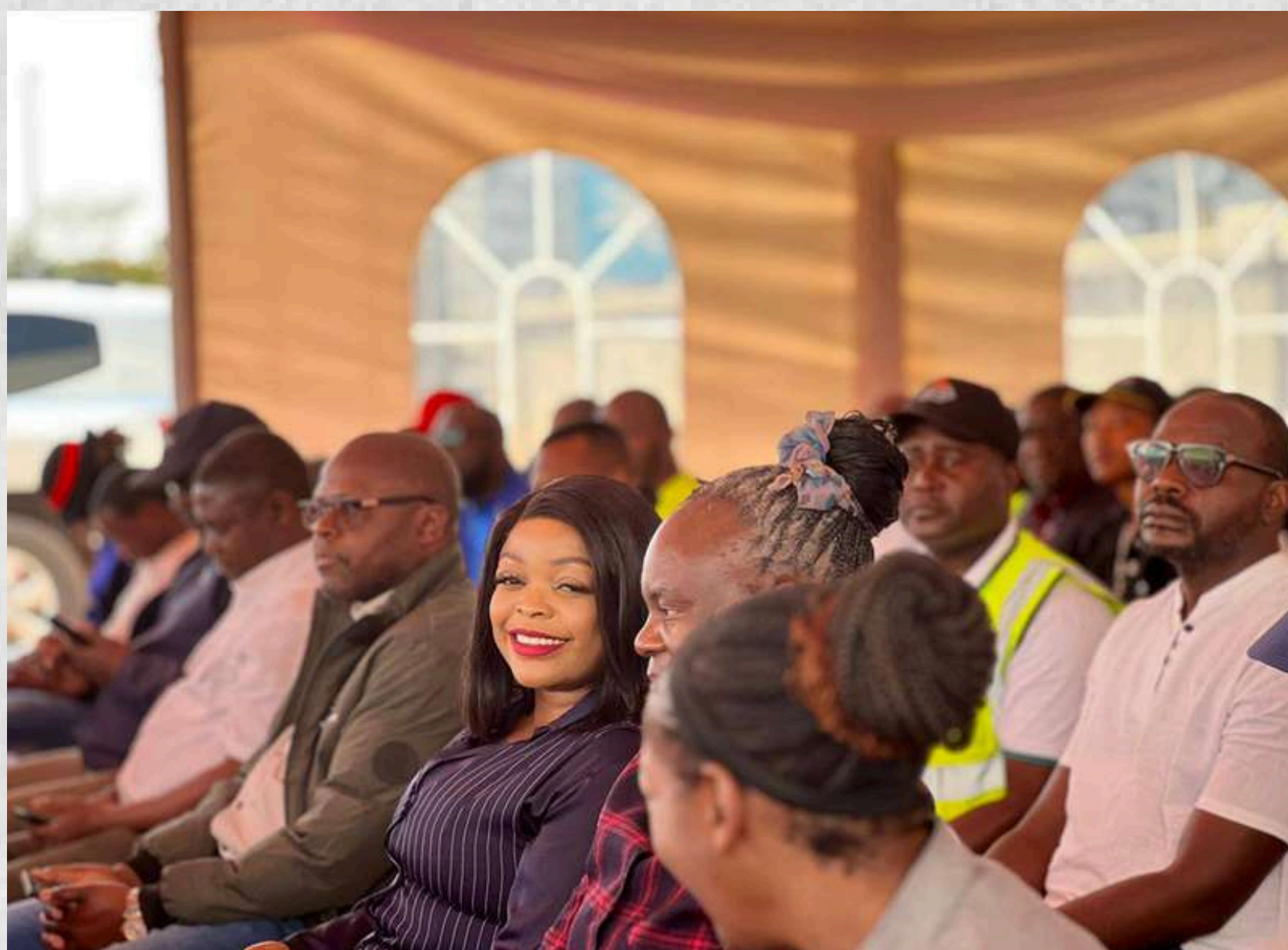
RDA Board Members, staff and invited guests following proceedings during the commissioning of the Abram Mokola Toll Plaza

He said from the time the Chingola-Kasumbalesa Road was rehabilitated under the PPP Financing Model, Zambia had recorded an increased appetite of the private sector partnering with the public sector to develop road infrastructure.