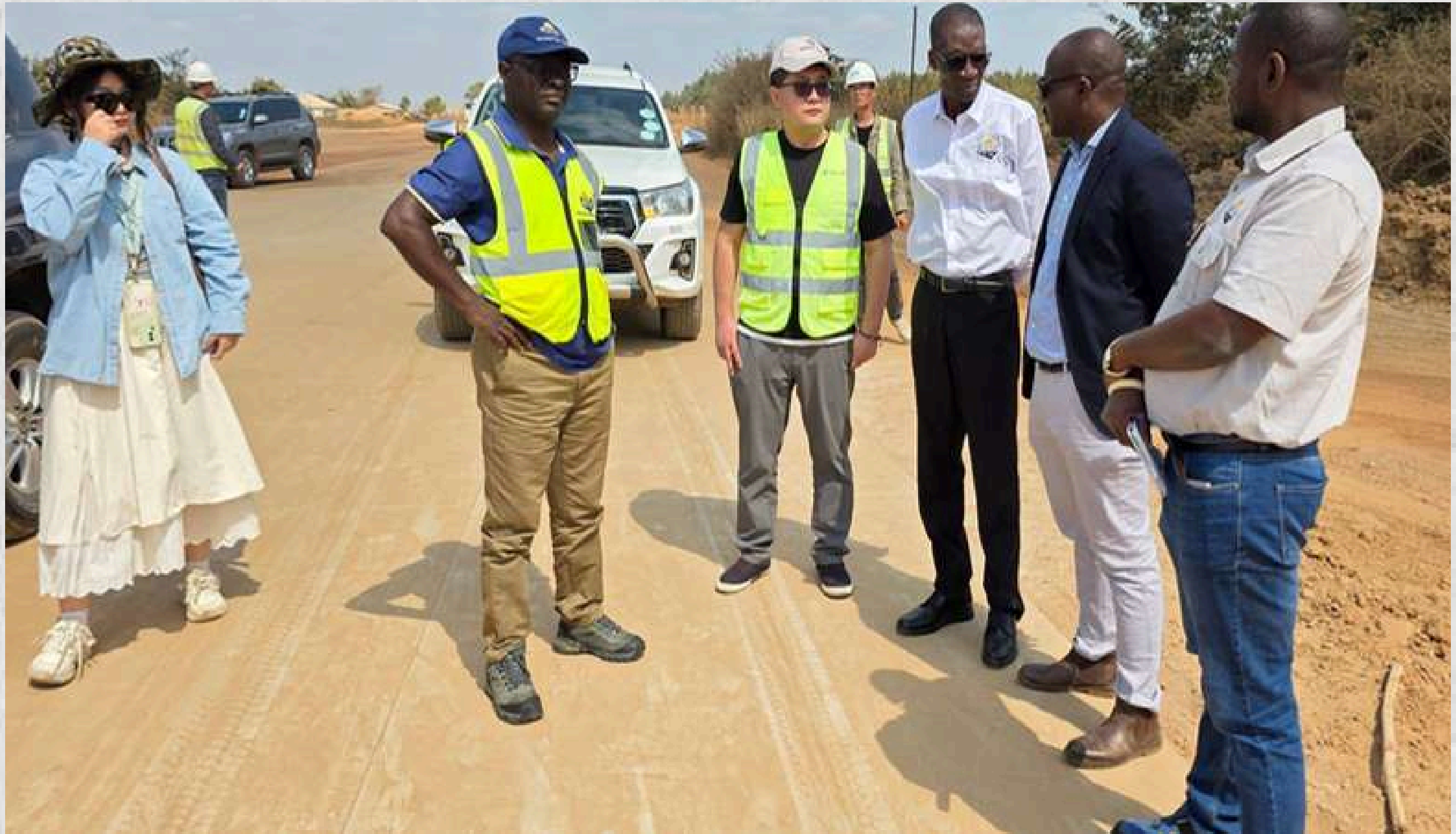
RDA Board Chairman during the inspection of rehabilitation works on the Ndola-Sakania-Mufulira Road.

Rehabilitation works on the Ndola-Sakania-Mufulira Road have advanced with 17 kilometres being paved to bituminous standard on the section between the roundabout near Levy Mwanawasa Stadium in Ndola to Sakania Border.