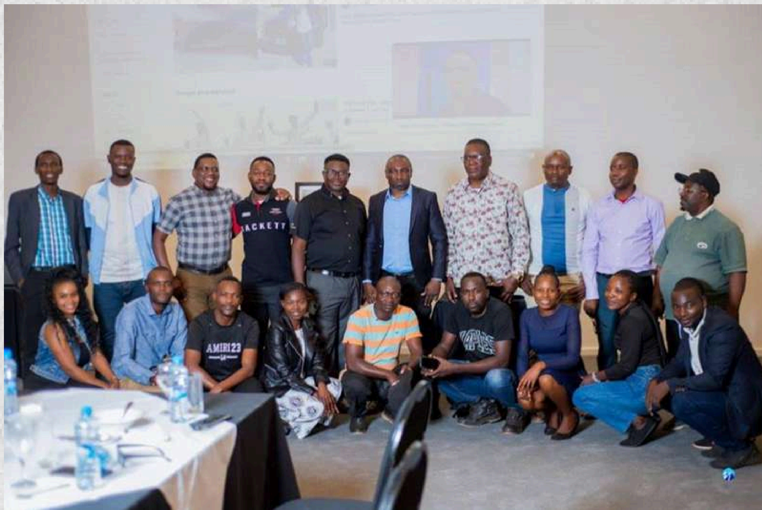
Group photo of the RDA Northern team.