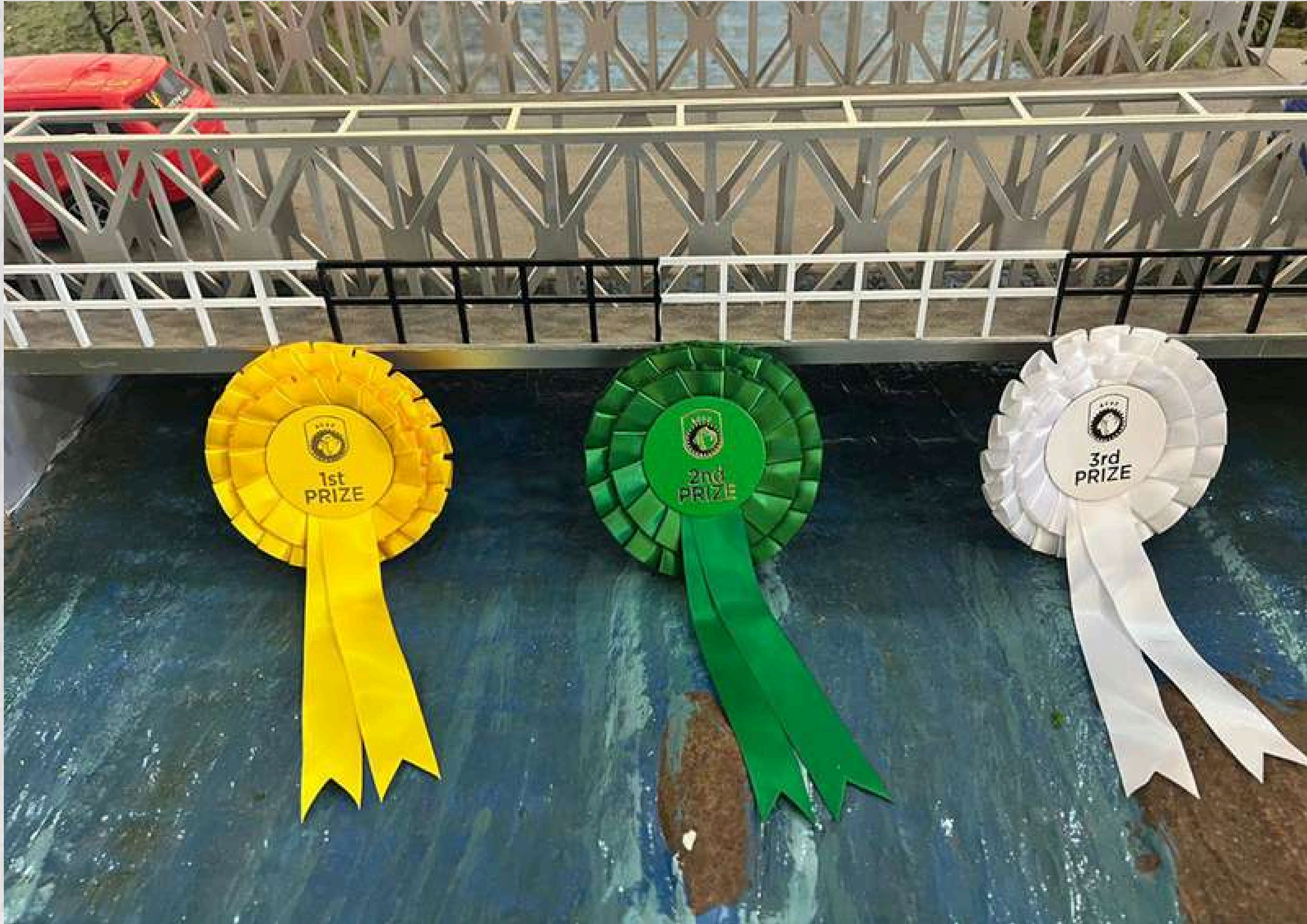
The awards as presented in the RDA "Bag of fame".

The Road Development Agency (RDA) scooped three awards during this year's 97th Zambia Agricultural and Commercial Show.