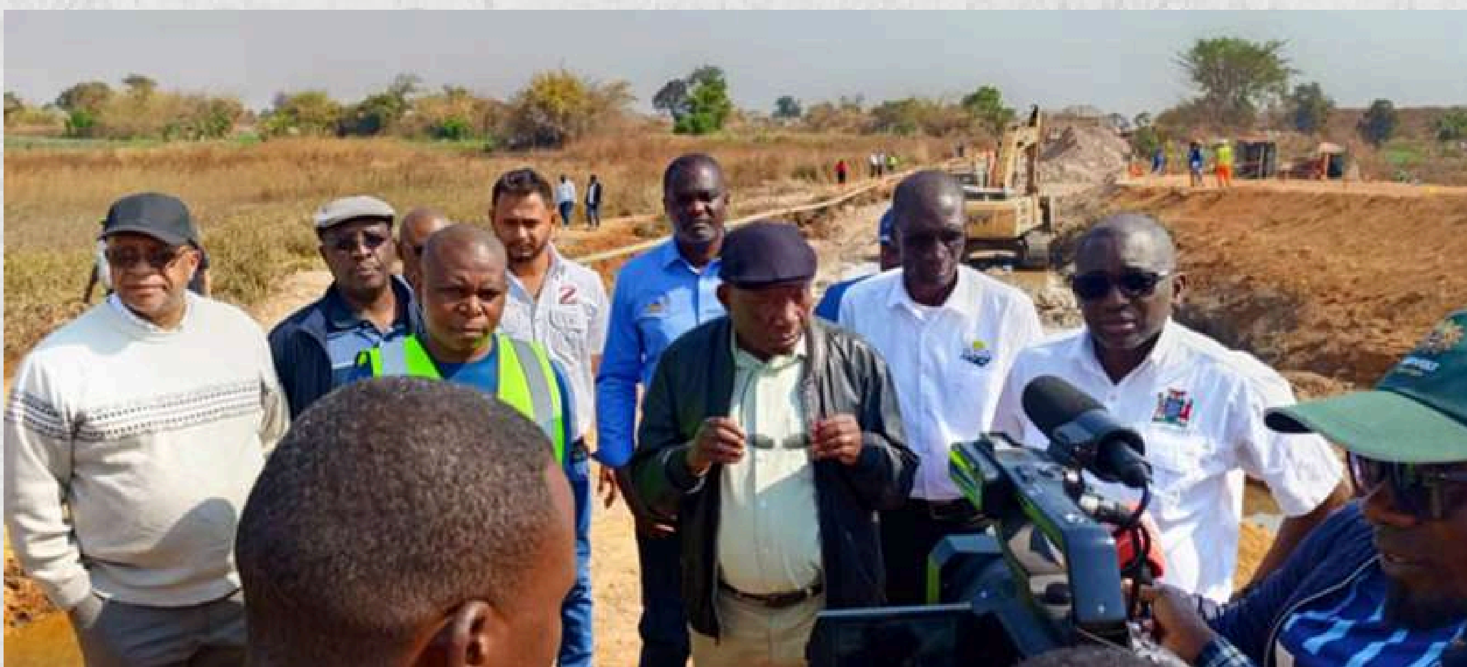
Infrastructure, Housing and Urban Development Minister, Hon. Eng. Charles Milupi inspecting ongoing construction works at the Kasumbalesa One Stop Border Post facility in Chililabombwe.