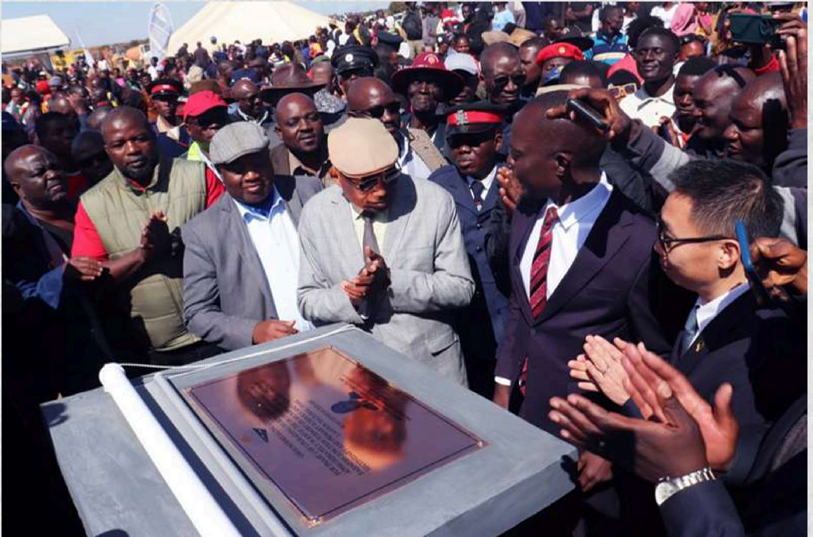
Infrastructure, Housing and Urban Development Minister, Hon. Eng. Charles Lubasi Milupi, unveils the plaque during the ground-breaking ceremony of the Blue Lagoon Road alongside Central Province Minister, Hon. Mwashike Nkulukusa, Mwebeshi Member of Parliament, Hon. Machila Jamba, Mumbwa Central Member of Parliament, Hon. Credo Nanjuwa and Chilanga Member of Parliament, Hon. Sipho Hlazo.

Infrastructure, Housing and Urban Development Minister, Hon. Eng. Charles Lubasi Milupi has launched works to upgrade to bituminous standard approximately 98 kilometres of the Blue Lagoon Road from Farmers Junction turnoff on Mumbwa Road to Muchabi Secondary and Primary Schools and 7 kilometres into the Blue Lagoon National Park.