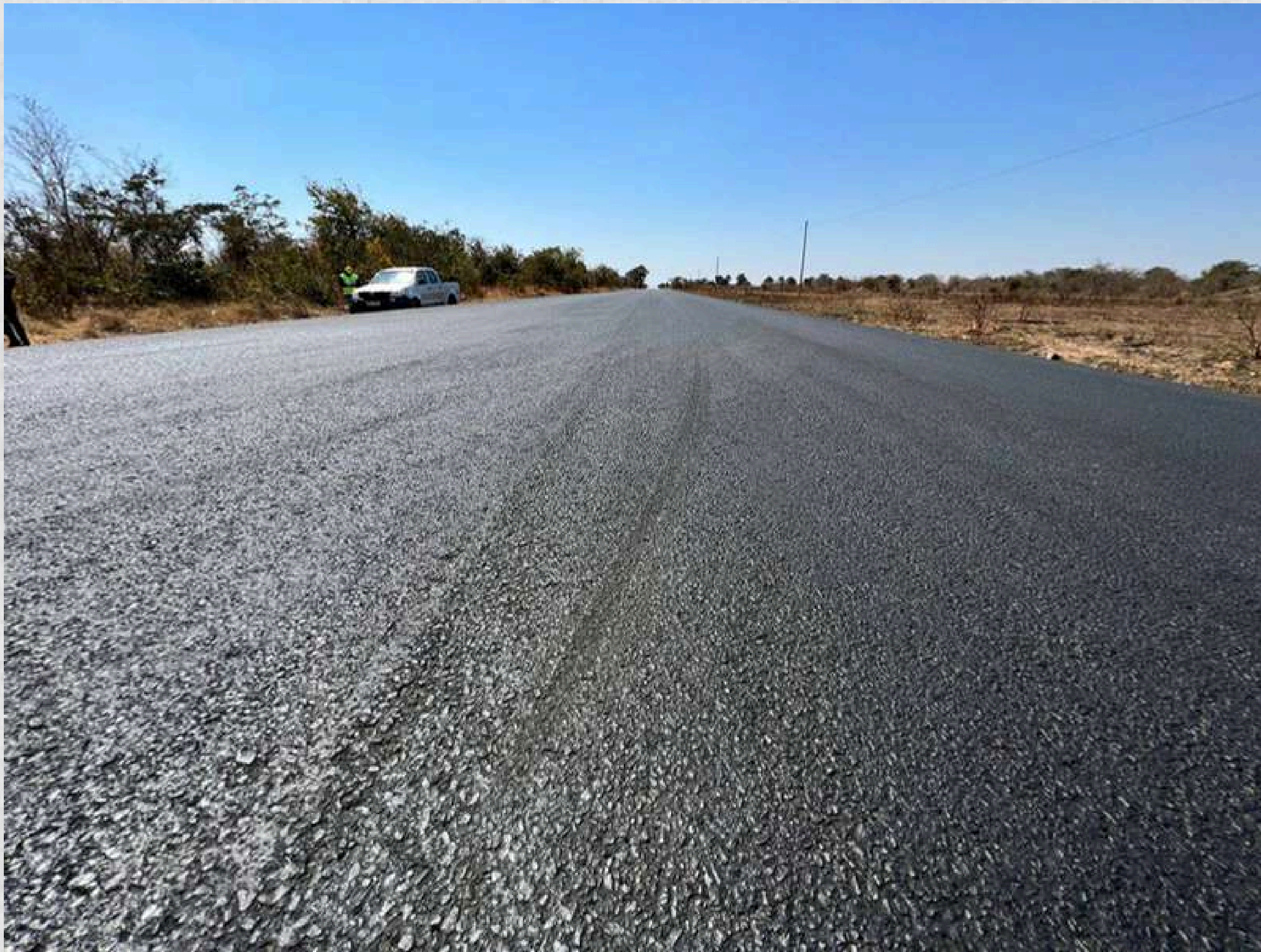
Surfaced section the Monze-Niko Road.