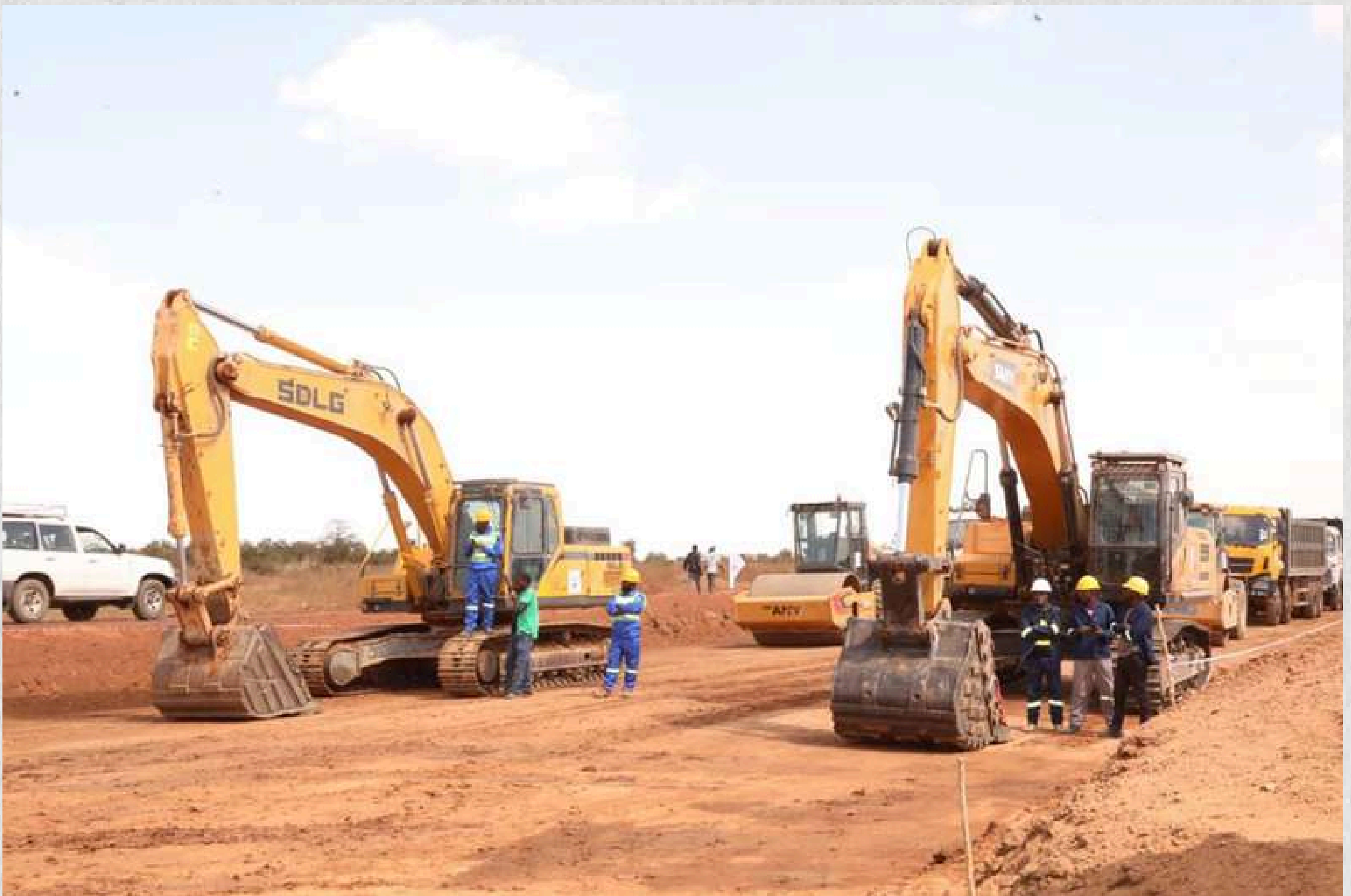
Construction equipment mobilized.

“Further, the Government expects the project to offer opportunities to small-scale contractors through sub-contracting of a portion of the works. this is government policy and must be implemented without fail,” he added.