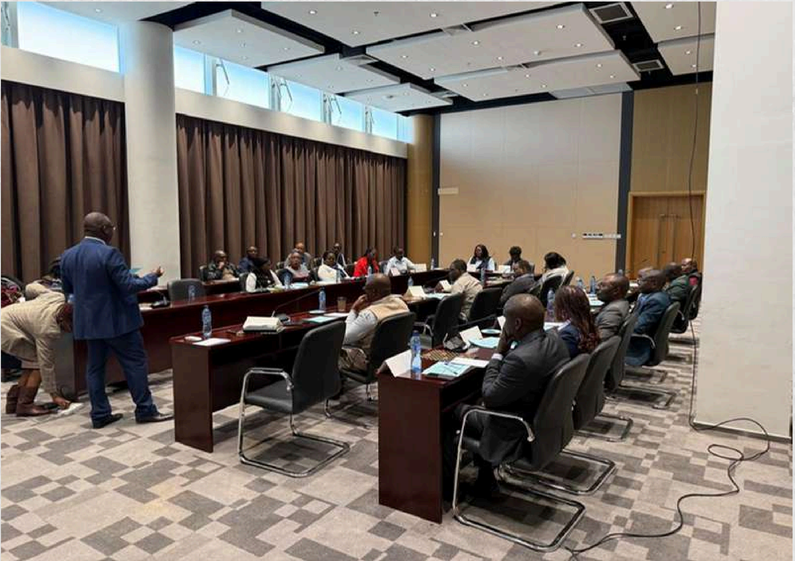
Head Office and Regional Human Capital and Administration Officers and Weighbridge Supervisors during the disciplinary procedure training held at Mulungushi Conference Centre.

The Road Development Agency (RDA) members of staff from Human Capital and Administration and Weighbridge Supervisors recently participated in the Disciplinary Procedure Training facilitated by the Zambia Federation of Employers (ZFE).