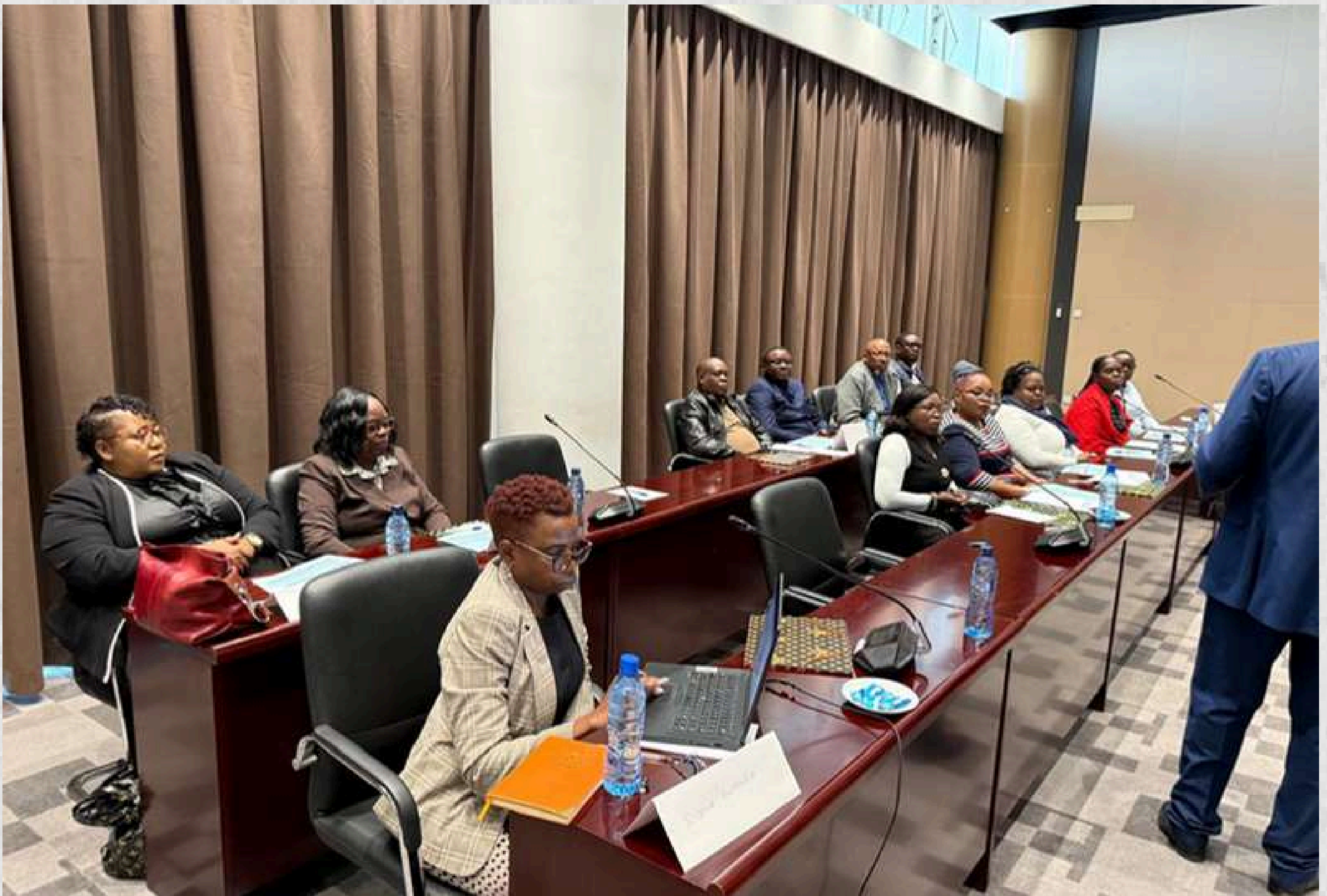
Head Office and Regional Human Capital and Administration Officers and Weighbridge Supervisors during the disciplinary procedure training held at Mulungushi Conference Centre.