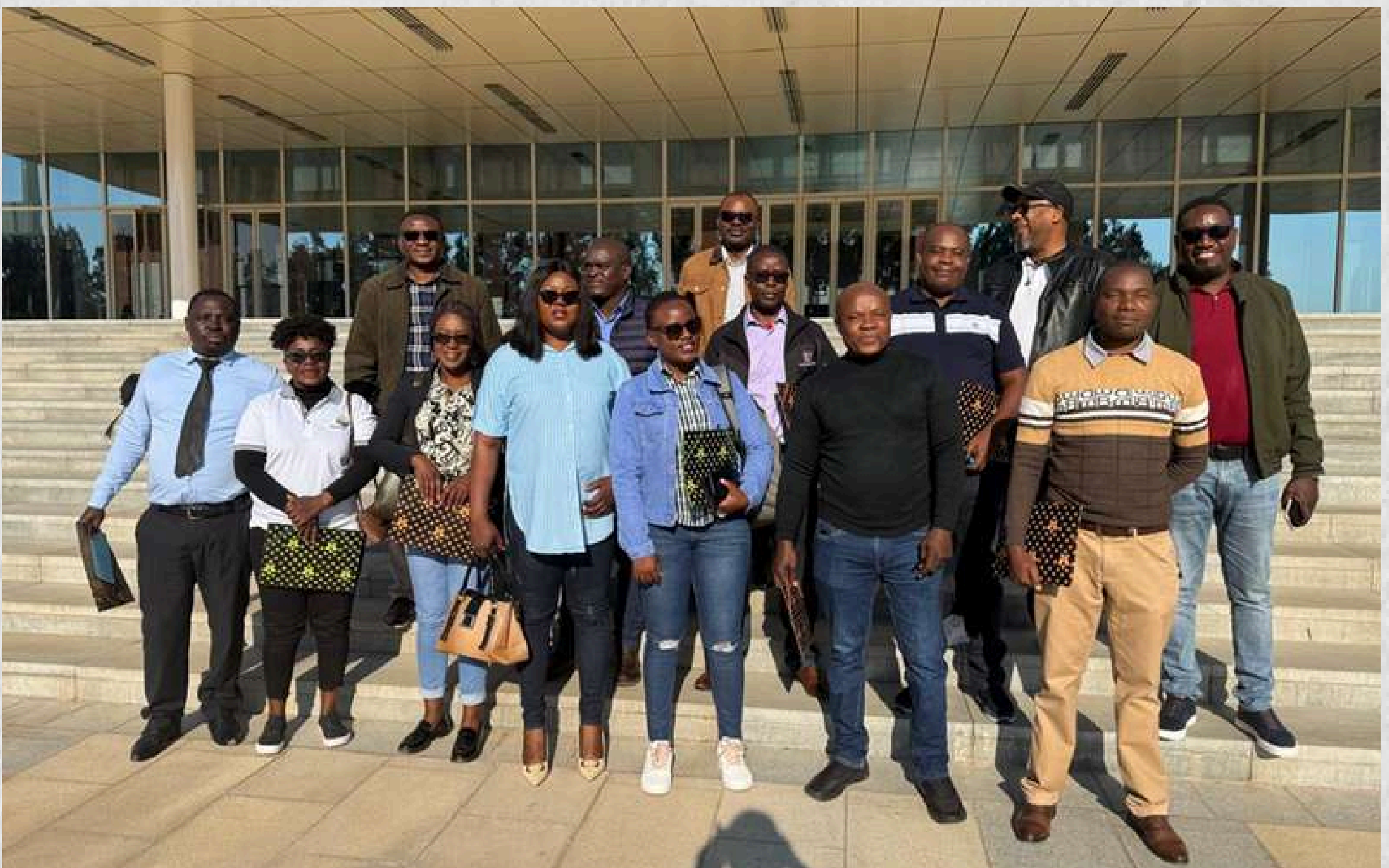
A group photo after the training.