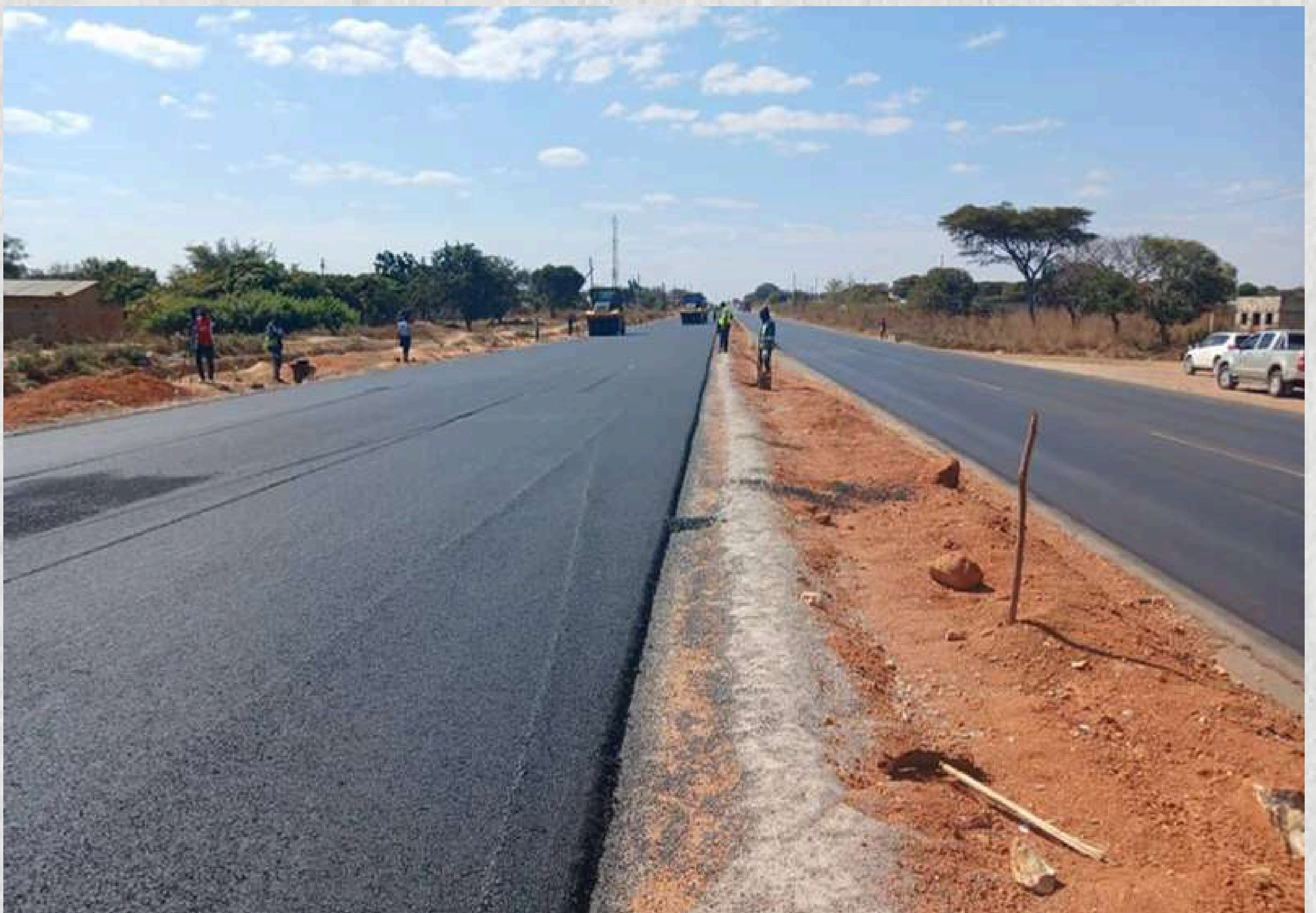
The surfaced section of the Lusaka-Ndola Dual Carriageway.

Works on the 45 kilometres Masangano-Fisenge-Luanshya Road are 100% complete and the road has been opened to traffic.