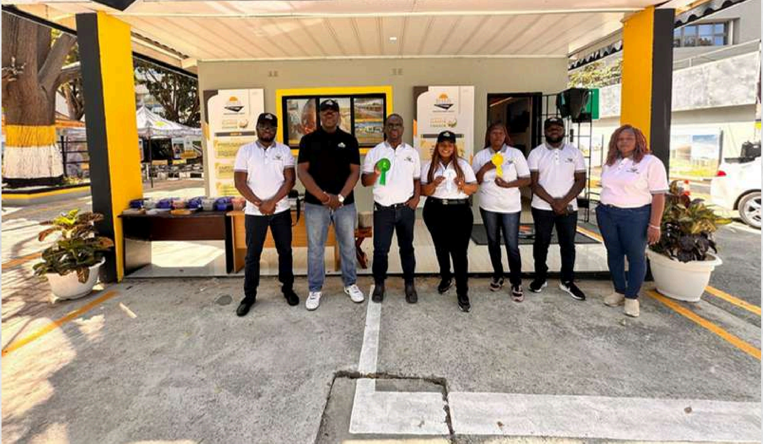
The winning team at the stand after the awards.