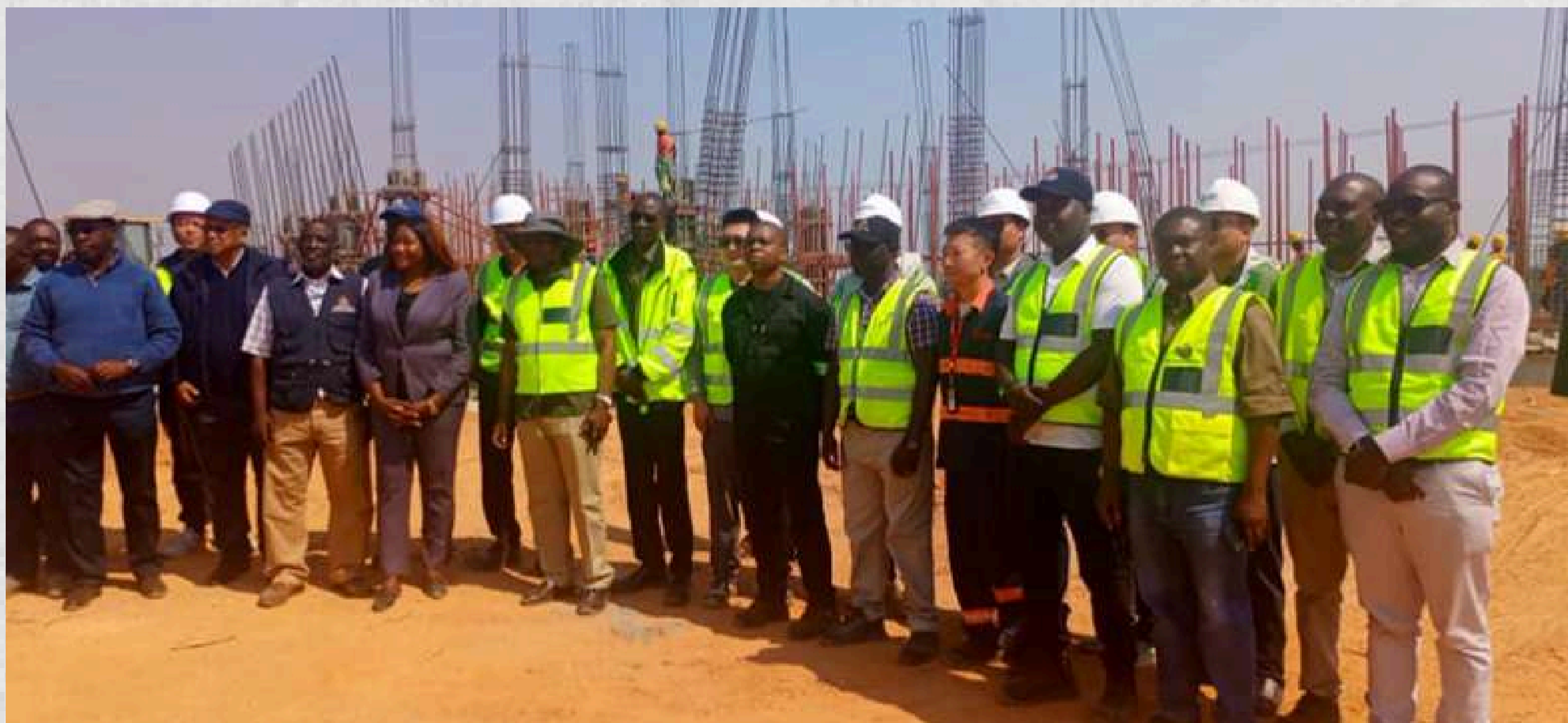
Infrastructure, Housing, and Urban Development Minister, Hon. Eng. Charles Lubasi Milupi and entourage during the inspection of works at Sakania Border.