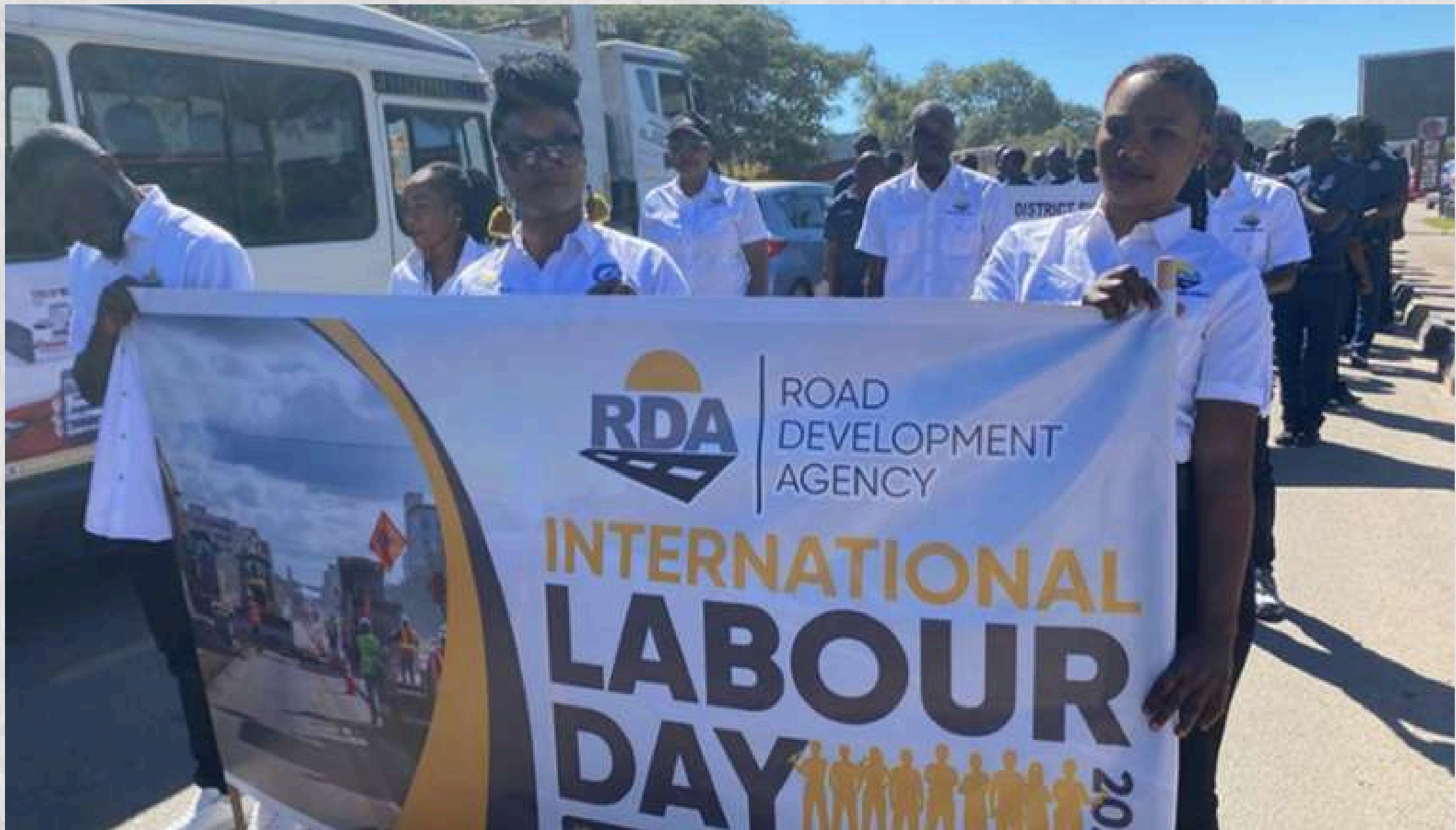
Copperbelt Province team.