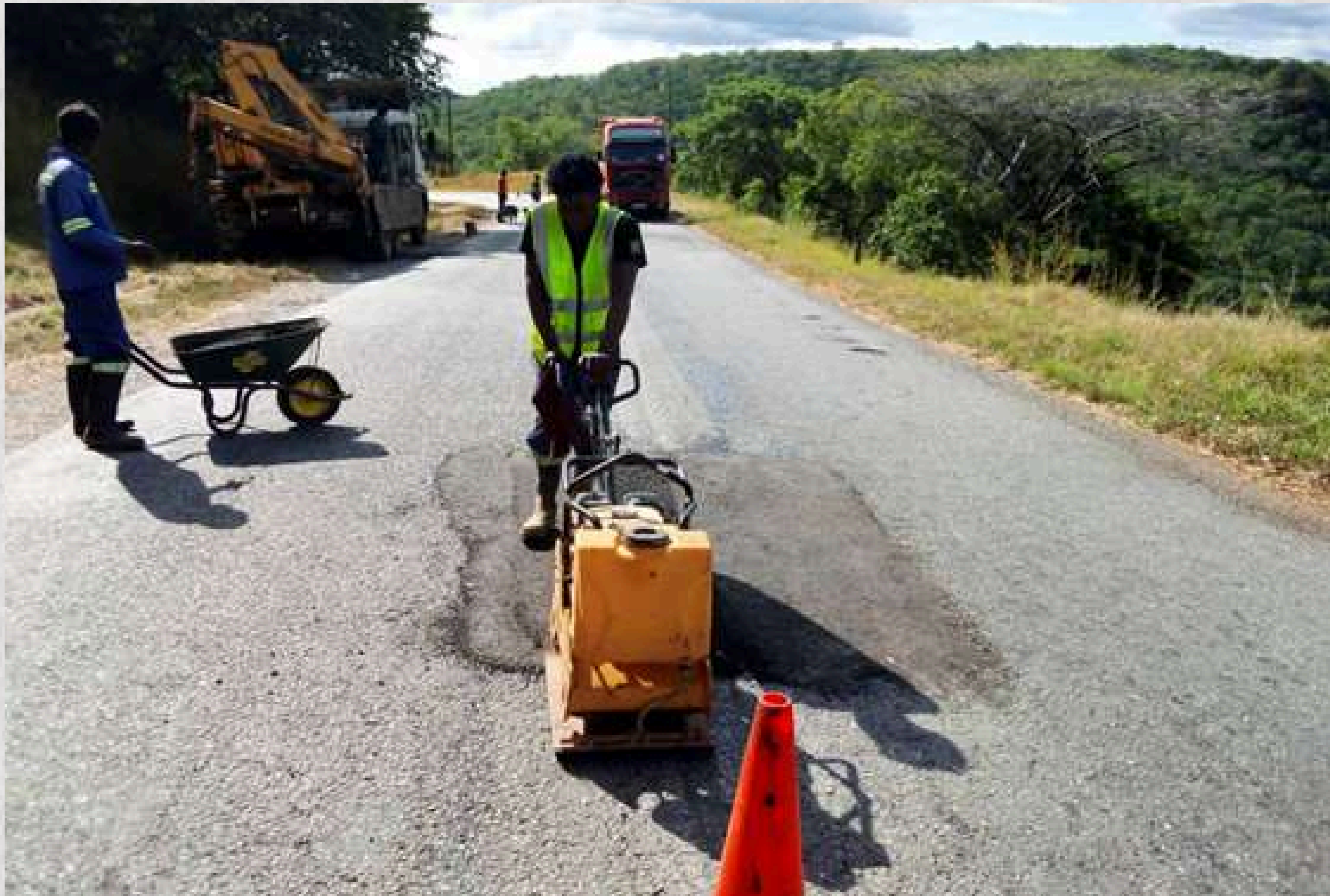
RDA Pothole patching Team on Great East (T4) in Luangwa.

“To make it possible for our office to carry out the maintenance works of the entire stretch of Great East Road that falls within our jurisdiction, we employed 68 temporary workers who were divided into three groups. One group was camped at Luangwa Bridge area and was working in the western direction towards Lukwipa area.