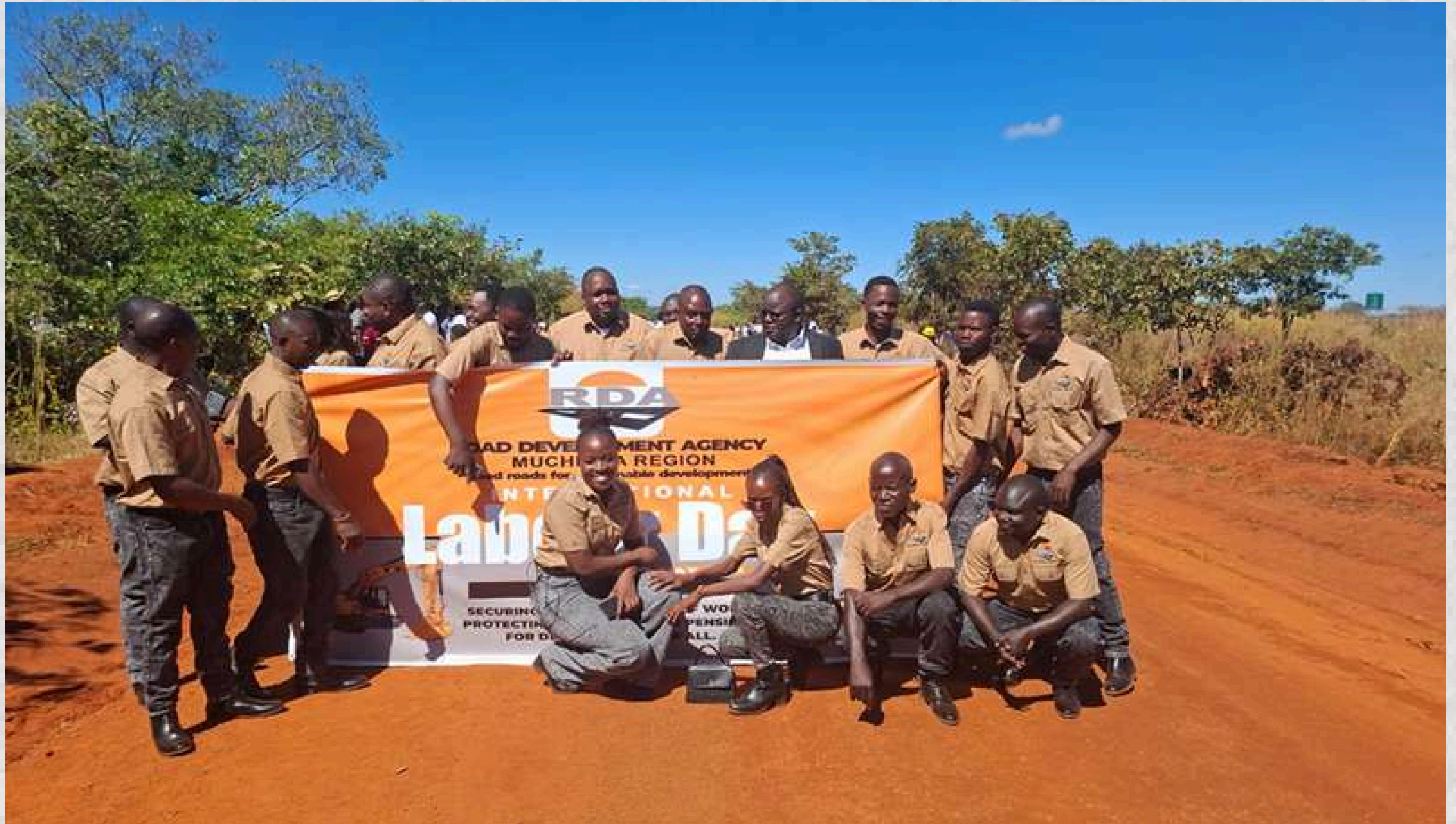
Muchinga Provincial Office team during the Labour Day celebration in Chinsali District.