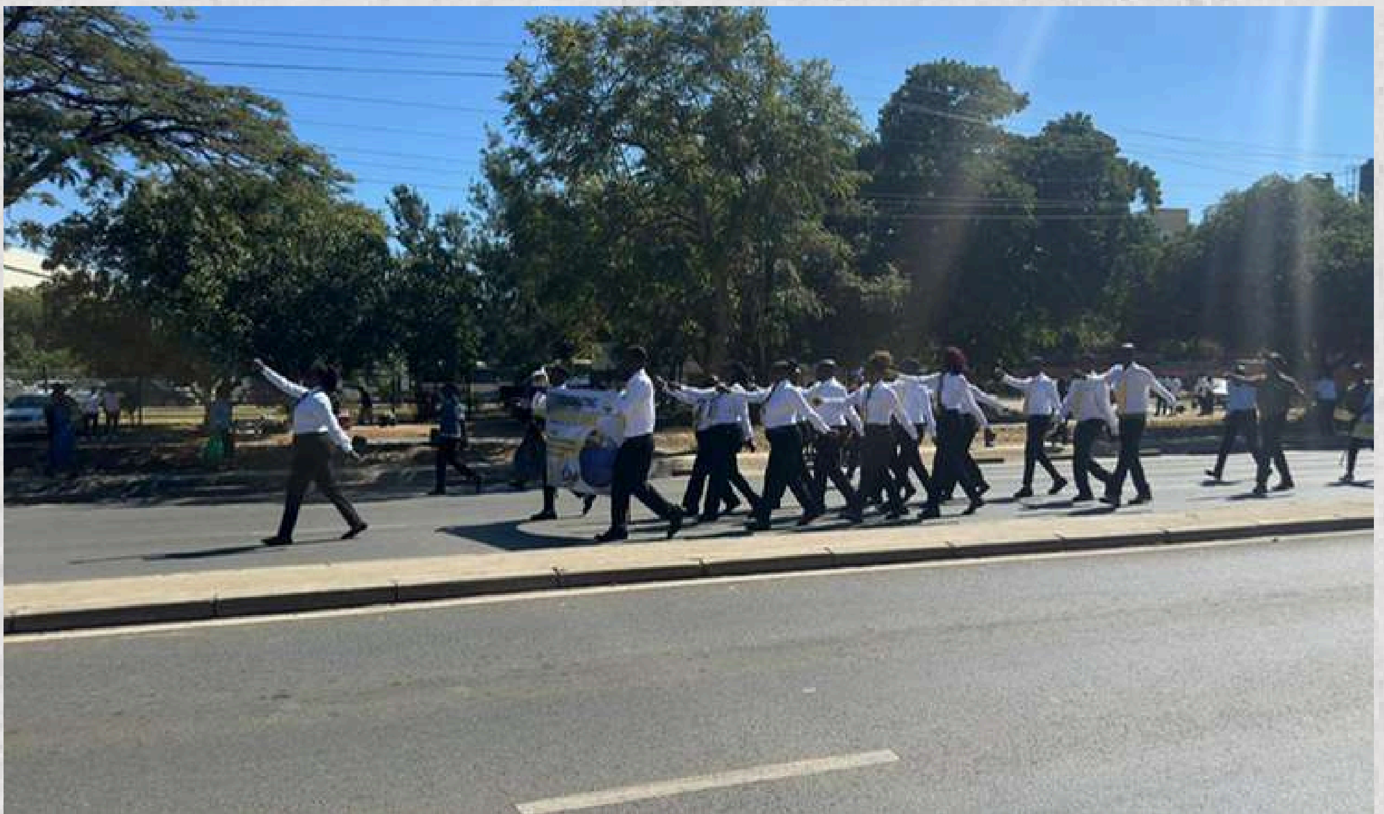
RDA Head Office and Lusaka Provincial team during a march past at the Freedom Statue.