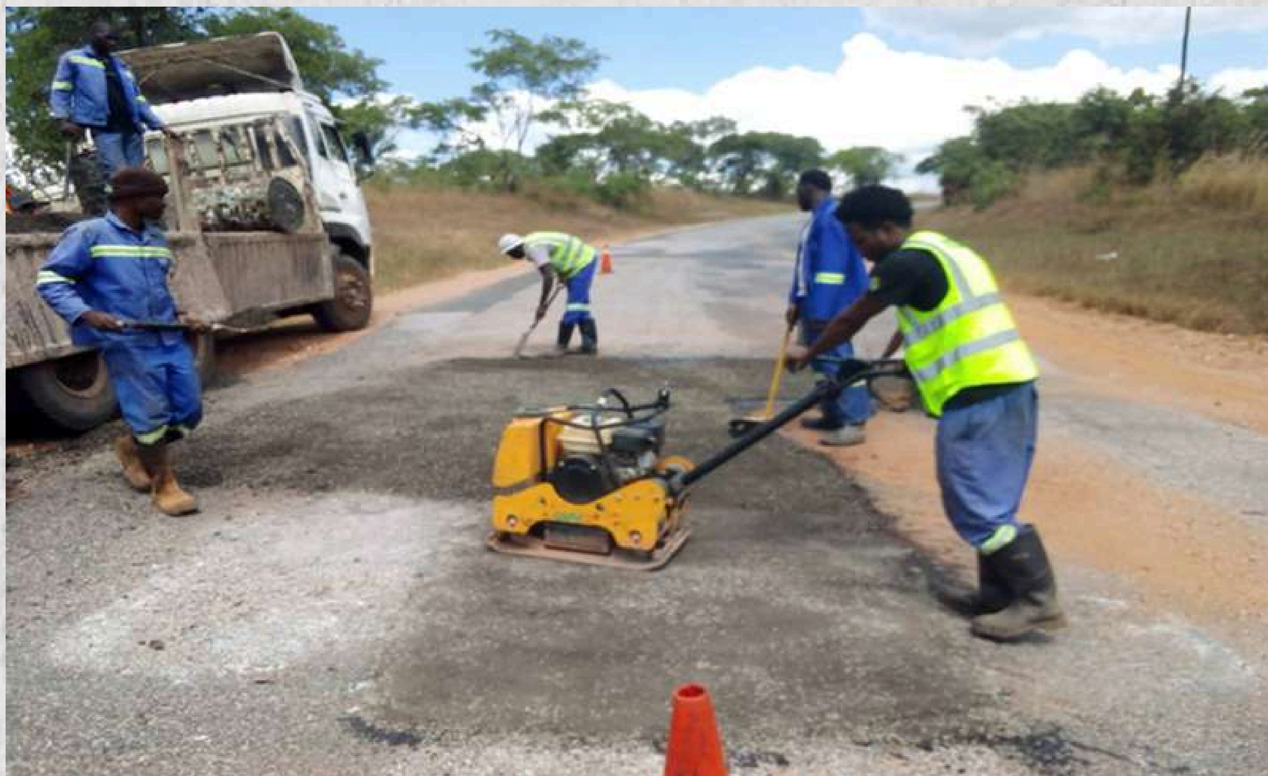
RDA Lusaka Provincial Office technical staff patching the Great East road (T4) in Rufunsa District.

I should mention that the entire road pavement for Great East Road in Lusaka Province has deteriorated and needs to be fully rehabilitated with possible dualisation of the stretch from Airport roundabout to Chongwe Weighbridge.”