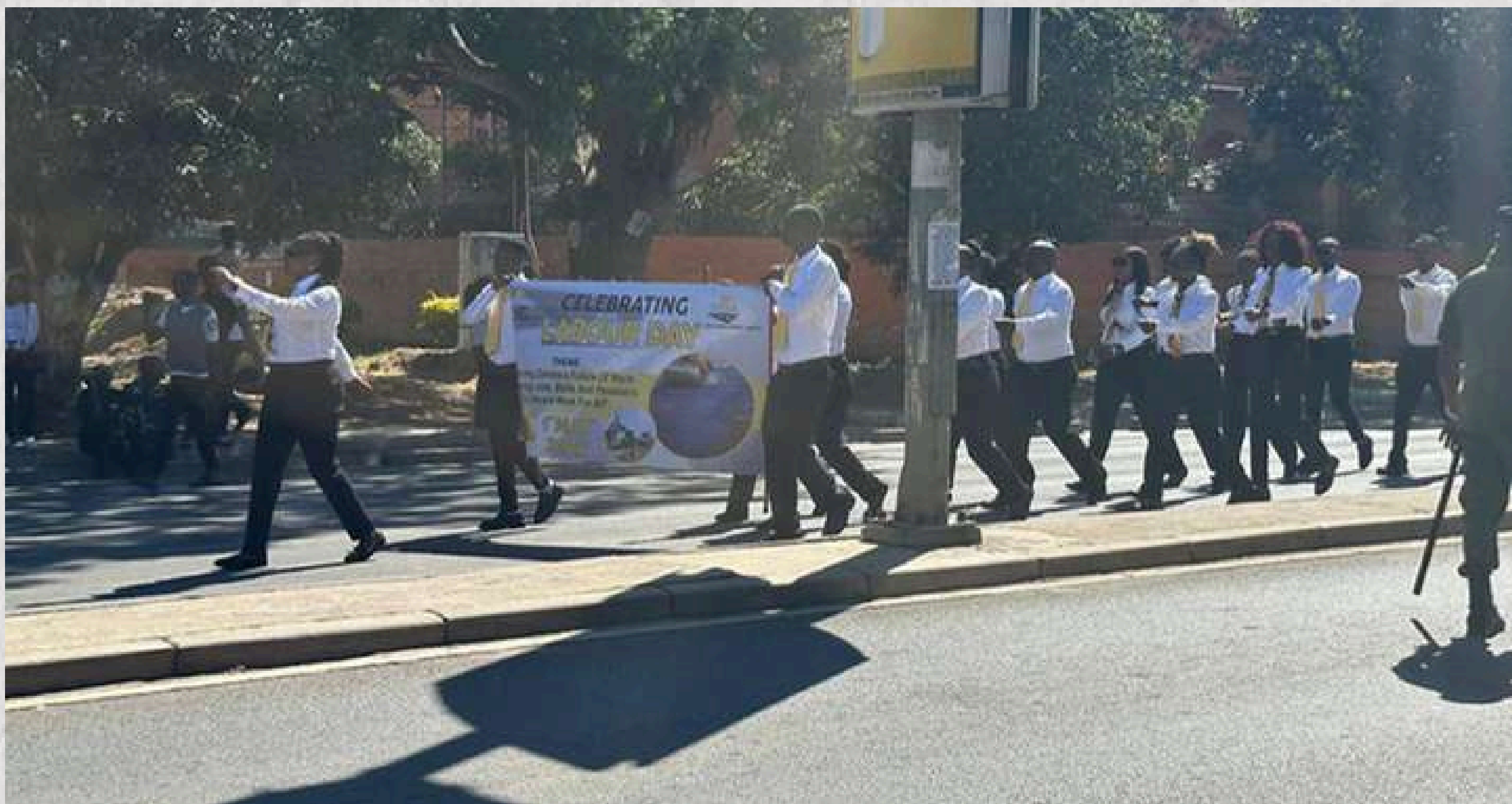
RDA Head Office and Lusaka Provincial team during a march past at the Freedom Statue.

The following RDA employees from Head Office and Lusaka Provincial Office received awards: