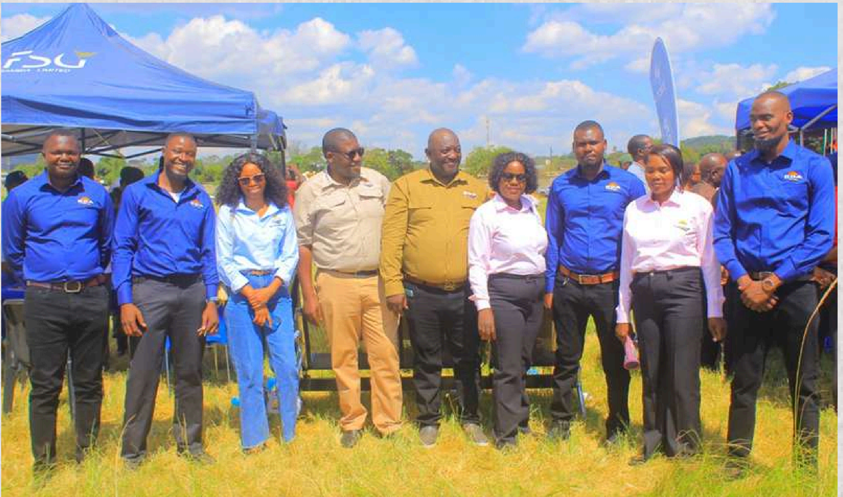
Eastern Provincial Office team during the Labour Day Awards.