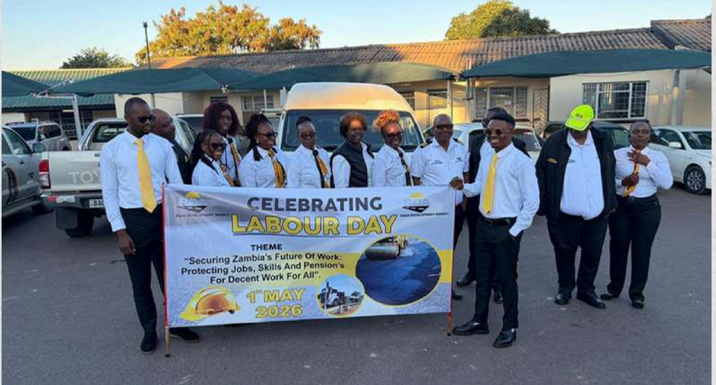
RDA Head Office and Lusaka Provincial team during a march past at the Freedom Statue.