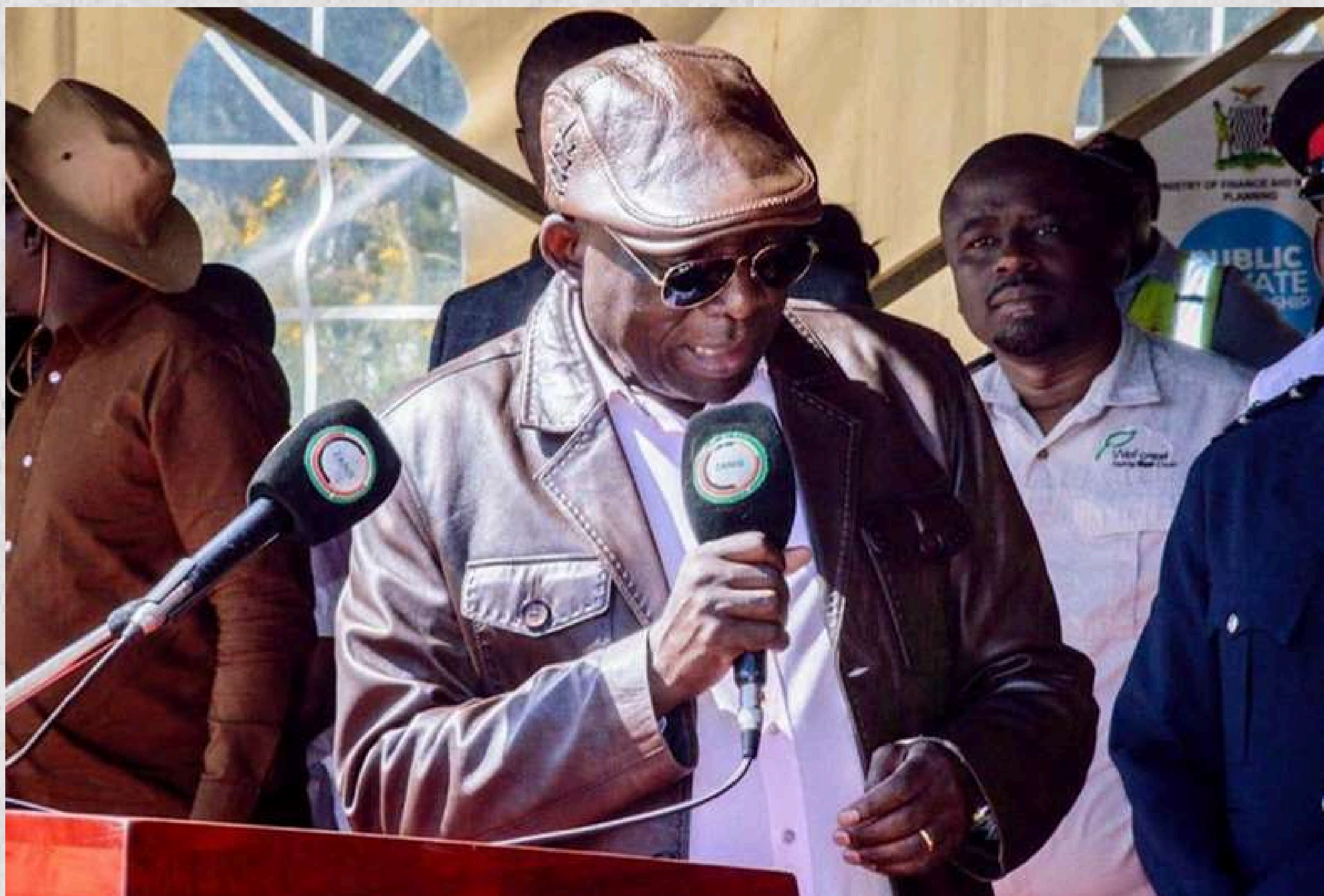
Minister of Infrastructure, Housing and Urban Development, Hon. Eng. Charles Milupi during the groundbreaking ceremony in Mpongwe.

Hon. Eng. Milupi said Mpongwe, Machiya and Ngabwe were areas with vast agricultural potential.