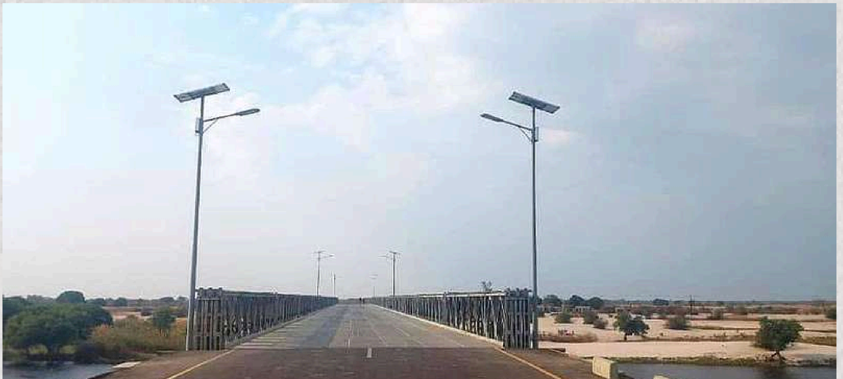
Silanda Bridge in Kalabo District, Western Province.

President Hakainde Hichilema recently commissioned two bridges in Western Province.