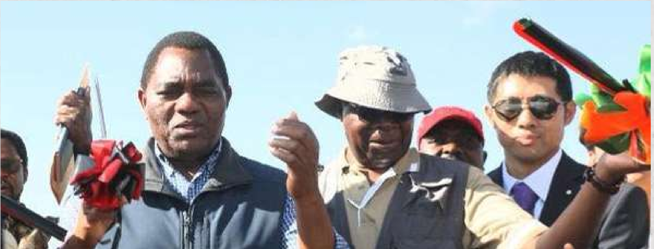
President Hakainde Hichilema during the commissioning of the Luanginga and Silanda Bridges.

“Many people drowned while trying to cross to the other side. We chose to build these bridges in their honour. Traveling from Liuwa Constituency to Kalabo District was once a major challenge, this is how we remember those we lost.