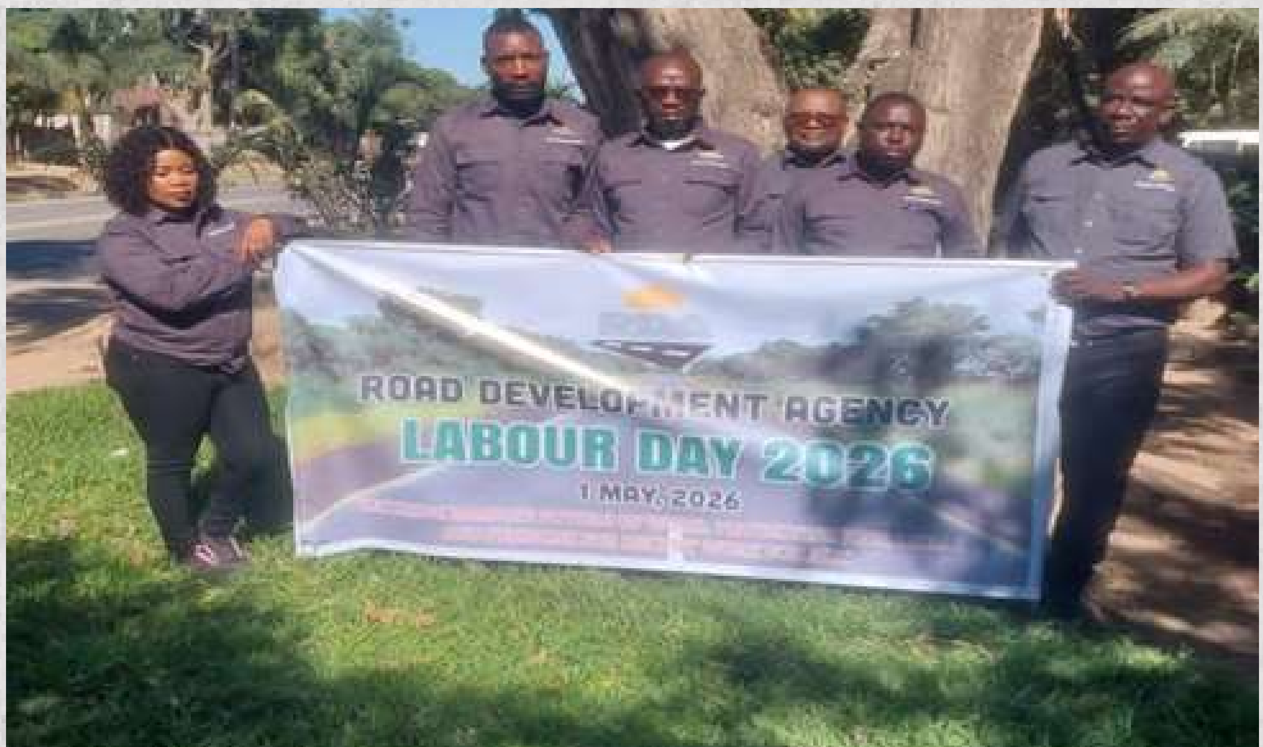
Team Southern Province.