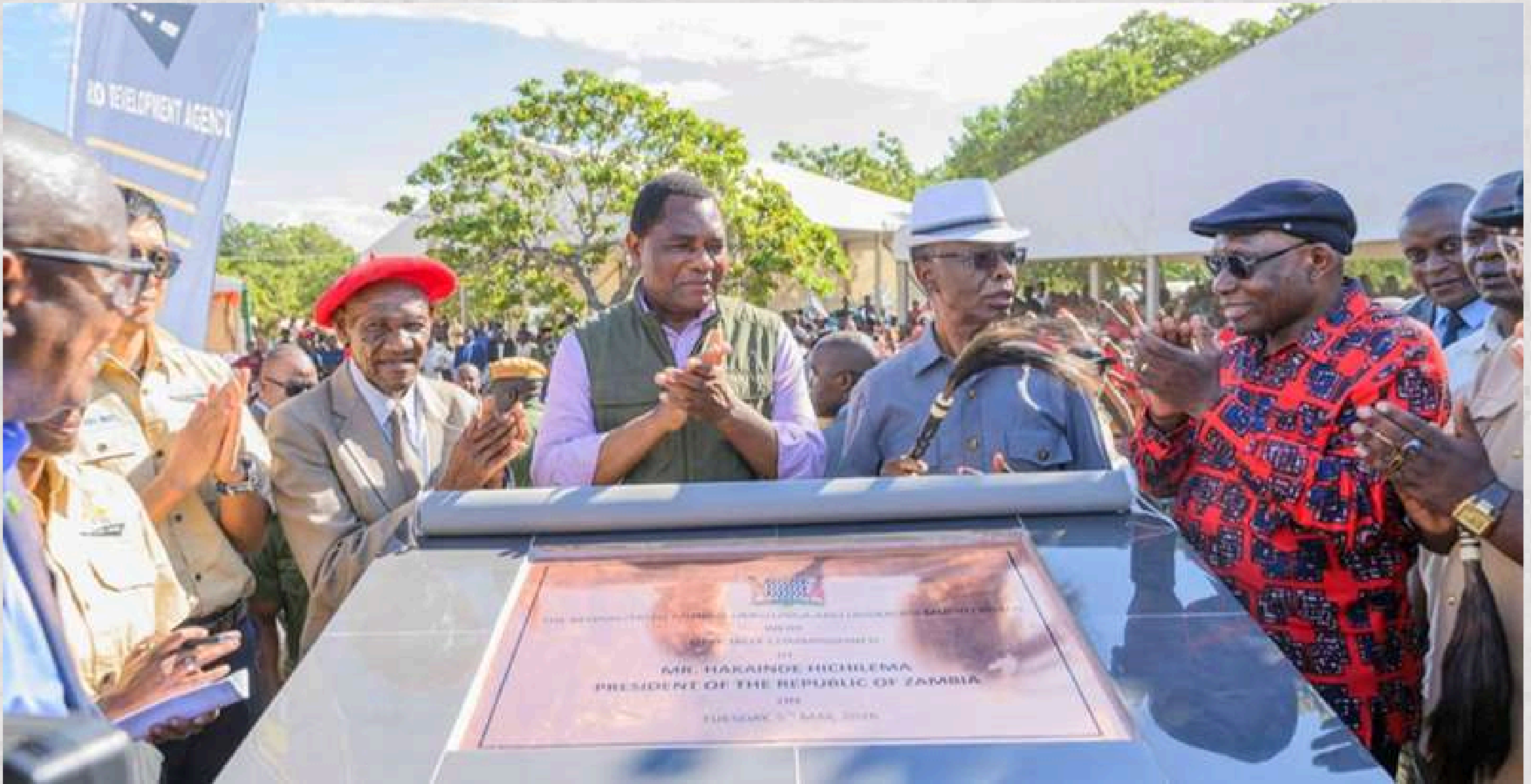
President Hakainde Hichilema ( c ) during the commissioning of the Mongu-Limulunga Road in Western Province.

The Head of State reaffirmed the Government's commitment to infrastructure development across the country.