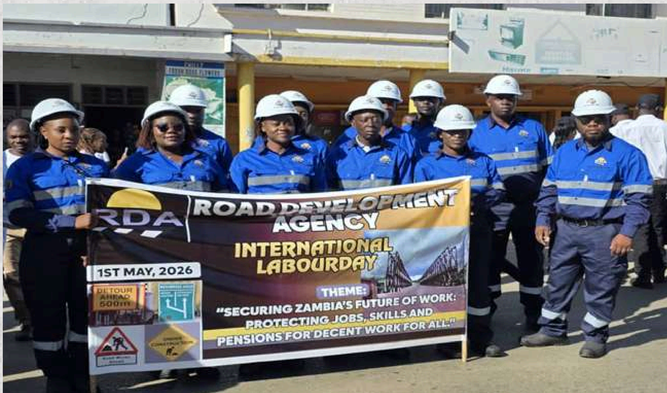
RDA Central Provincial team.