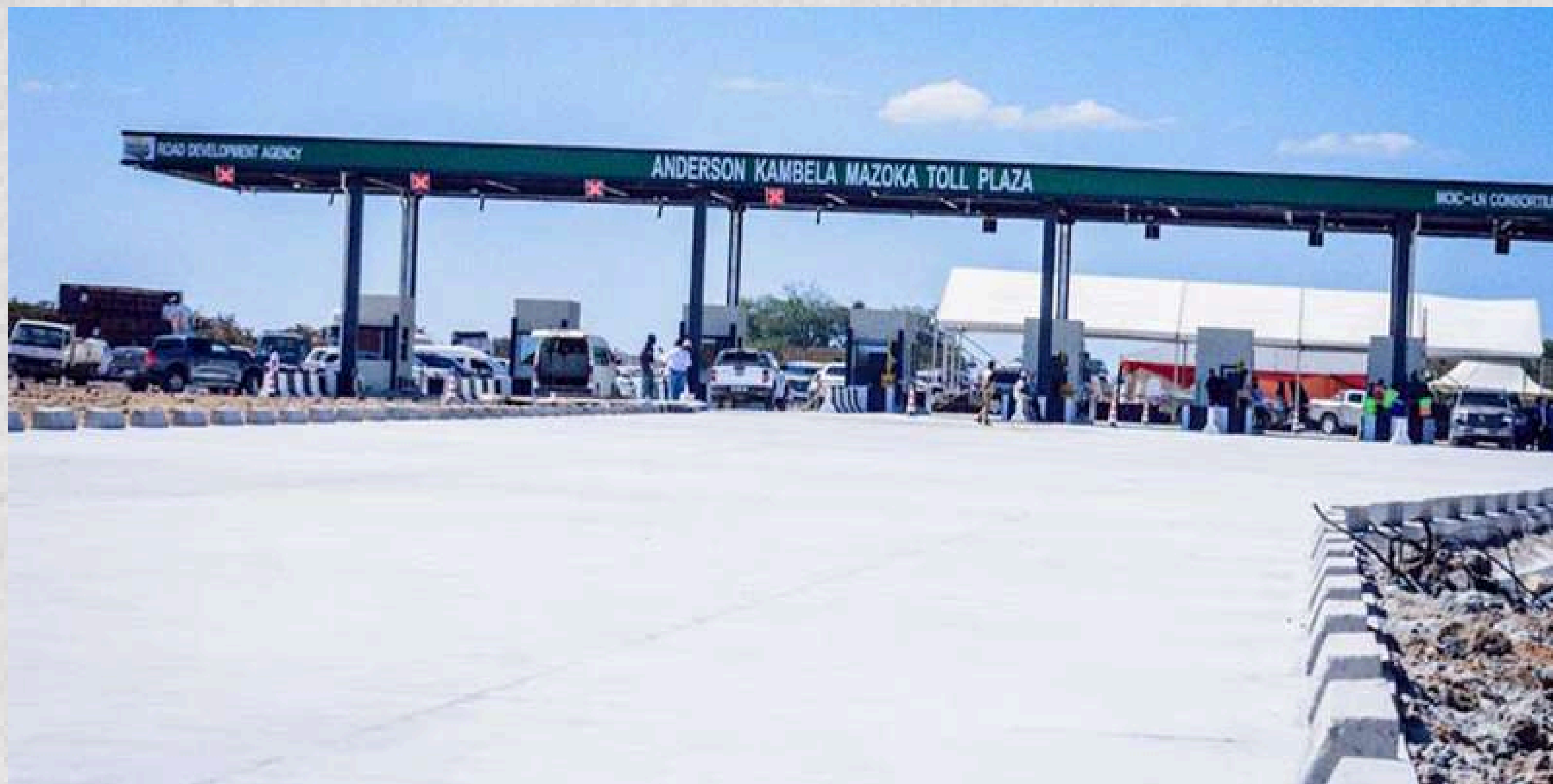
Anderson Kambela Mazoka Toll Plaza.

Government on 13th May 2026 commissioned the Anderson Kambela Mazoka Toll Plaza situated along the Lusaka–Ndola Dual Carriageway between Landless Corner and the Kabwe Bypass Road.