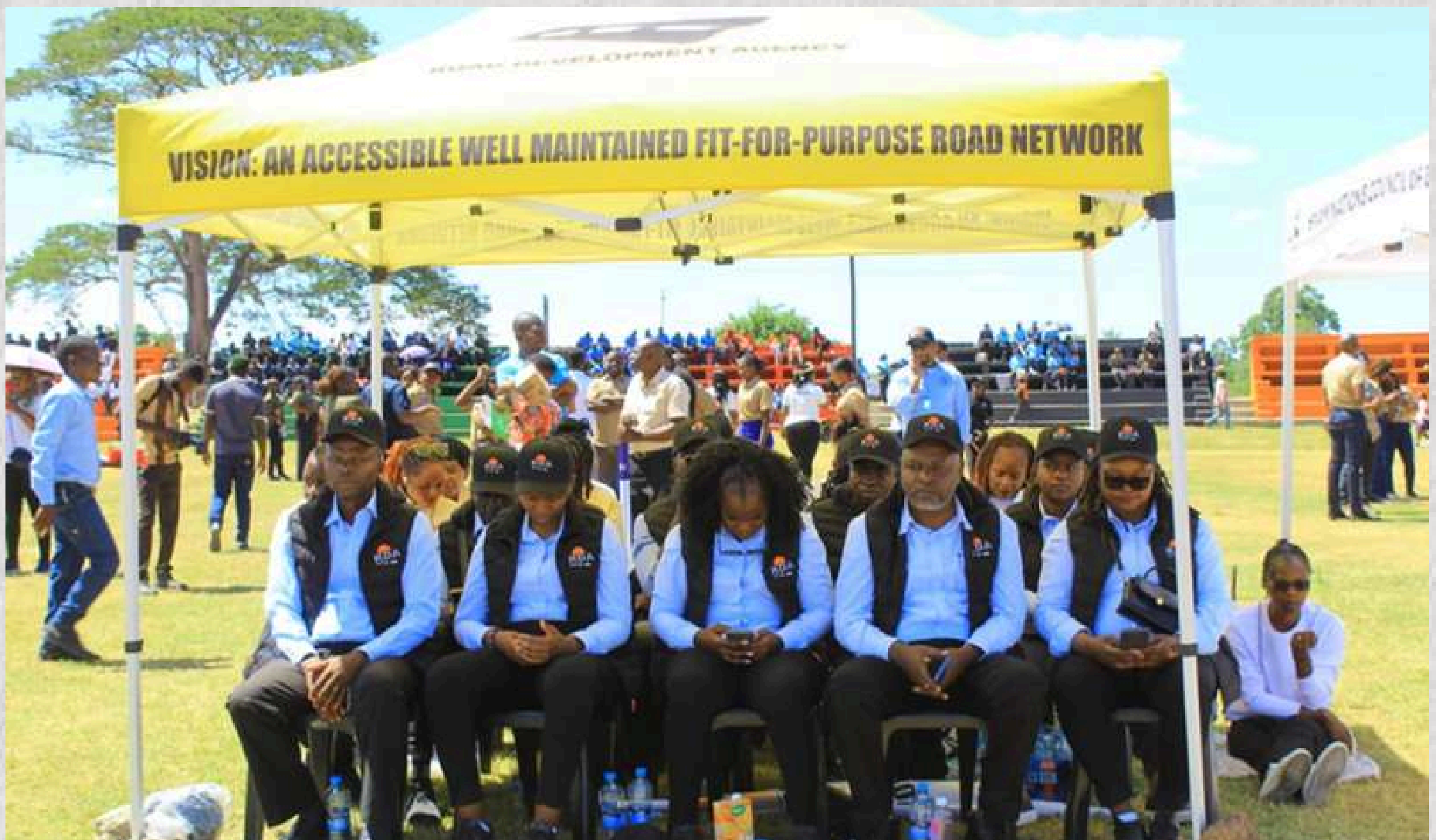
The Luapula team during the Labour Day Celebration at Kaela Stadium in Mansa, Luapula Province.