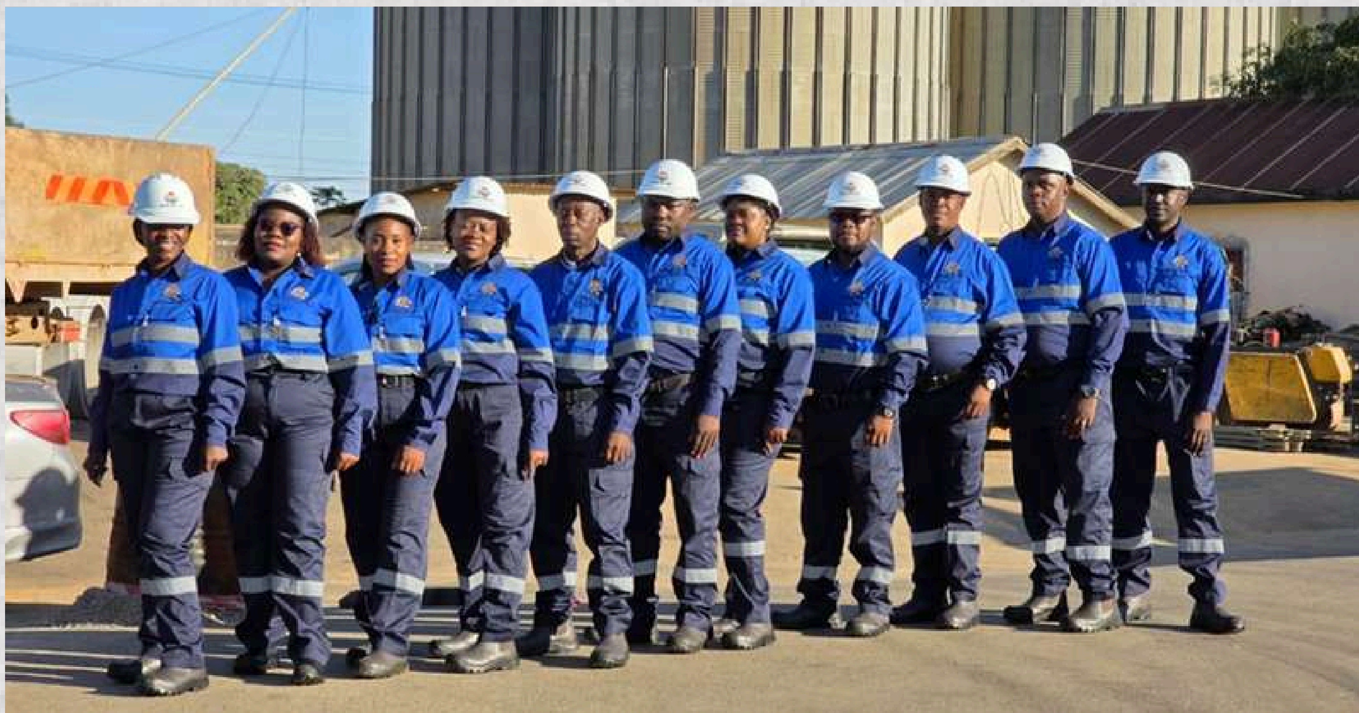
Central Provincial Office scooped the overall best dressed during the celebrations.

Meanwhile, the RDA Central and Luapula Provincial Offices stood out during the celebrations, emerging as the Overall Best Dressed Marchers at the commemorations held at Godfrey Ucar Chitalu Stadium in Kabwe District, Central Province and at Kaole stadium in Mansa, Luapula Province respectively