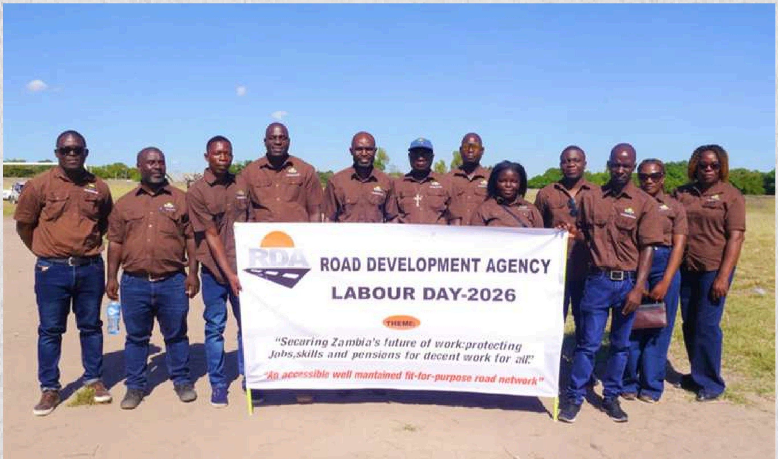
Western Province team.