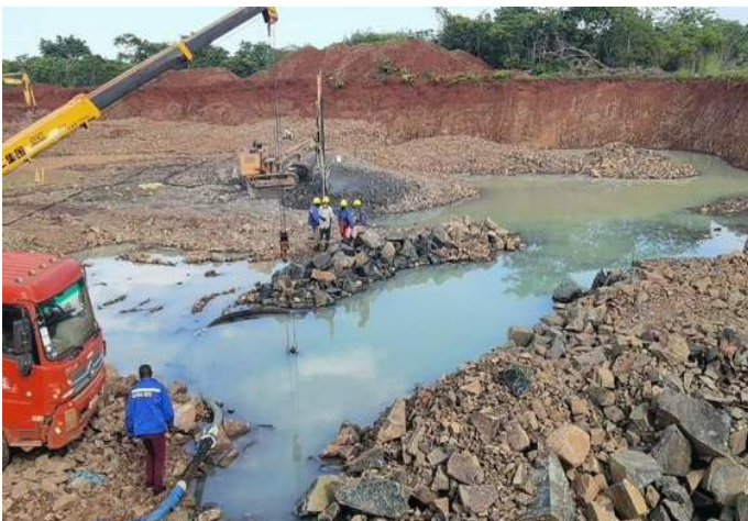
Borrow pit for rock extraction.

The contractor has also delivered all the components for the crusher plant to be located in Mangango Area and has since started mobilizing for base installations of the plant.