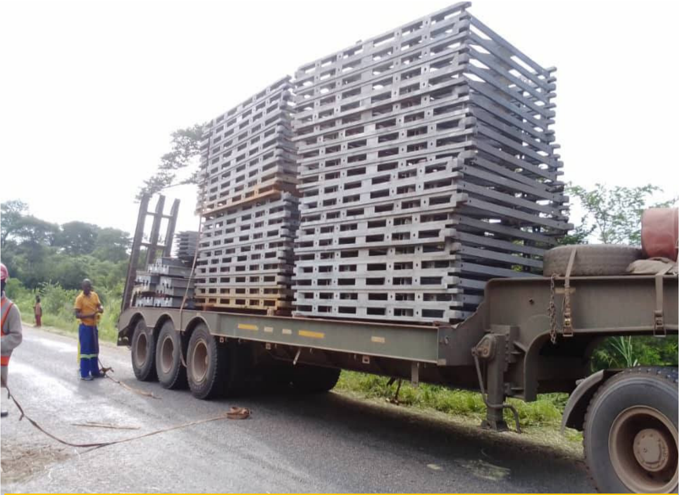
A Low Bed Truck loaded with ACROW Bridge components on site in Chinyunyu, Rufunsa District.

On Tuesday night, 28 th January 2025, a section of Great East Road was partially washed away at Chinyunyu in Rufunsa District after a heavy downpour that was experienced in the area.