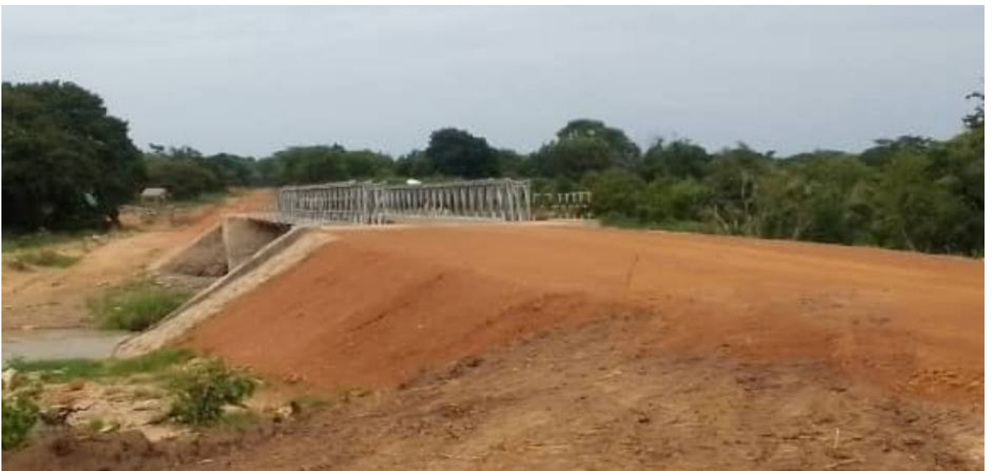
A completed section of the approach road to the bridge.

A total number of local people employed on the bridge and road project is 70.