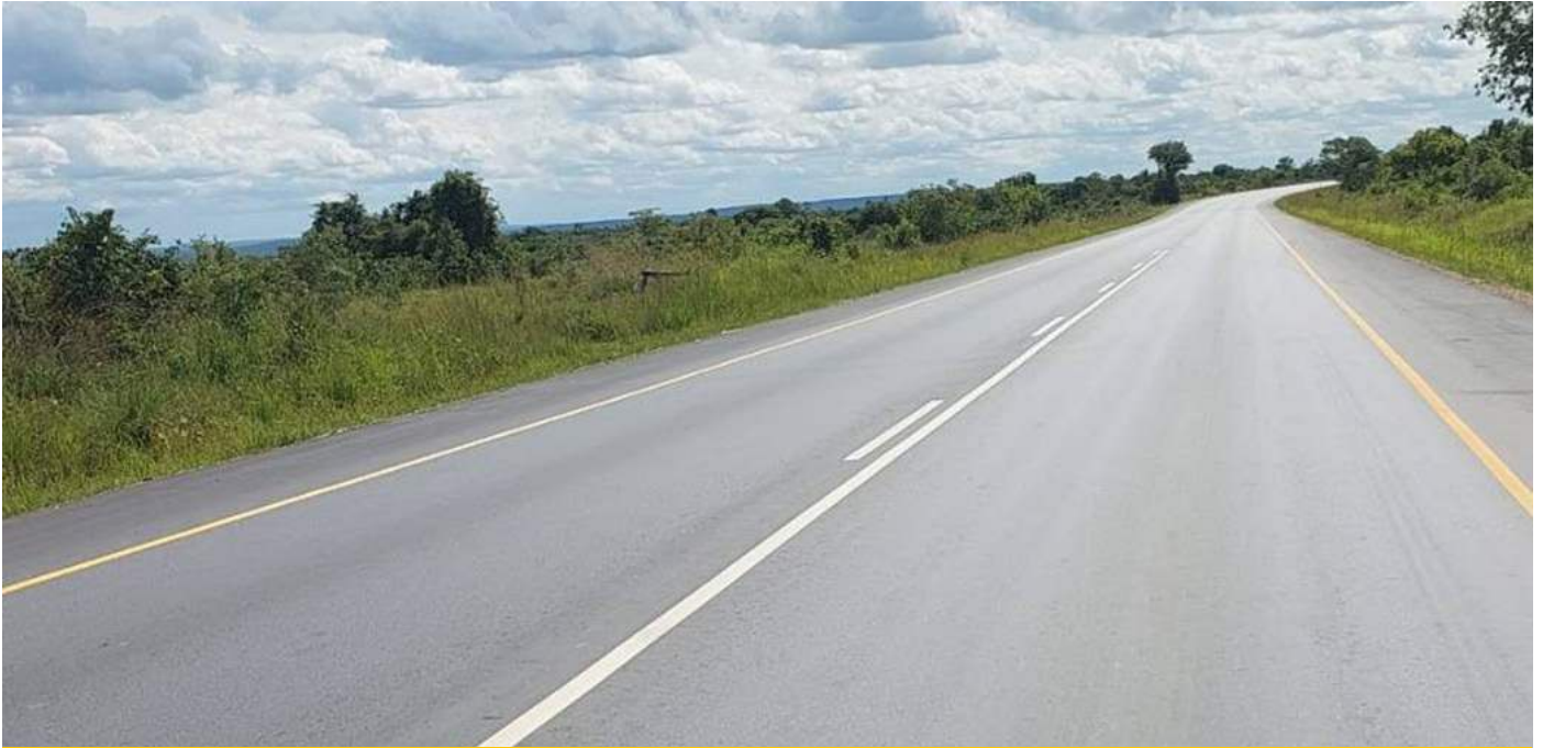
Completed section of the Chinsali-Nakonde Road with road marking.

W orks on the Chinsali-Nakonde Road in Muchinga Province have substantially been completed with the project recording an impressive 99.4 % completion point.