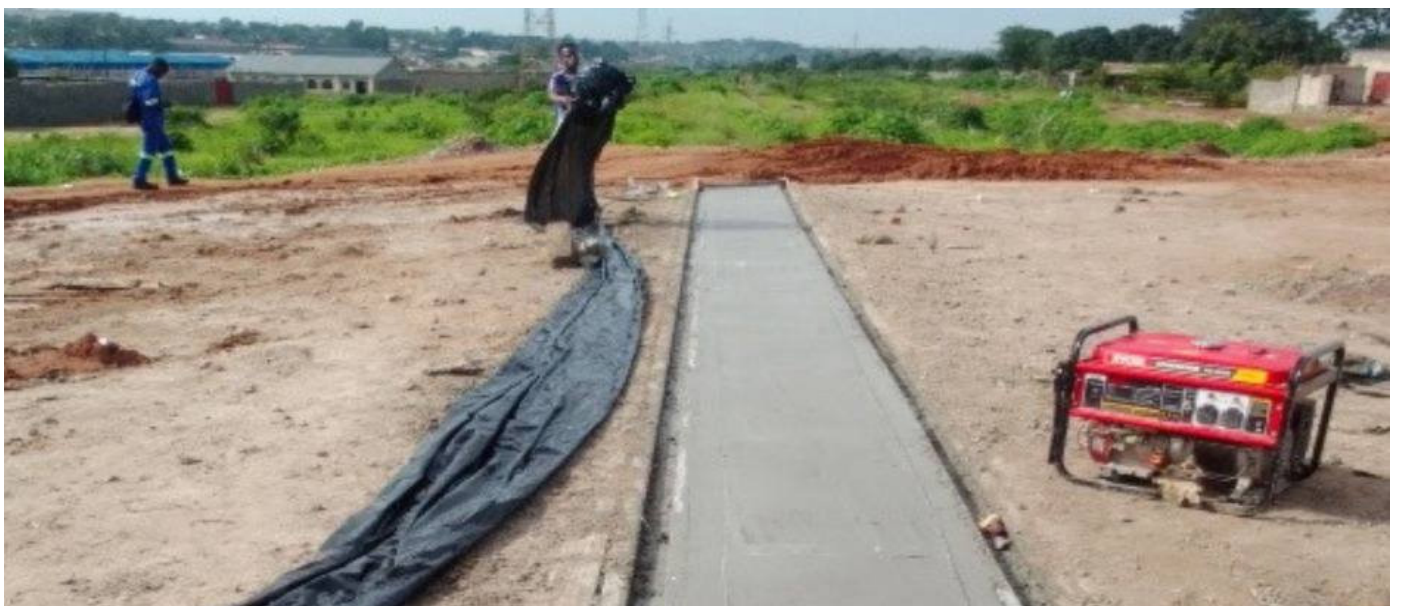
Concrete cast at a railway crossing on Chibuluma Road.