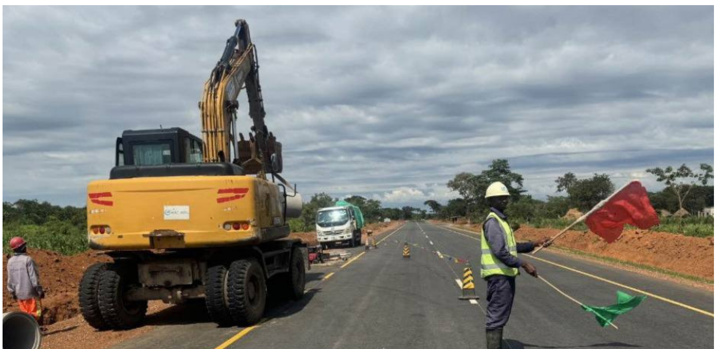
Road markings works in progress on the Masangano-Fisenge-Luanshya Road.