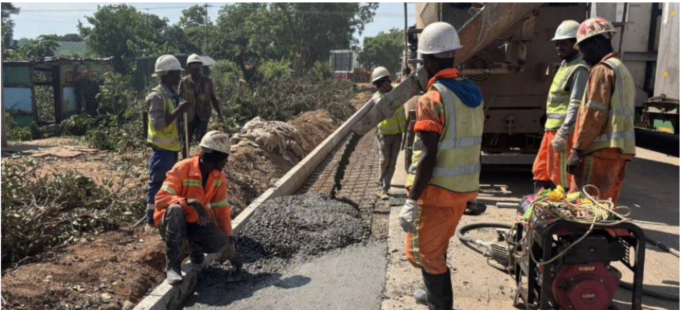
Concrete casting for a concrete road shoulder.