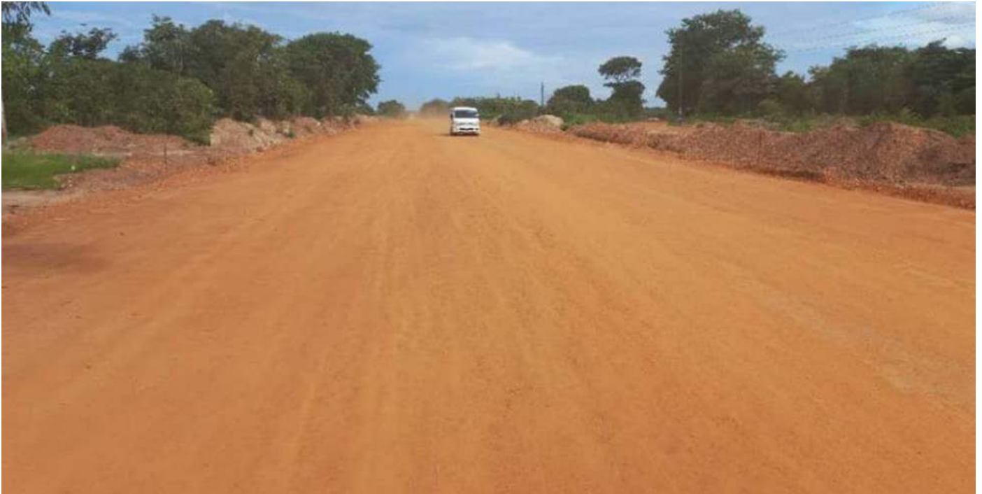
Lusaka-Mongu Road works from Tateyoyo Gate to Katunda/Lukulu Junction in Western Province.

The Road Development Agency (RDA) has engaged China Geo-Engineering Corporation in a joint venture with Chipangano Builders Limited for the rehabilitation of approximately 87.3 kilometres of the Lusaka-Mongu Road (M9) from Tateyoyo Gate to Katunda/Lukulu Junction in Western Province.