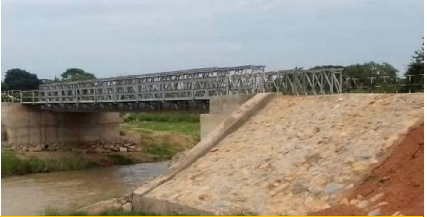
The Aluni ACROW Bridge in Kanchibiya District.

The Government through the Road Development Agency (RDA) has constructed the Aluni ACROW Bridge in Kanchibiya District in Muchinga Province.