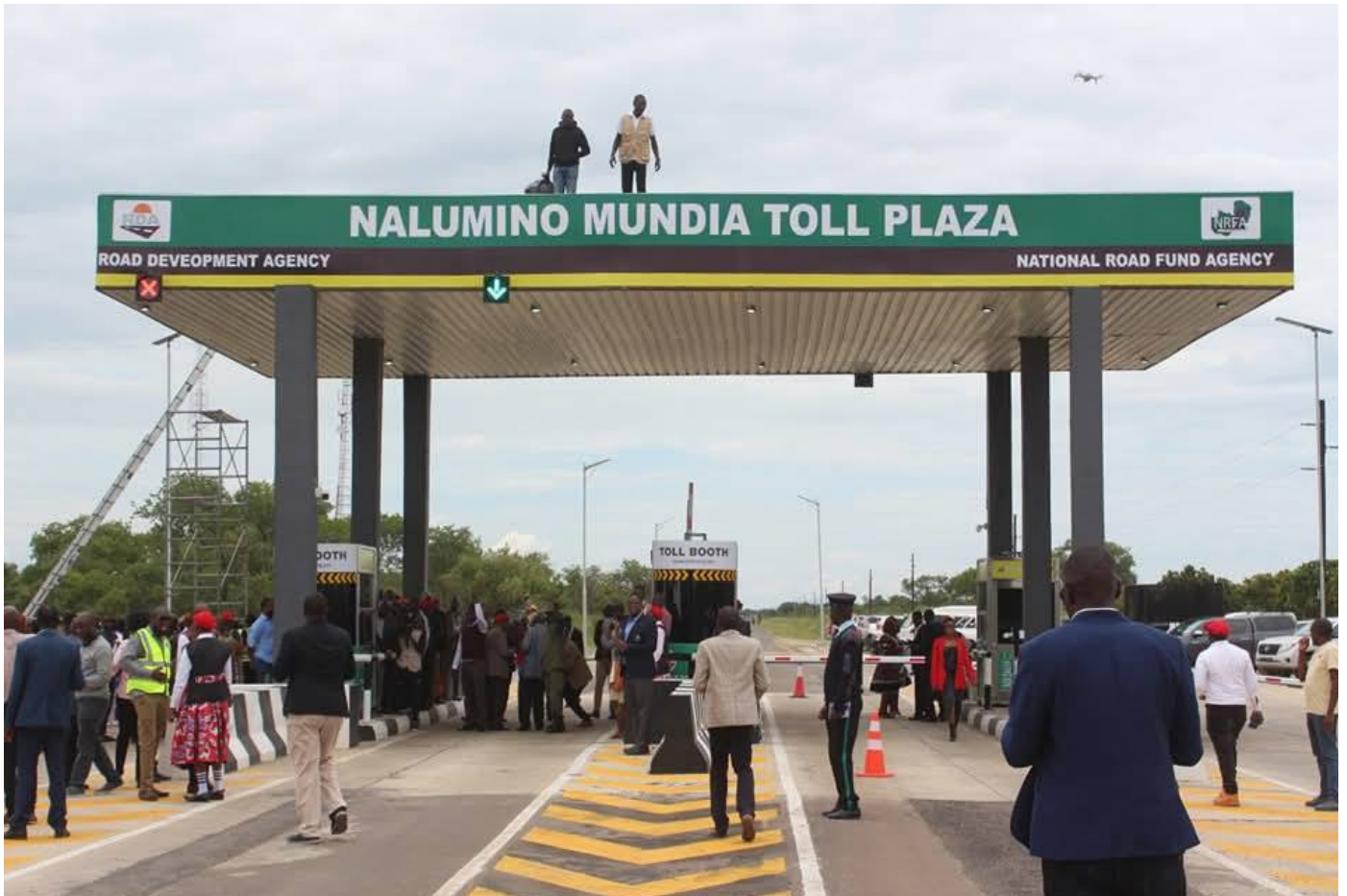
Nalumino Mundia Toll Plaza