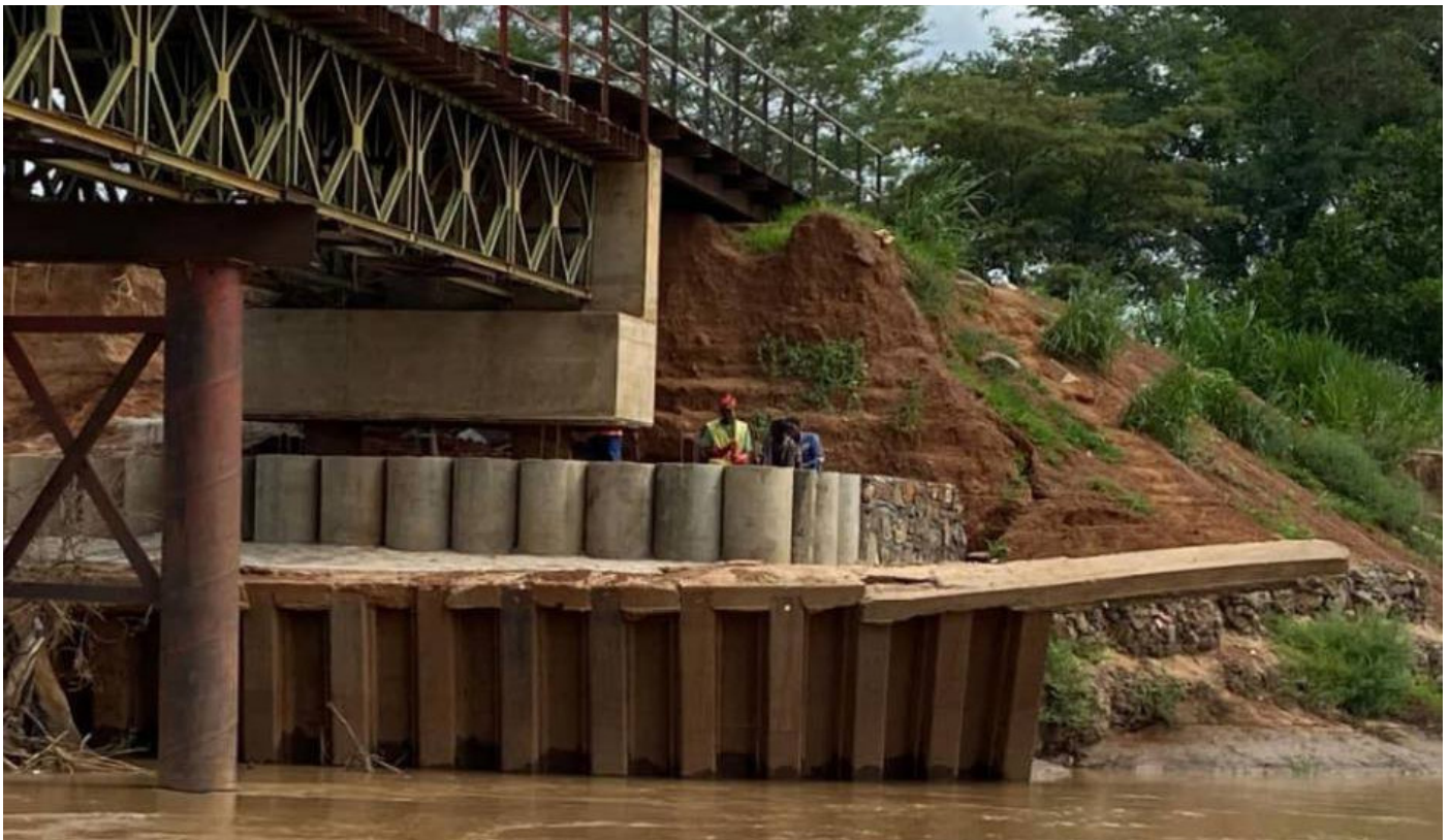
Protection works of the new embankment and abutment on Matumbo side.

The Agency is also carrying out protection works on the approach embankment on the Matumbo side of the bridge. This approach embankment was extensively eroded during the flash floods experienced in the area.