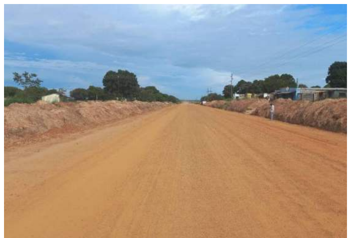
Lusaka-Mongu Road works from Tateyoyo Gate to Katunda/Lukulu Junction in Western Province.