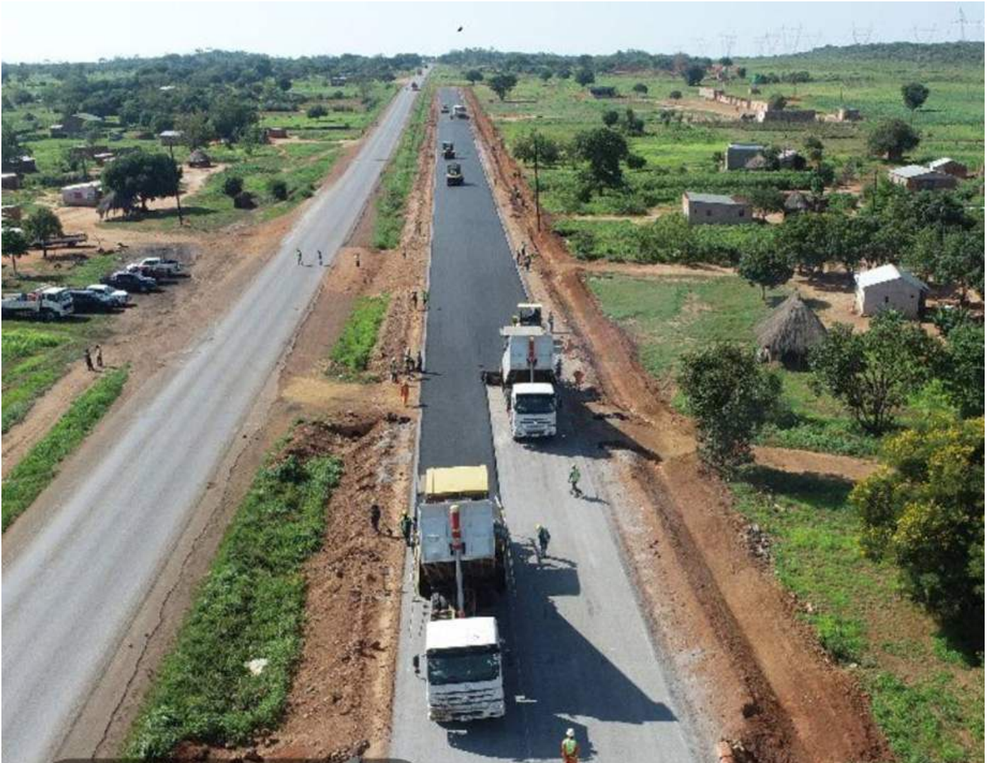
Lusaka-Ndola Dual Carriageway Project.

The Concession Agreement (CA) for upgrading of the Lusaka-Ndola Road into a dual carriageway was signed with Messrs. Macro Oceans Investment Consortium (MOIC-LN) at a cost of US$649,976,167.