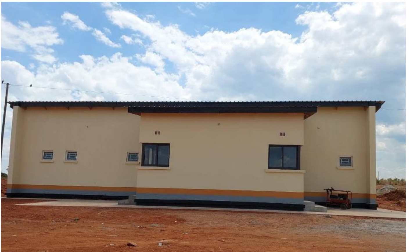
Isoka truck park ablution block.