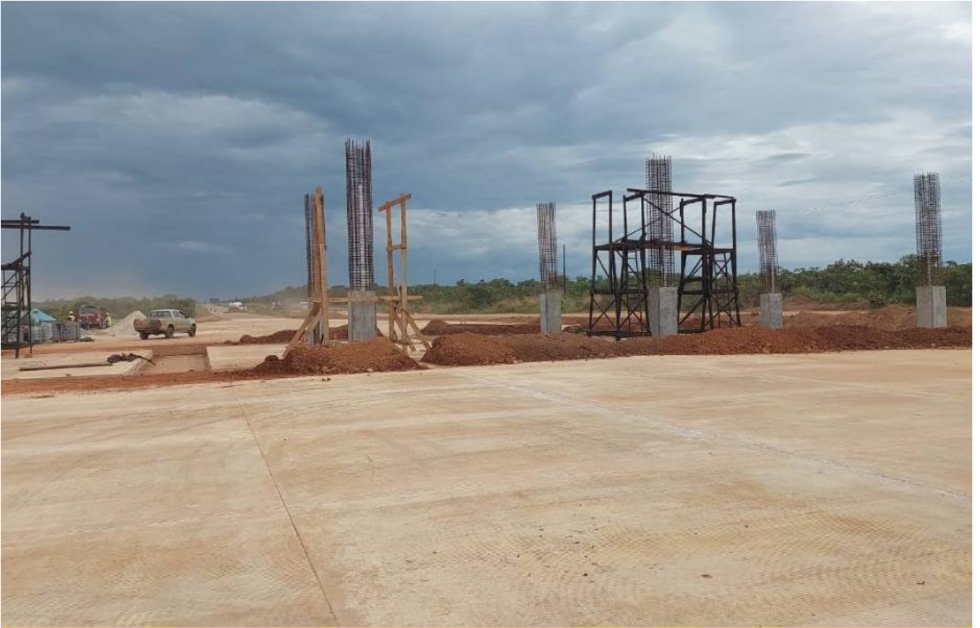
Chinsali Toll Plaza: Column construction in progress.