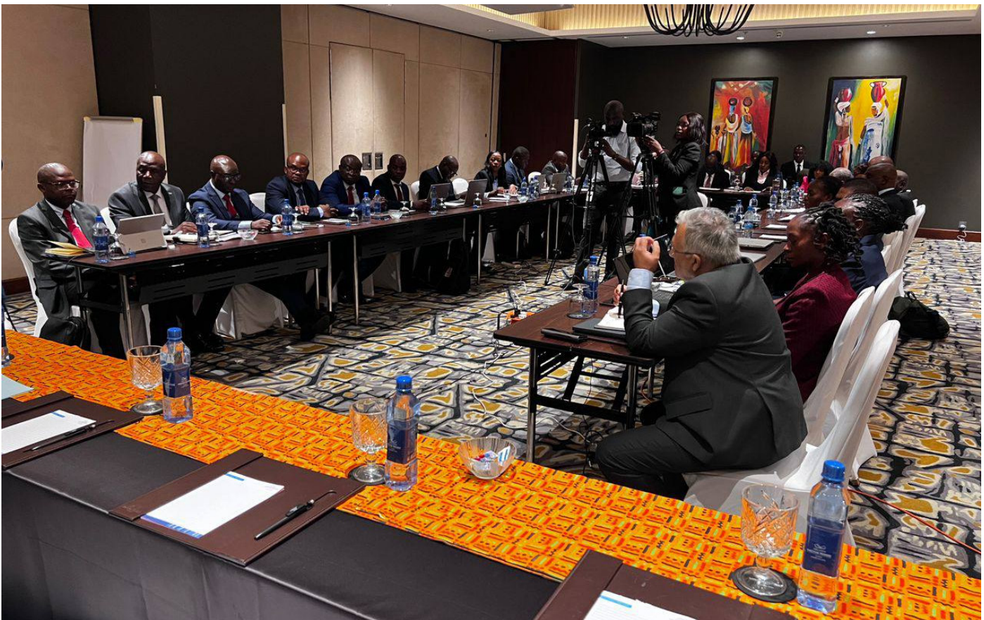
The Board, RDA Management and invited guests following the proceedings.