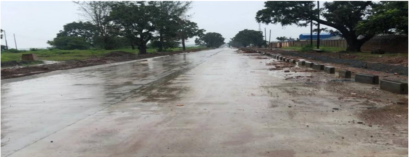
Section of a completed concrete pavement on Chibuluma Road.