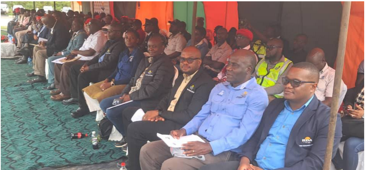
RDA Board Members, Management and invited guests following the proceedings.