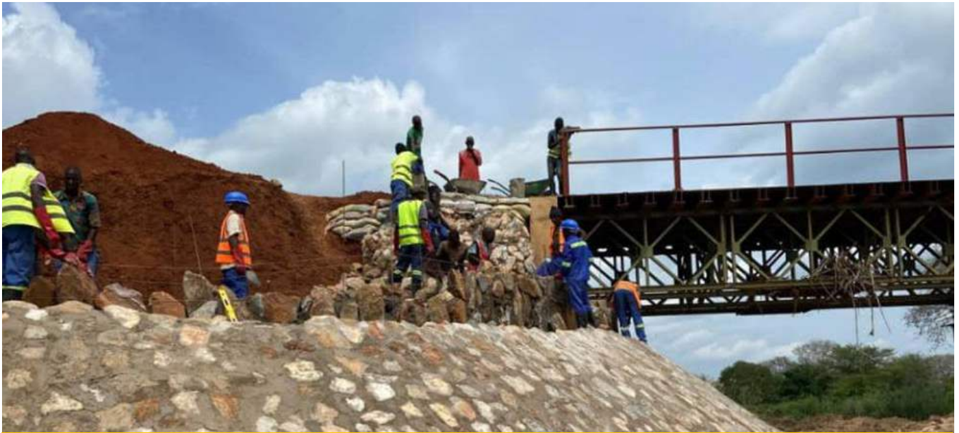
Works on the approach embankment in progress.

D uring the 2023/2024 rainy season, a partial washaway occurred at the Luangwa Bailey Bridge along the Chama-Matumbo Road in Eastern Province.