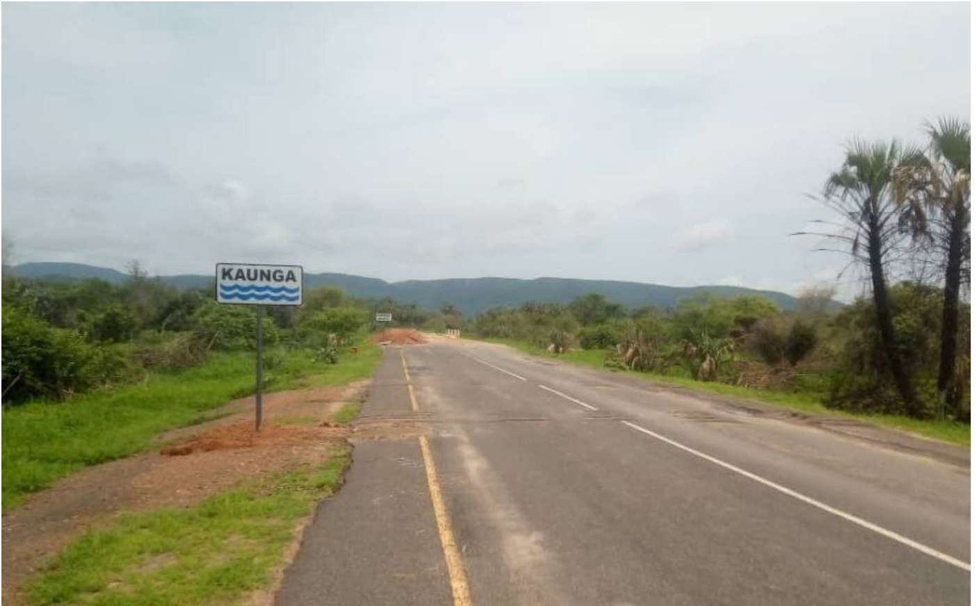
Installed road signage at Kaunga Bridge in Luangwa District.