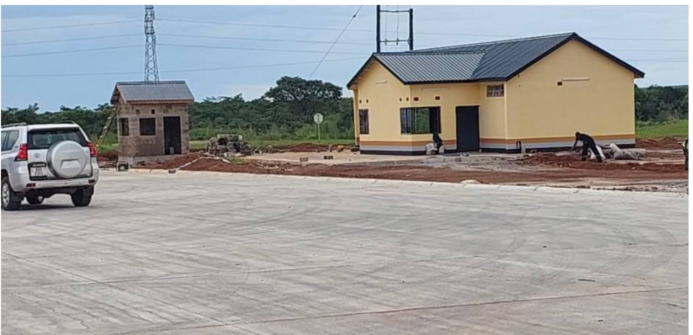
Chinsali truck park abluion block and guard house.

The weigh-in-motion weighbridge positioned at the T2/D1 (Mbala Road) intersection in Nakonde is 96.5 % complete and works are expected to be completed end of February 2025.