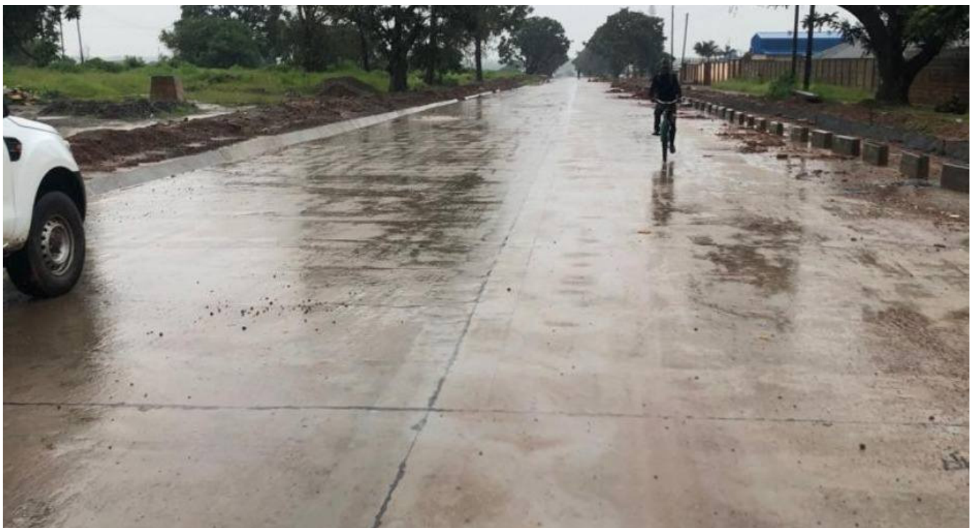
Chibuluma Road works.

The contractor, Messrs. East to West Construction and Mining Limited has constructed 6.1 kilometres of concrete pavement on the 7.3 kilometres stretch.