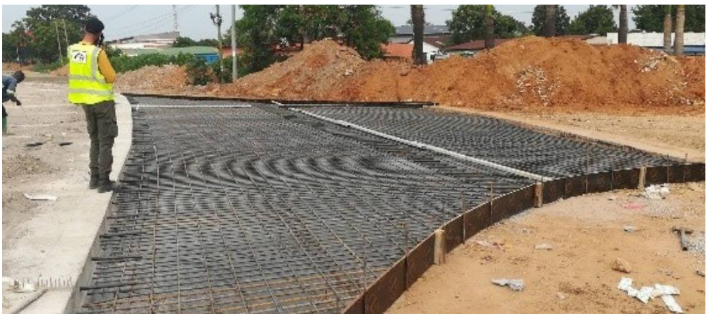
Reinforcement works at a junction on Chibuluma Road.