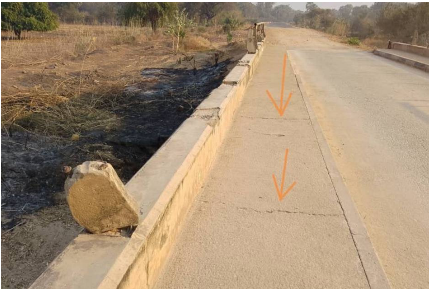
Kaunga Bridge before works commenced.