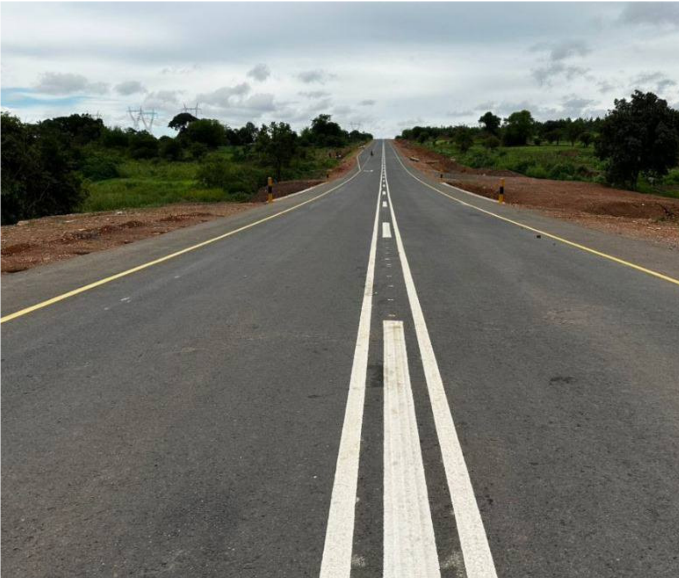
Completed section with road markings on the Masangano-Fisenge-Luanshya Road.