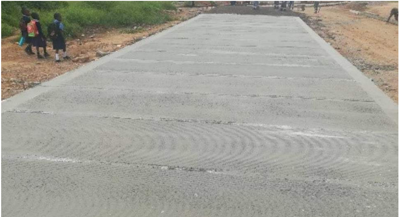
Concrete pavement casting works on Chibuluma Road.

The Government through the Road Development Agency (RDA) is constructing a rigid pavement (concrete) on the Chibuluma Road in Kitwe on the Copperbelt Province.