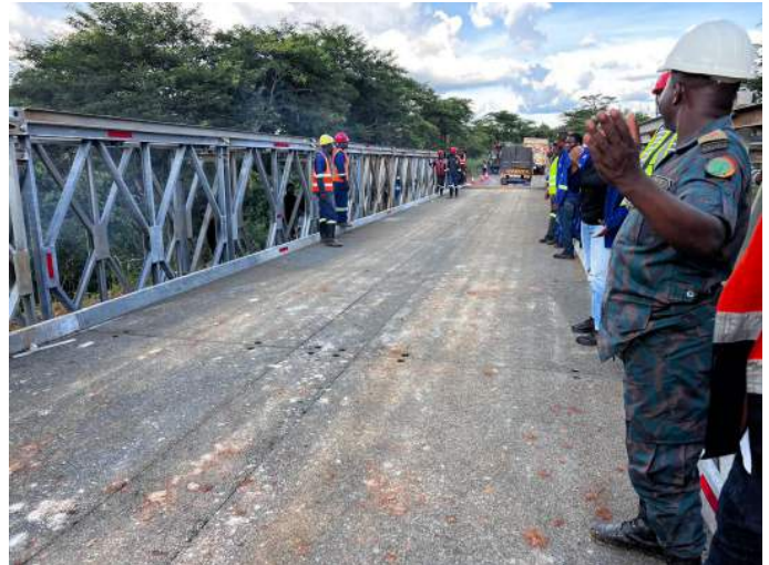
Picture taken immediately after the ACROW Bridge was opened to traffic.