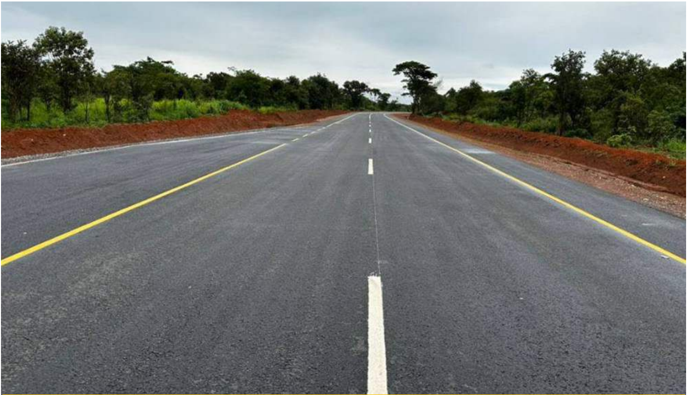
Completed section of the Masangano-Fisenge-Luanshya Road.

Works on the Masangano-Fisenge-Luanshya Road on the Copperbelt Province are substantially completed. All the major drainage works are complete, road marking works are at 100% and the toll gate has attained 90% completion point. Installation of access culverts and road signage is in progress.