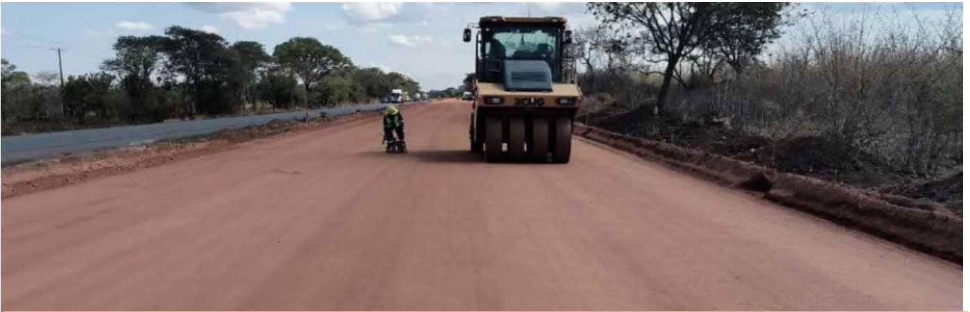
Subbase works on the Lusaka-Ndola Dual Carriageway Project.