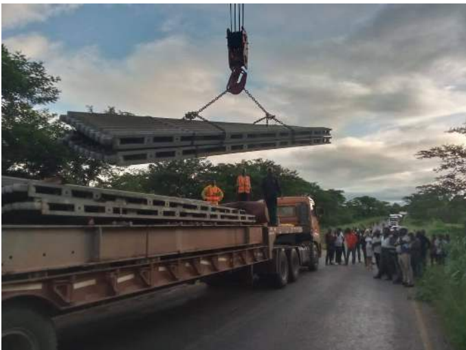
Offloading of ACROW Bridge components on site.

The ACROW Bridge installation works have since been completed and the road is open to traffic.