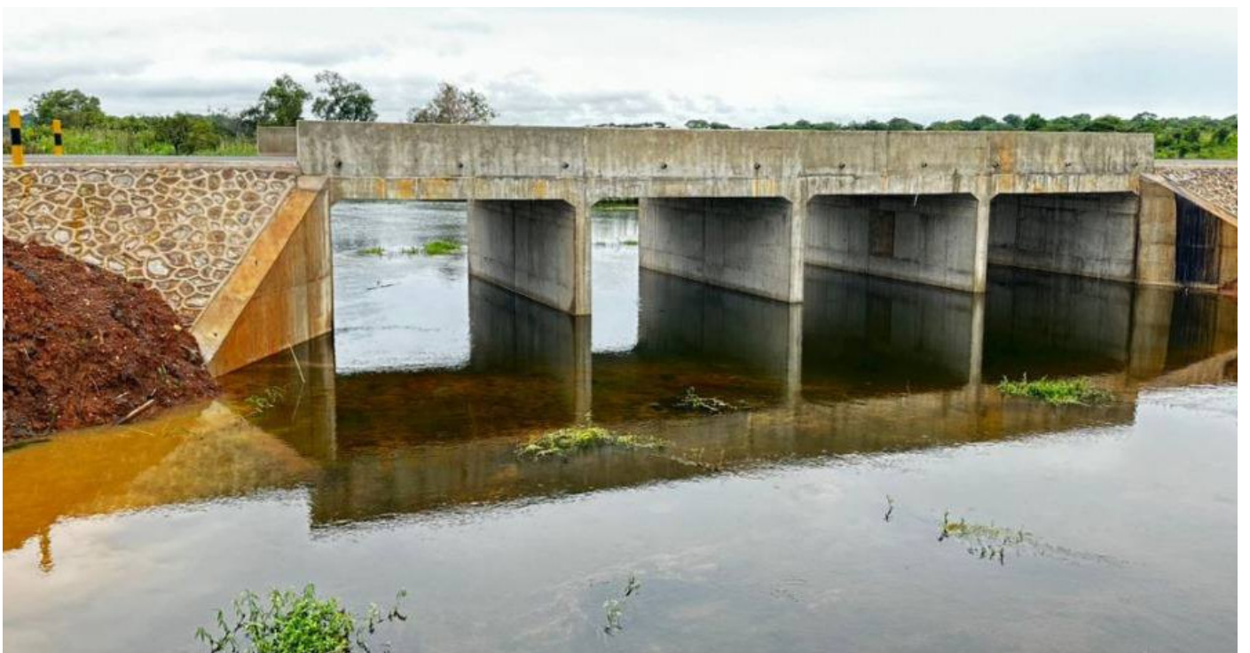
Completed culvert on the Masangano-Fisenge-Luanshya Road.

Works on the Masangano-Fisenge-Luanshya Road on the Copperbelt Province are substantially completed. All the major drainage works are complete, road marking works are at 100% and the toll gate has attained 90% completion point. Installation of access culverts and road signage is in progress.