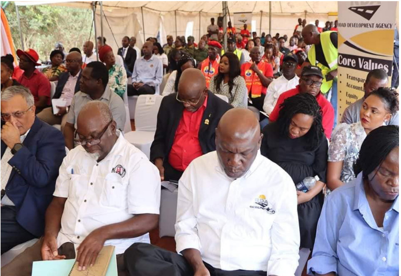
Road Sector Agencies Board of Directors and invited guests following proceedings during the signing of the Concession Agreement with Jasworld Ports Limited for the construction of the Mufulira-Mokambo Road, the urban dual carriageway and Border infrastructure at Mokambo in Mufulira District.