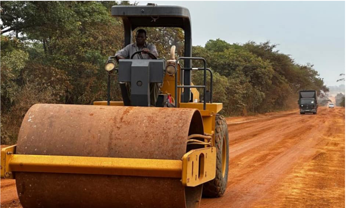
Holding maintenance works on the Mufulira-Mokambo Road on the Copperbelt Province.

The Government, through the Road Development Agency (RDA) has been undertaking holding maintenance works on the Mufulira-Mokambo Road on the Copperbelt Province so that it is motorable during the rainy season.