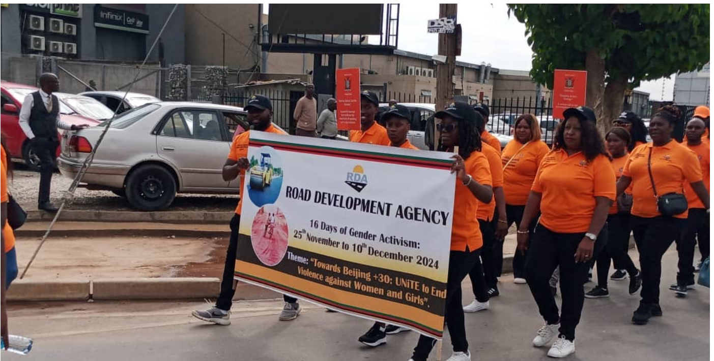
RDA members of staff during this year's commemoration of 16 Days of Activism Against Gender Based Violence.