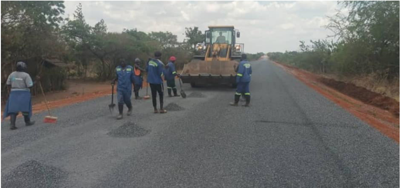
Holding maintenance works on the Chipata-Lundazi Road in Eastern Province.

The Road Development Agency (RDA) has been undertaking Holding Maintenance works on the Chipata-Lundazi Road in Eastern Province.