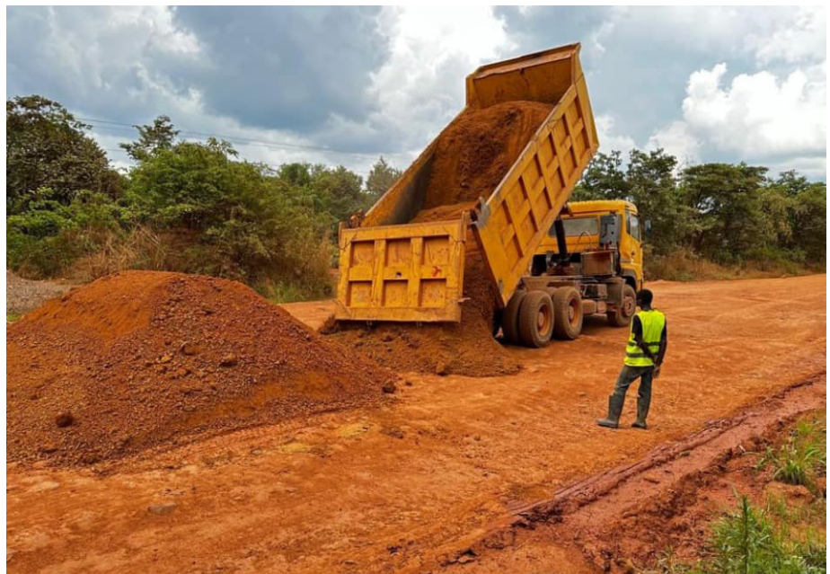
Dumping and graveling works on the Mufulira-Mokambo Road on the Copperbelt Province .

On 23 rd October 2024, the Government further launched rehabilitation works on the 61 kilometres Ndola-Mufulira Road as well as the development of Sakania Border and access road.