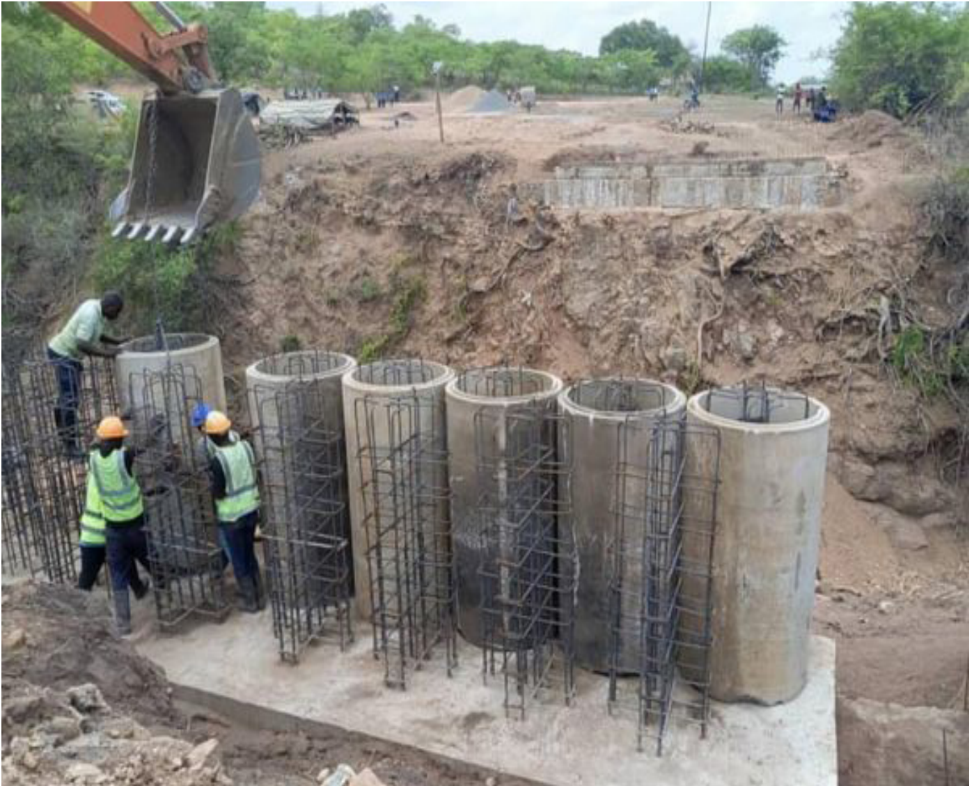
Construction of Lusangazi Bailey Bridge on the Petauke-Ukwimi Road in the Lusangazi District of Eastern Province.

The construction of Lusangazi Bailey Bridge on Petauke-Ukwimi Road in the Lusangazi District of Eastern Province is underway.