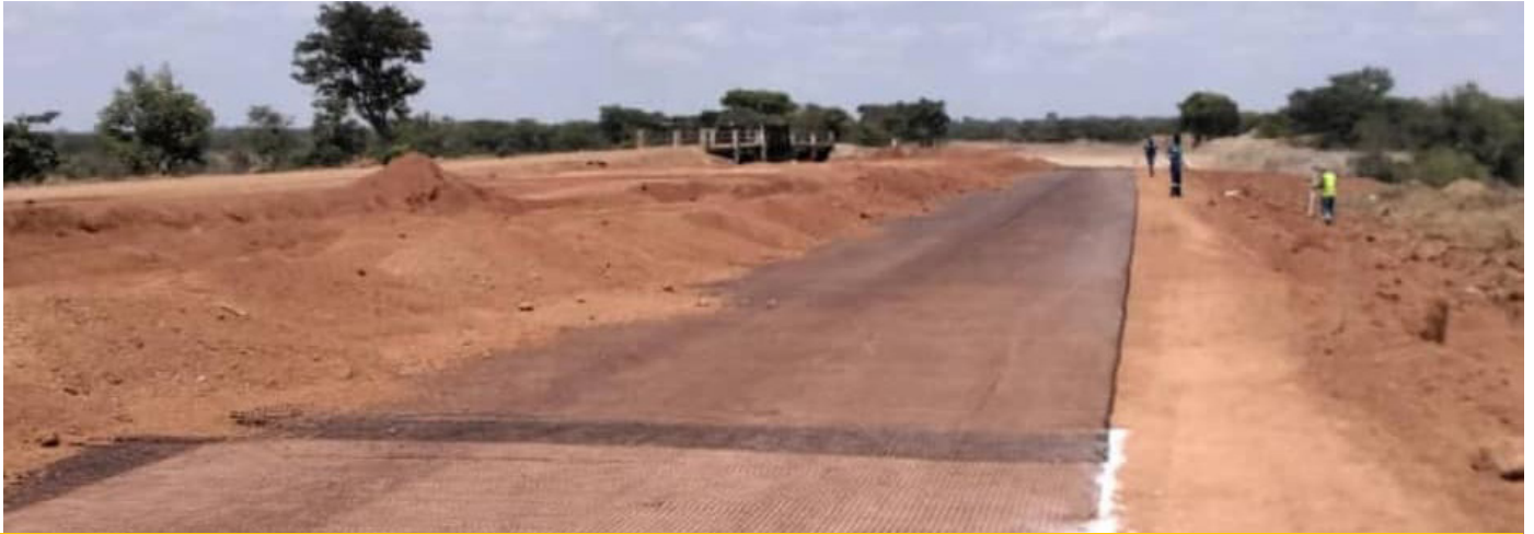
Construction works of the Kasomeno-Mwenda Road and Bridge Project in Luapula Province under the Public Private Partnership (PPP) Financing Model.

C onstruction works of the Kasomeno-Mwenda Road and Bridge Project in Luapula Province under the Public Private Partnership (PPP) Financing Model are progressing well.