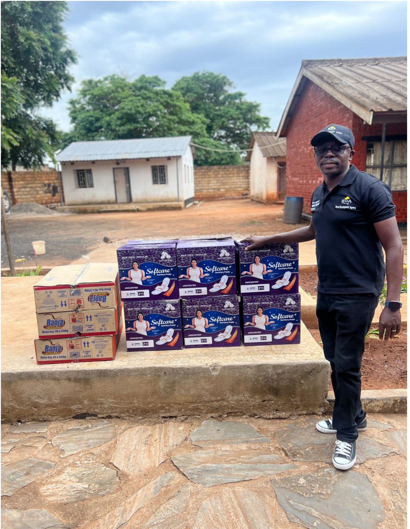
A donation of sanitary towels and detergents was presented to learners at Mkandawira Secondary School during a sensitization programme Gender Based Violence.