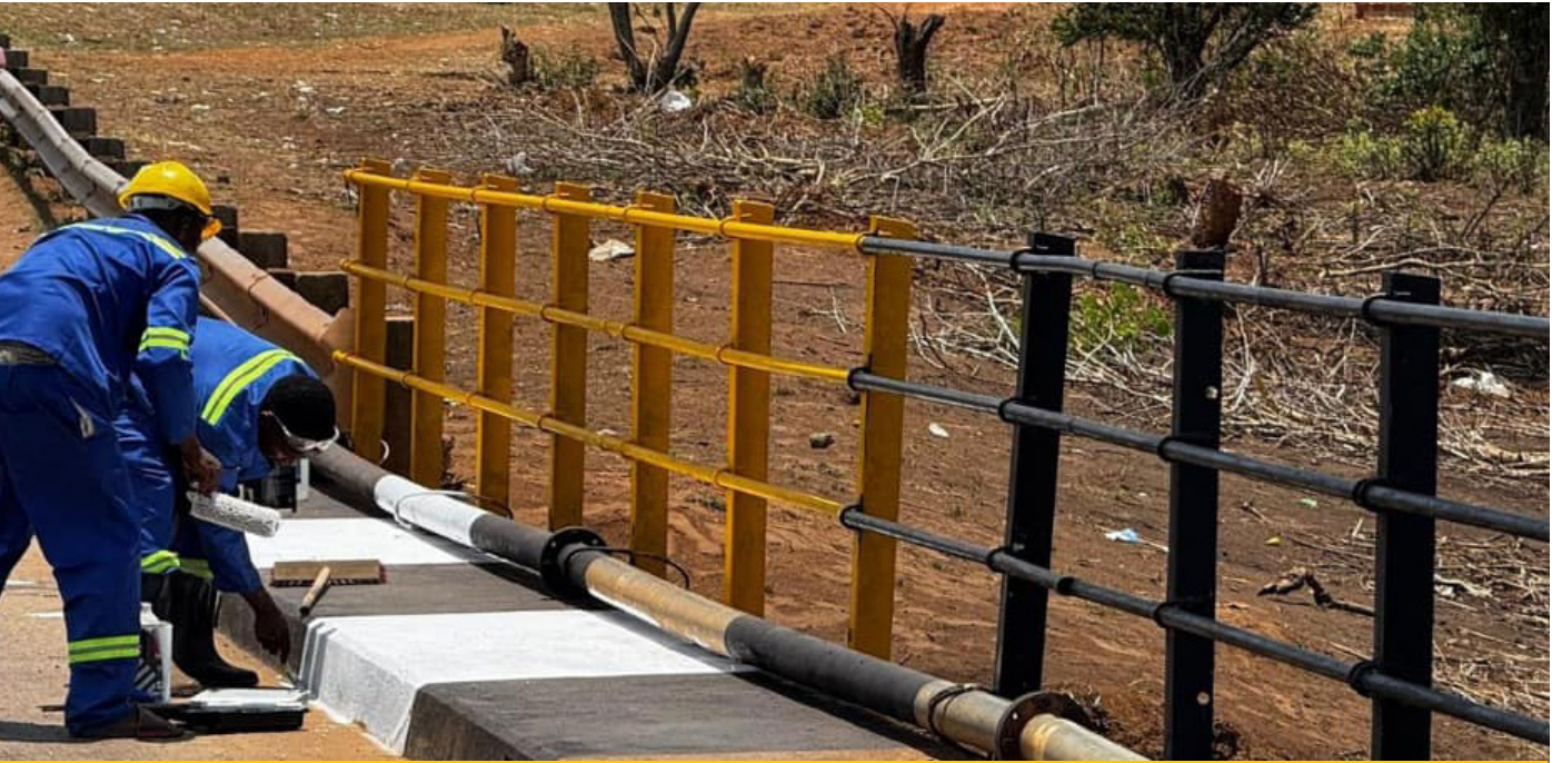
Painting of installed guardrails at Mundanya Bridge in the Manyinga District of North Western Province.

Mundanya Bridge in the Manyinga District of North Western Province was extensively damaged when a truck lost control and careered off the road ramming into the guardrails at the crossing point.