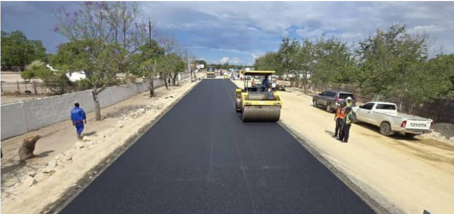
Works on upgrading the section of the Mongu-Lusaka Road in Mongu from a two-lane to a four-lane dual carriageway.

W orks on upgrading the section of the Mongu-Lusaka Road in Mongu from a two-lane to a four-lane dual carriageway are progressing well.