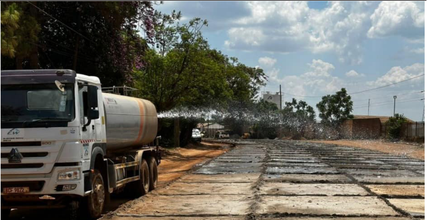
Works on the Chibuluma Road Project.

Works on the Chibuluma Road Project are progressing well with 3.6 kilometres out of the 7 kilometres being paved with concrete.