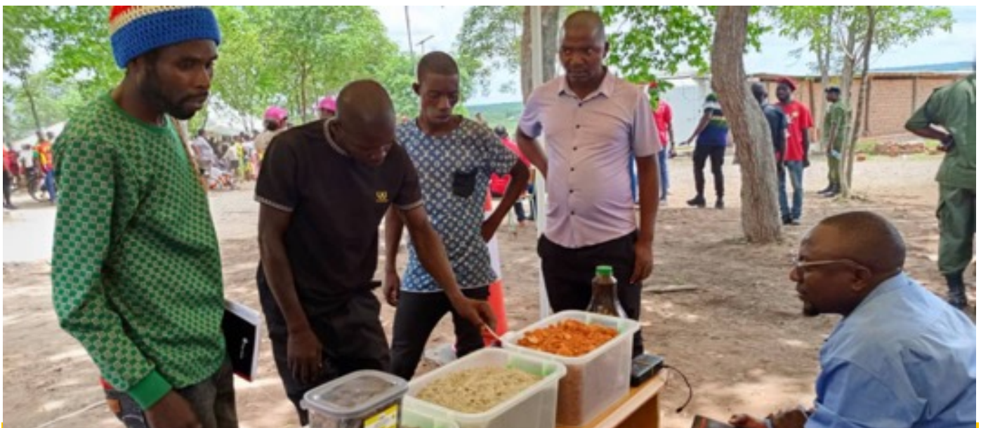
Expo goes passed through the RDA stand to understand how the roads are constructed.

This is an initiative by the Coalition for African Parliamentarians on Human, Animal Health and Environment (CAPAH), Zambian Chapter.