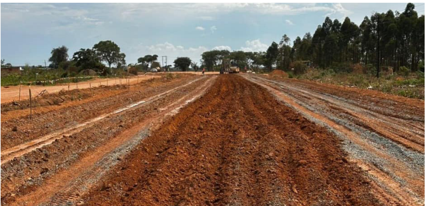
Progress on earthworks between Mitengo, about 3 kilometres from Levy Mwanawasa Stadium Roundabout and Sakania Border at kilometre 17.

The Concession Agreement for the finance, design, build, operate, maintain, and transfer of 55 kilometers of the Ndola-Sakania-Mufulira Road and border infrastructure at Sakania on the Copperbelt Province was signed with Jaswin Ports Limited.