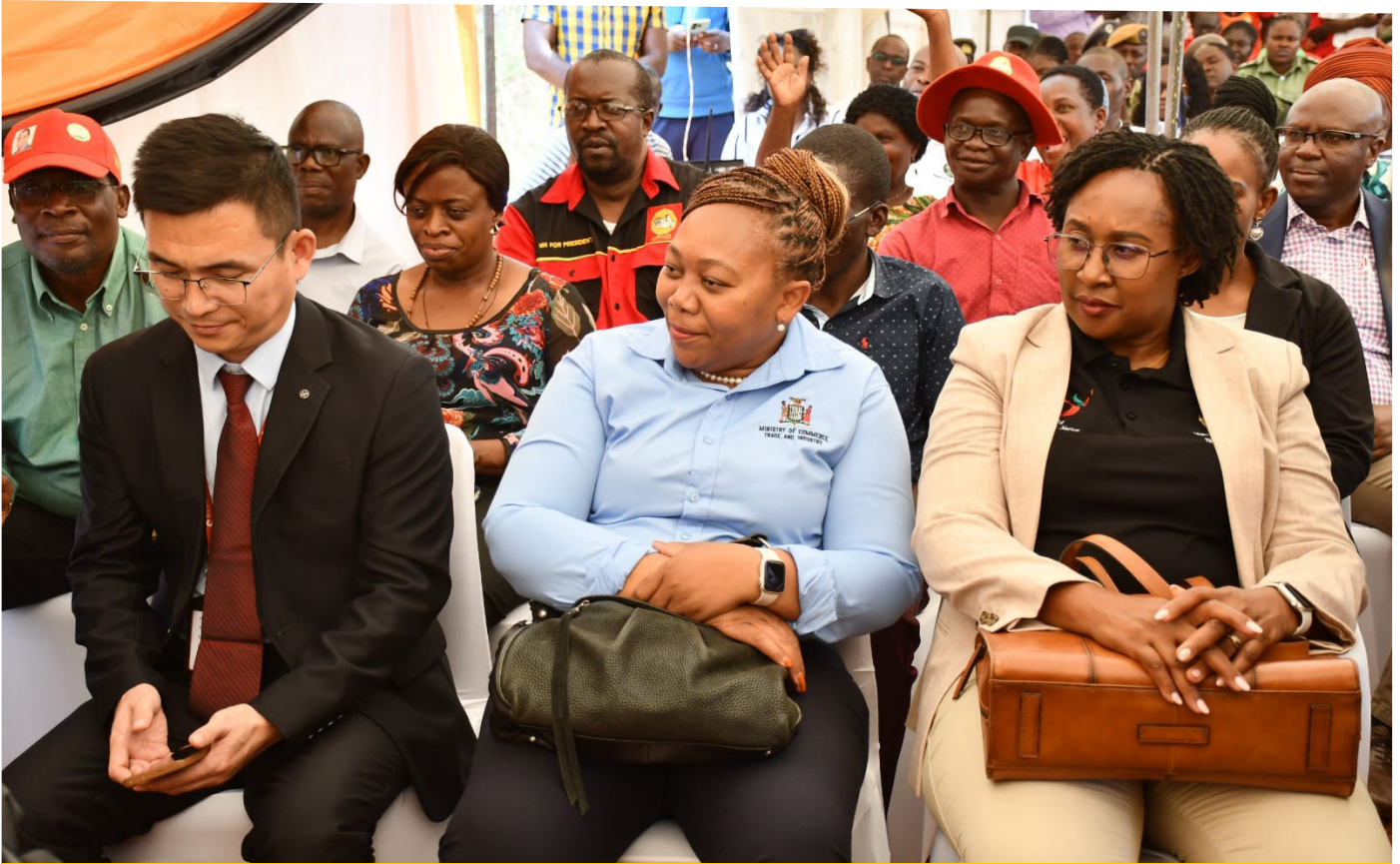
Invited guests following proceedings during the signing of the Concession Agreement with Jasworld Ports Limited for the construction of the Mufulira-Mokambo Road, the urban dual carriageway and Border infrastructure at Mokambo in Mufulira District.