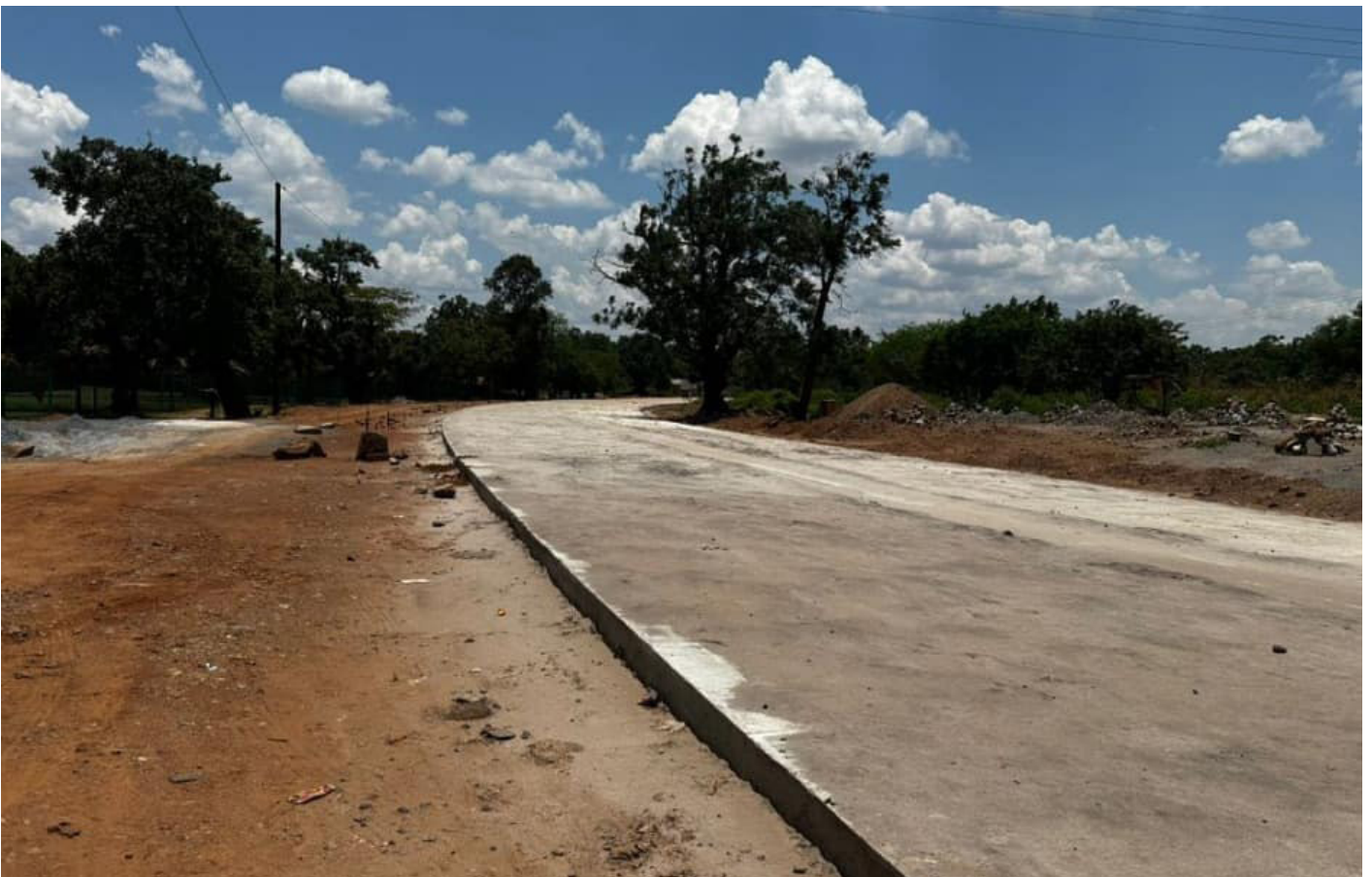
Chibuluma Concrete Road Project.

Works on the Chibuluma Road Project are progressing well with 3.6 kilometres out of the 7 kilometres being paved with concrete.