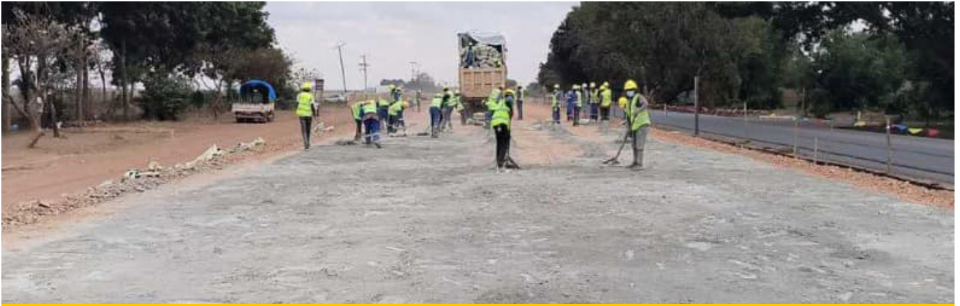
Works to upgrade to dual carriageway the Lusaka-Ndola Road.

W orks to upgrade to a Dual Carriageway the Lusaka-Ndola Road have recorded physical progress of 20% while 99.0% has been attained on the 45 kilometres Masangano-Fisenge-Luanshya Road.