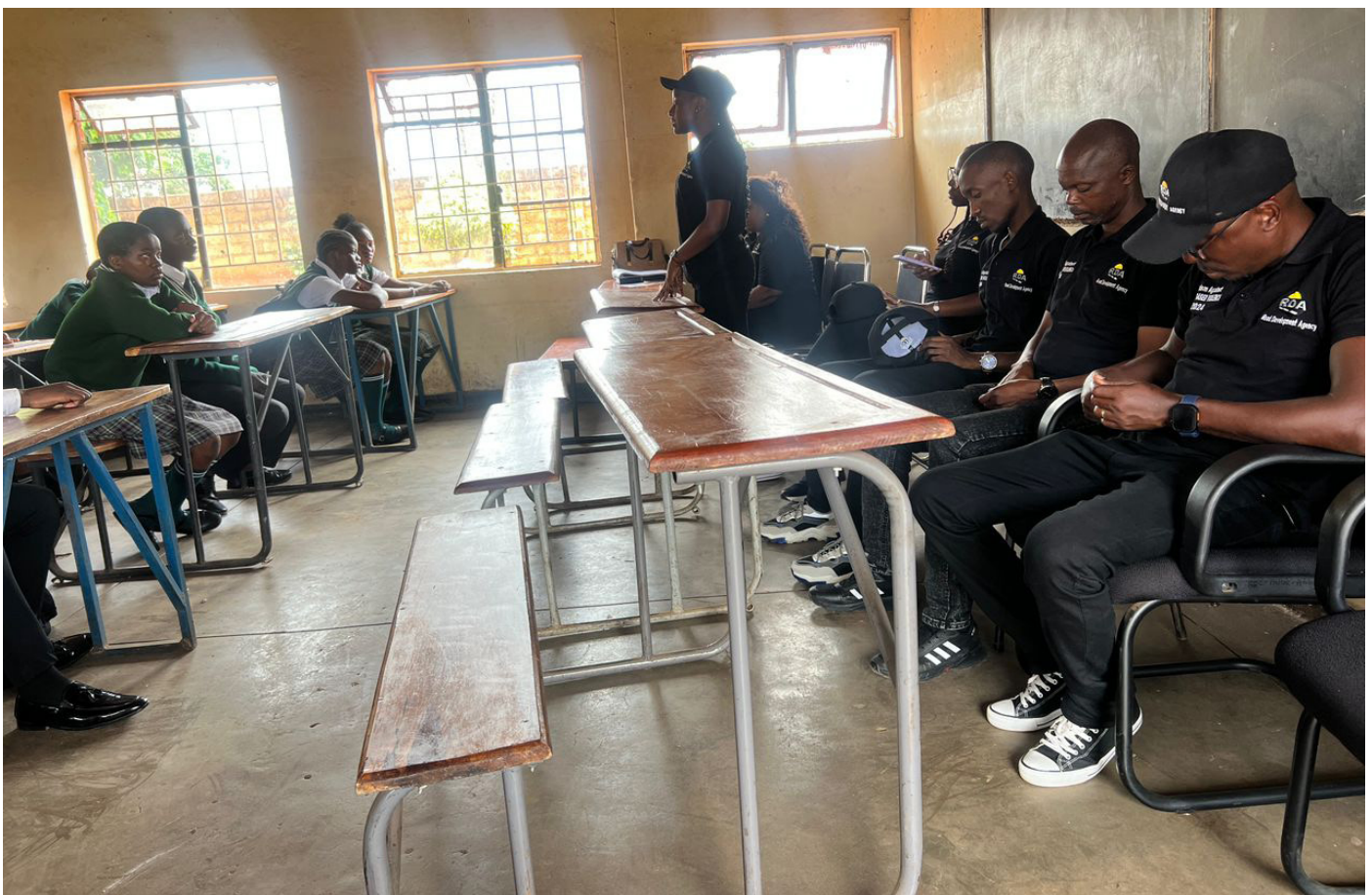
An engagement with pupils at Mkandawira Secondary in Lusaka where RDA Officers shared information on the dangers of Gender Based Violence.