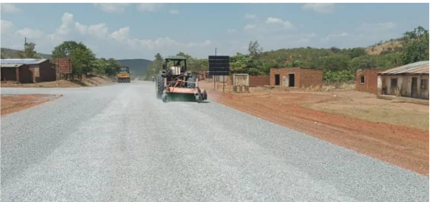
Holding maintenance works on the Chipata-Lundazi Road in Eastern Province.

Therefore, the scope of works for the current contractor has been revised to holding maintenance to ensure the road is motorable before the commencement of the Millennium Challenge Compact (II) Project.