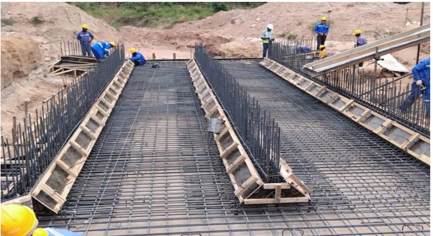
The construction of an embankment at Luongo Bridge underway on the Kasomeno-Mwenda Road Project.

The project scope includes: Construction of 92 kilometres road on the Zambian side and 94 kilometres on the DRC side, the construction of a 345 metres cable stayed bridge across the Luapula River, the construction of the OSBP with associated parking and warehousing facilities and the construction of Toll Plazas and Weighbridges.