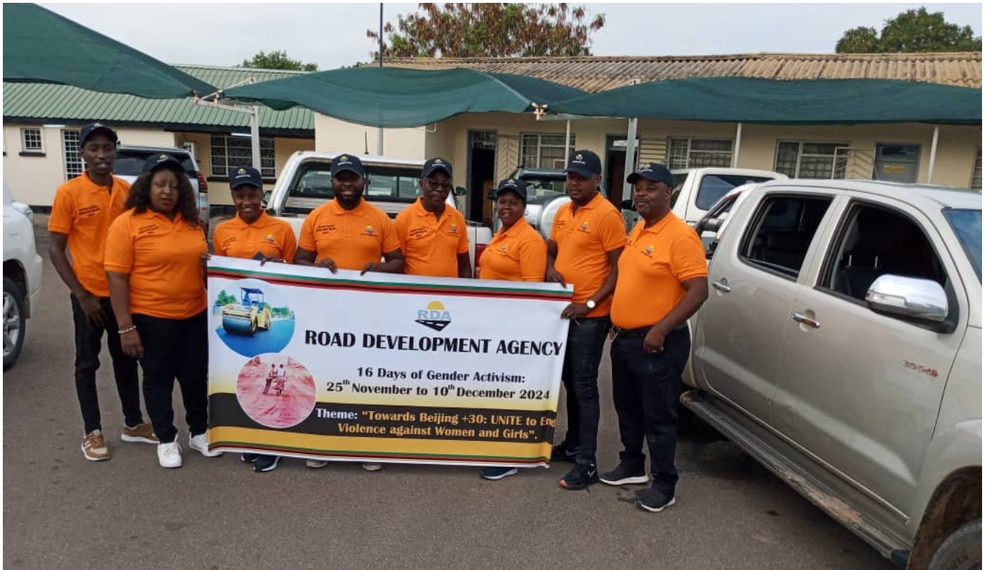
Group photography of RDA members of staff.