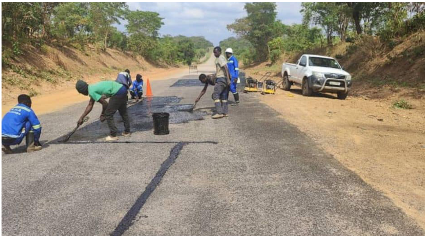
Pothole patching of works on the Mpika-Kasama Road from Mpika to Chambeshi Bridge section.