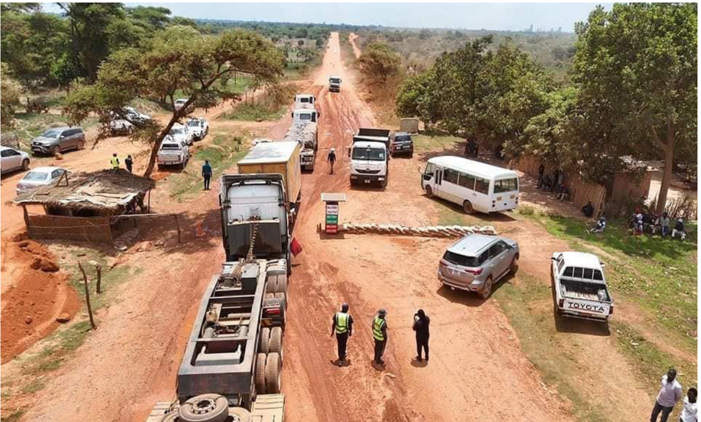
The current state of Mufulira-Mokambo Road.