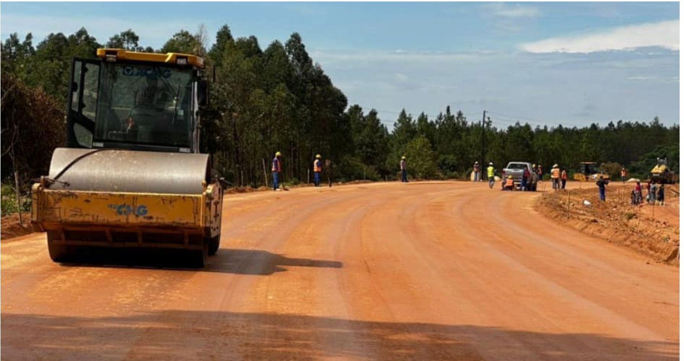
Rehabilitation works on the Ndola-Sakania-Mufulira Road.

R ehabilitation works on the Ndola-Sakania-Mufulira Road under the Public Private Partnership (PPP) Financing Model have continued to register progress.