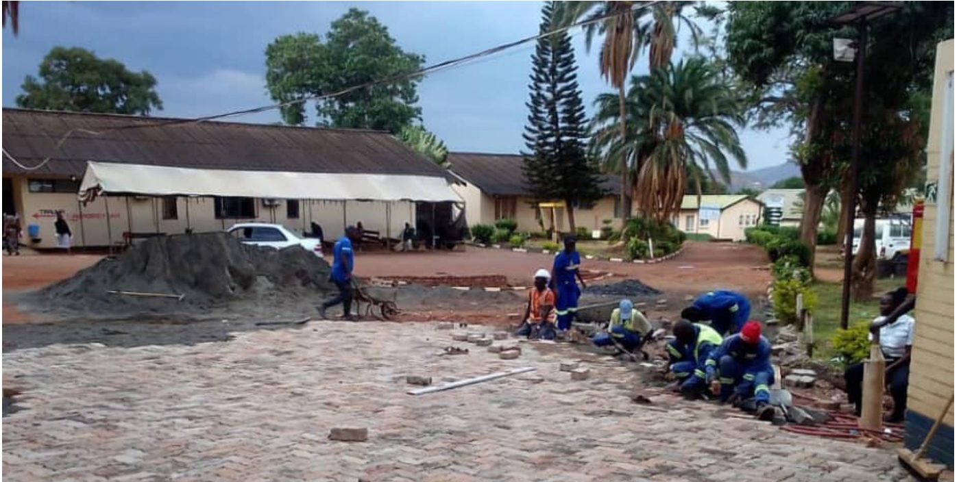
Paving works at Chipata Central Hospital in Chipata Town, Eastern Province.

The Road Development Agency (RDA) is undertaking works involving the paving of the driveway to the maternity wing at Chipata Central Hospital in Eastern Province as well as selected areas at the health facility.