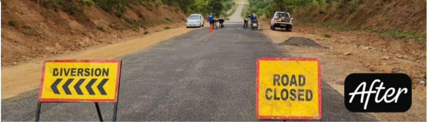
Pothole patching! Before and after of works on the Mpika-Kasama Road from Mpika to Chambeshi Bridge section.