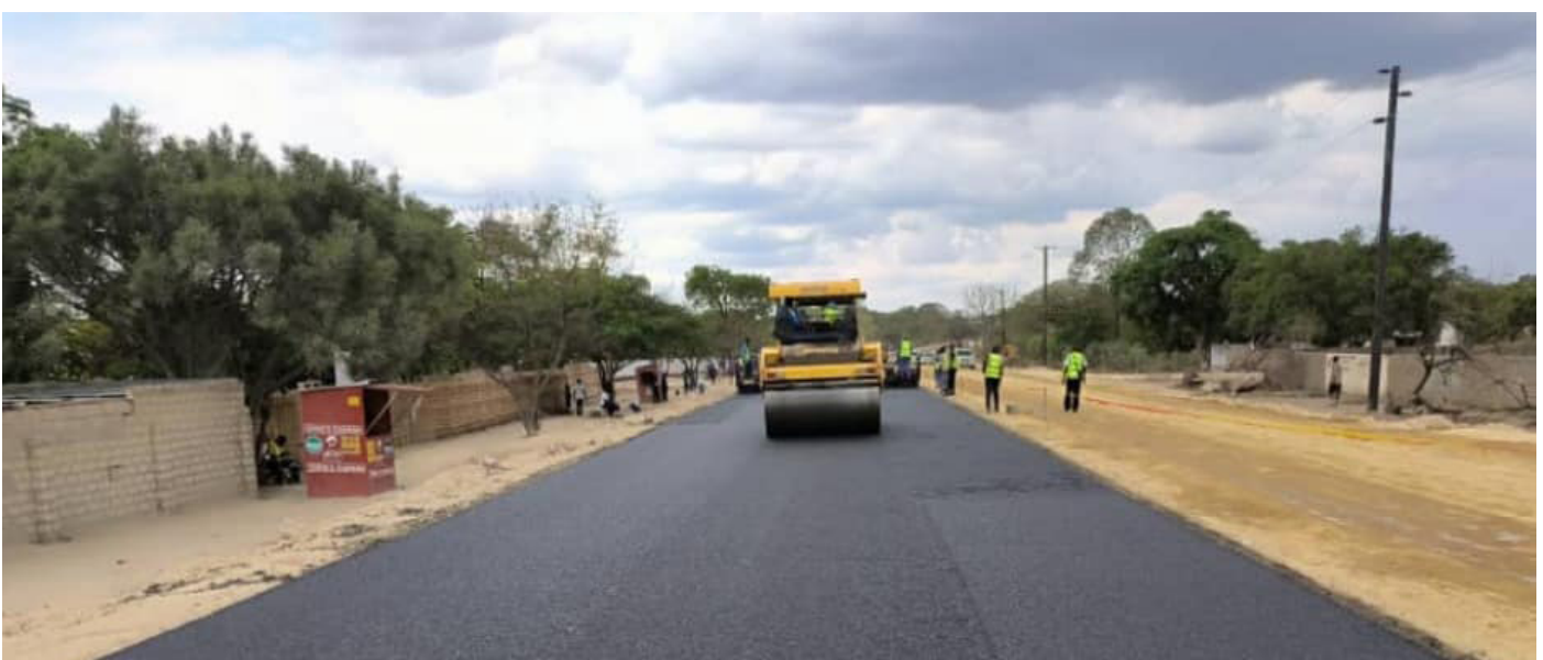
Works on upgrading the section of the Mongu-Lusaka Road in Mongu from a two-lane to a four-lane dual carriageway.

These savings have facilitated the completion of various roadworks, including the Limulunga Road and its extensions, which connect key areas within Limulunga and other significant routes such as the Muoyo Road and Presidential Avenue and Libonda Roads in Mongu not forgetting the Luanginga and Silanda Bridges and the road that connects those two Bridges in Kalabo District.