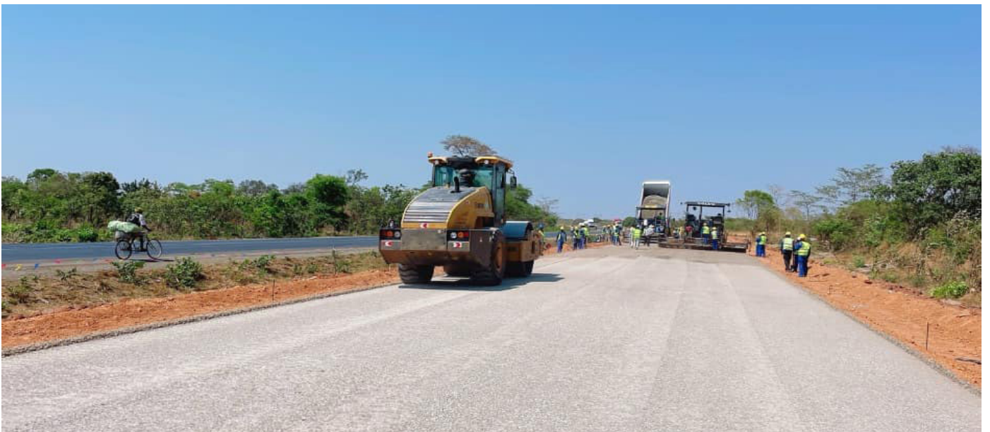
Ndola Road Dual Carriageway works.

A new bridge has been designed and will be constructed at Kafubu Bridge in Ndola.