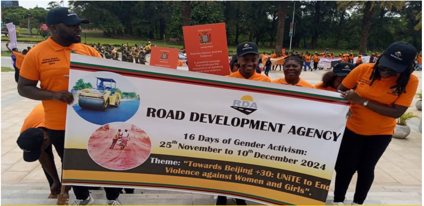
RDA members of staff during this year's commemoration of 16 Days of Activism Against Gender Based Violence at Mulungushi International Conference Centre in Lusaka.

This year's theme was, "Towards Beijing +30 UNiTE: to End Violence Against Women & Girls."