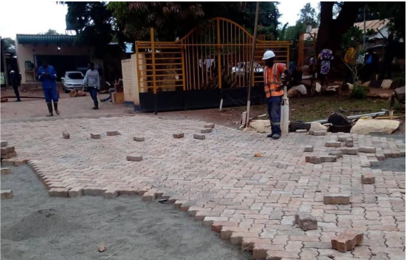
works at Chipata Central Hospital in Chipata Town, Eastern Province.

The Road Development Agency (RDA) is undertaking works involving the paving of the driveway to the maternity wing at Chipata Central Hospital in Eastern Province as well as selected areas at the health facility.