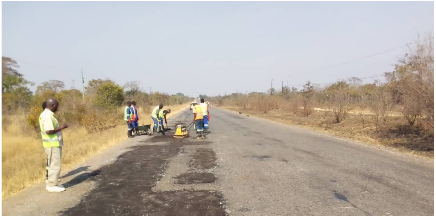
Pothole patching works on the Monze-Mazabuka Road.

T he Road Development Agency (RDA) has carried out pothole patching works on the 65 kilometres Monze-Mazabuka Road in Southern Province.