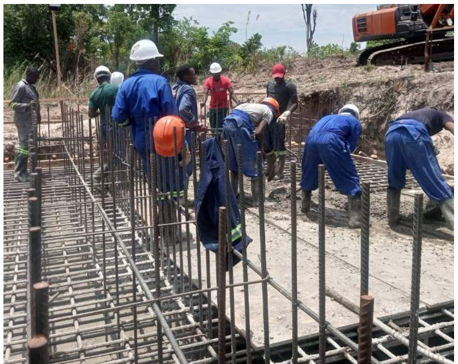
Ongoing construction works of the Aluni Mulonga ACROW Bridge.