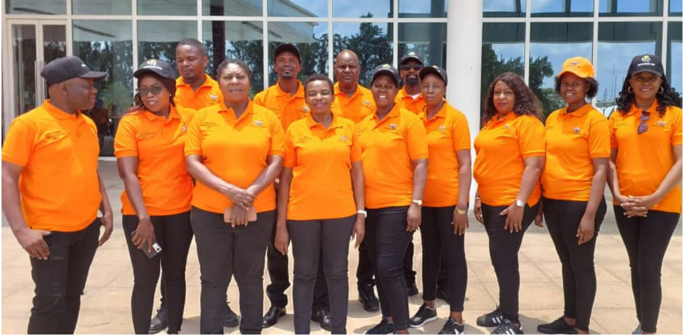
RDA members of staff pose for a picture during the 2023 commemoration of 16 days of Activism Against GBV at Mulungushi International Conference Centre in Lusaka.

The Road Development Agency (RDA) joined various organizations in commemorating the 2023, 16 days of Activism Against GBV-2023 at Mulungushi International Conference Centre in Lusaka.