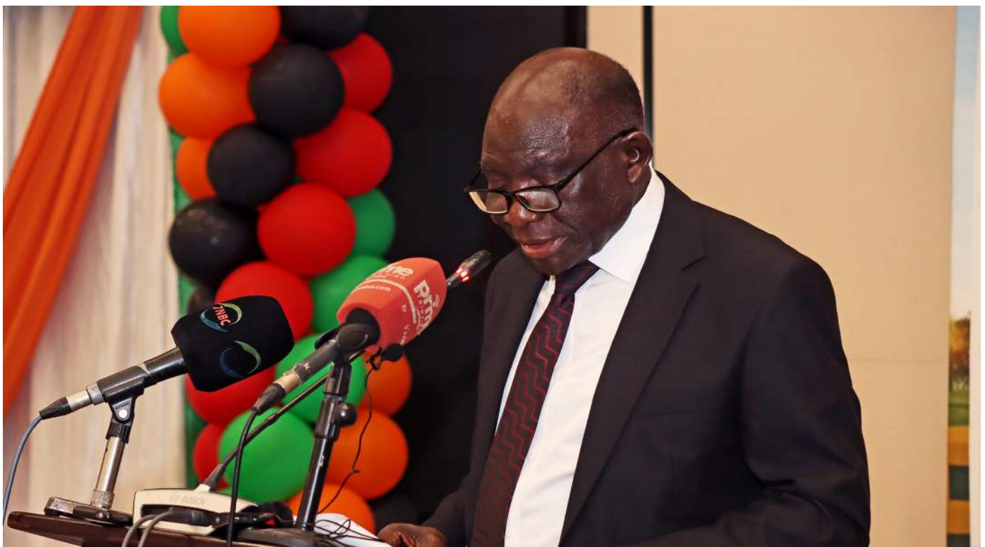
Infrastructure, Housing and Urban Development Minister, Hon. Eng. Charles L. Milupi delivering his speech during the launch of the RDA 2022-2026 Strategic Plan at Mulungushi International Conference Centre in Lusaka.

Infrastructure, Housing and Urban Development Minister, Hon. Eng. Charles L. Milupi says for the Road Development Agency (RDA) to continue delivering on its mandate as enshrined in the Public Roads Act, the Agency is required to periodically and strategically reposition itself to harness opportunities and respond to the emerging challenges in the dynamic environment.