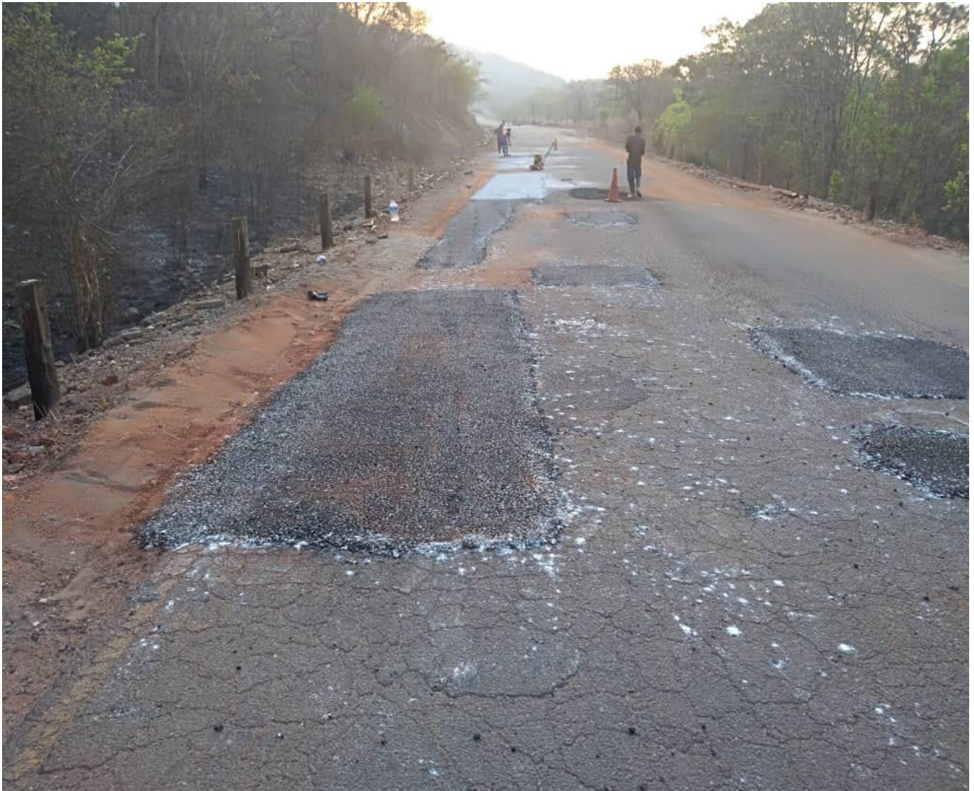
Pothole patching along the Great East Road (Lusaka -Luangwa Road section).

T he Road Development Agency (RDA) embarked on the project to patch potholes along the Great East Road from Kenneth Kaunda International Airport (KKIA) traffic circle to Luangwa Bridge, covering a distance of 220 kilometres.