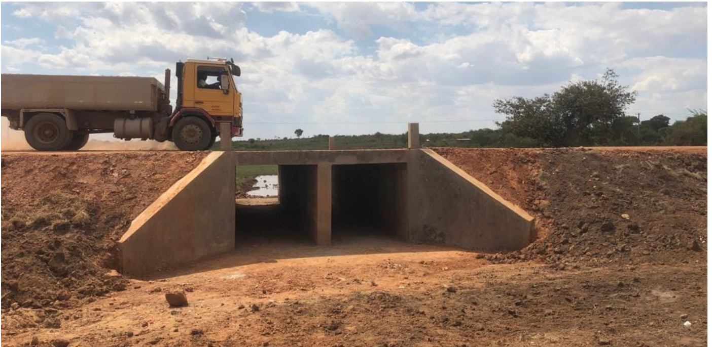
The Insitu Jeremiah box culverts along the Lundazi-Chasefu Road in Eastern Province.

T he Road Development Agency (RDA) has completed works on the Insitu Jeremiah box culverts along the Lundazi-Chasefu Road in Eastern Province.