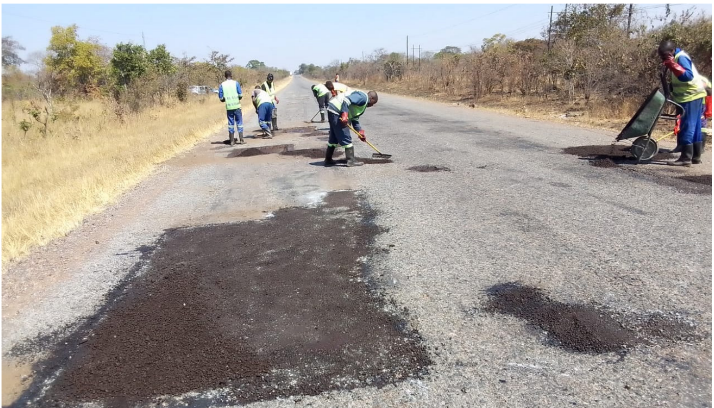
Pothole patching works on the Monze-Mazabuka Road.

The pothole patching has been carried out as holding maintenance works to improve the riding surface and prevent further deterioration of the road. The implementation of periodic maintenance as a long-term intervention is underway.=