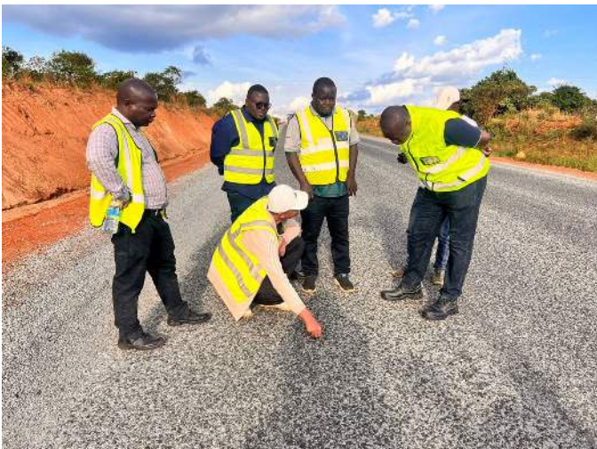
Checking on the pavement structure.

The contractor has so far done pothole patching of approximately 130 kilometres from Mpika to Lukulu Bridge and this week has started pothole patching works from Mpika to Chinsali.