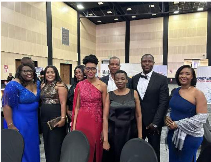
Group photograph during the PUSH Women Awards ceremony.

PUSH Women Network recognizes organizations or individuals that exemplify exceptional dedication to environmental and social consciousness across all aspects of their operations.