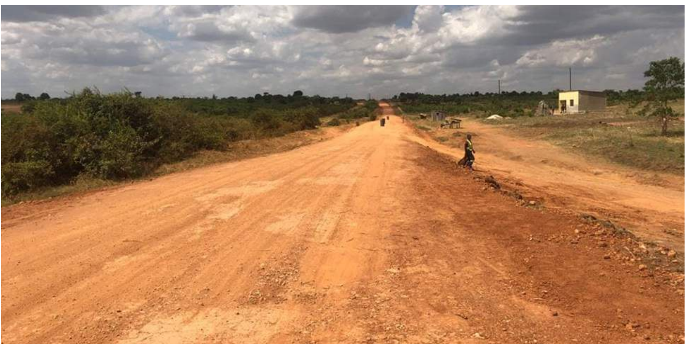
Lundazi-Chasefu Road in Eastern Province.

The Lundazi-Chasefu Road has since been opened to traffic, a development that has cheered the residents of Chasefu and Lundazi Districts. The Insitu Jeremiah box culverts borders Chasefu and Lundazi Districts in Eastern Province.