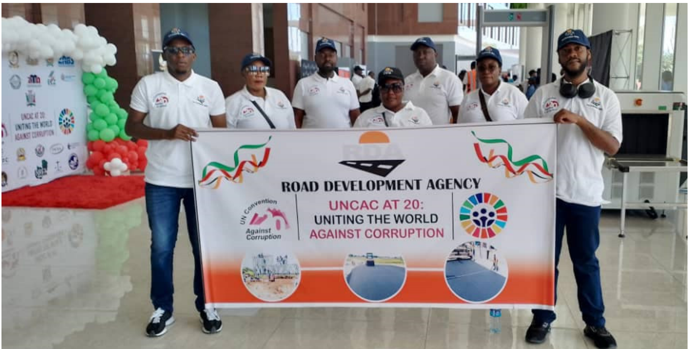
RDA team during the 2023 International Anti-Corruption Day in Lusaka.

This year's theme is, "UNCAC at 20: Uniting the World Against Corruption."