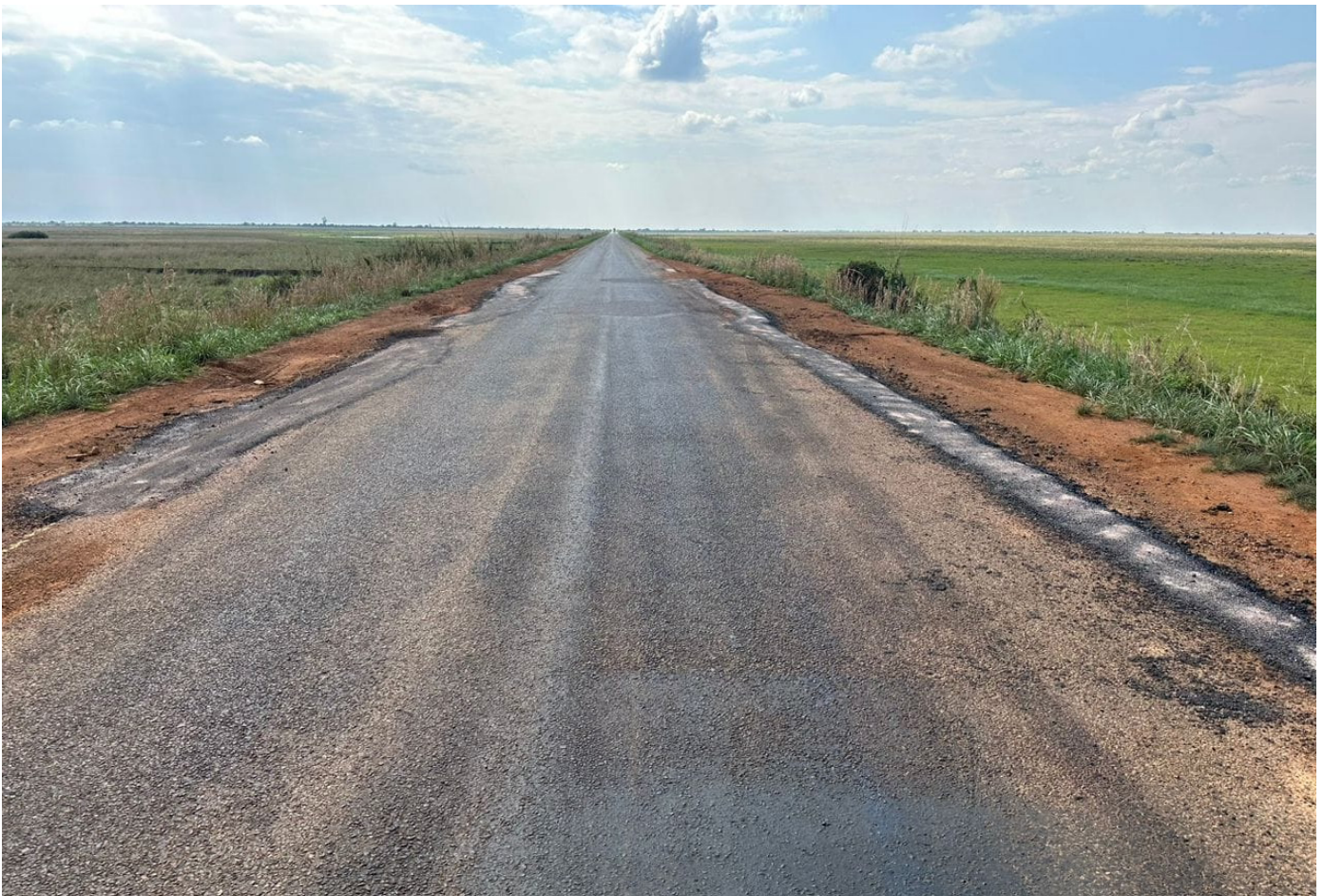
Edge repair works on the Tuta Road.