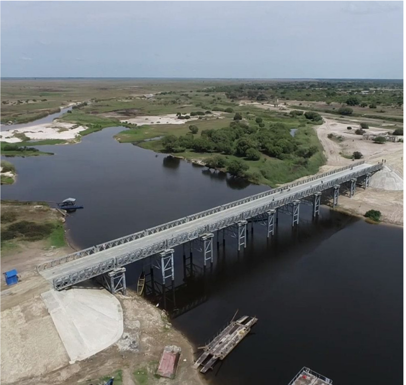
Newly constructed Luanginga Bridge in Kalabo District in Western Province.