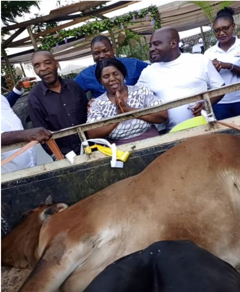
Gift well presented.