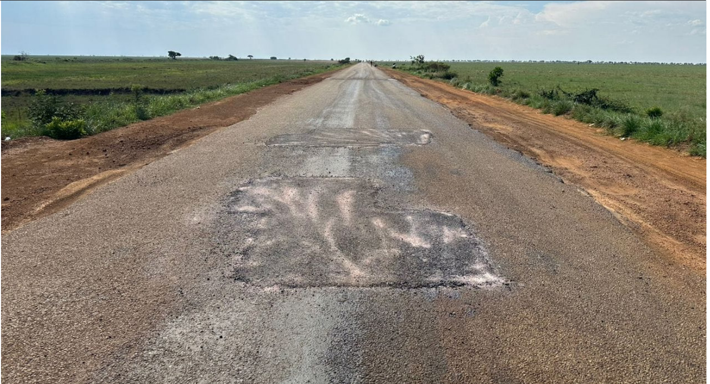
Patched sections on Tuta Road from Musaila-Mukuku Bridge.