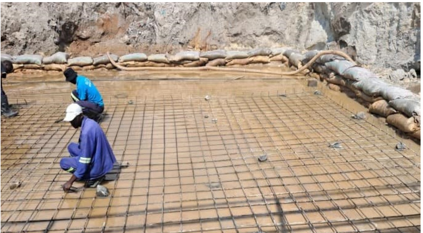
Steel enforcement on Gibson Chimfwembe and Lulamba box culverts.

Placing of the culverts commenced in the week beginning 13 th November 2023. The works are expected to be completed by mid-December 2023.