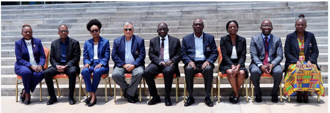
Infrastructure, Housing and Urban Development Minister, Hon. Eng. Charles L. Milupi (fifth from left) with RDA Board Members after the launch of the RDA 2022-2026 Strategic Plan.