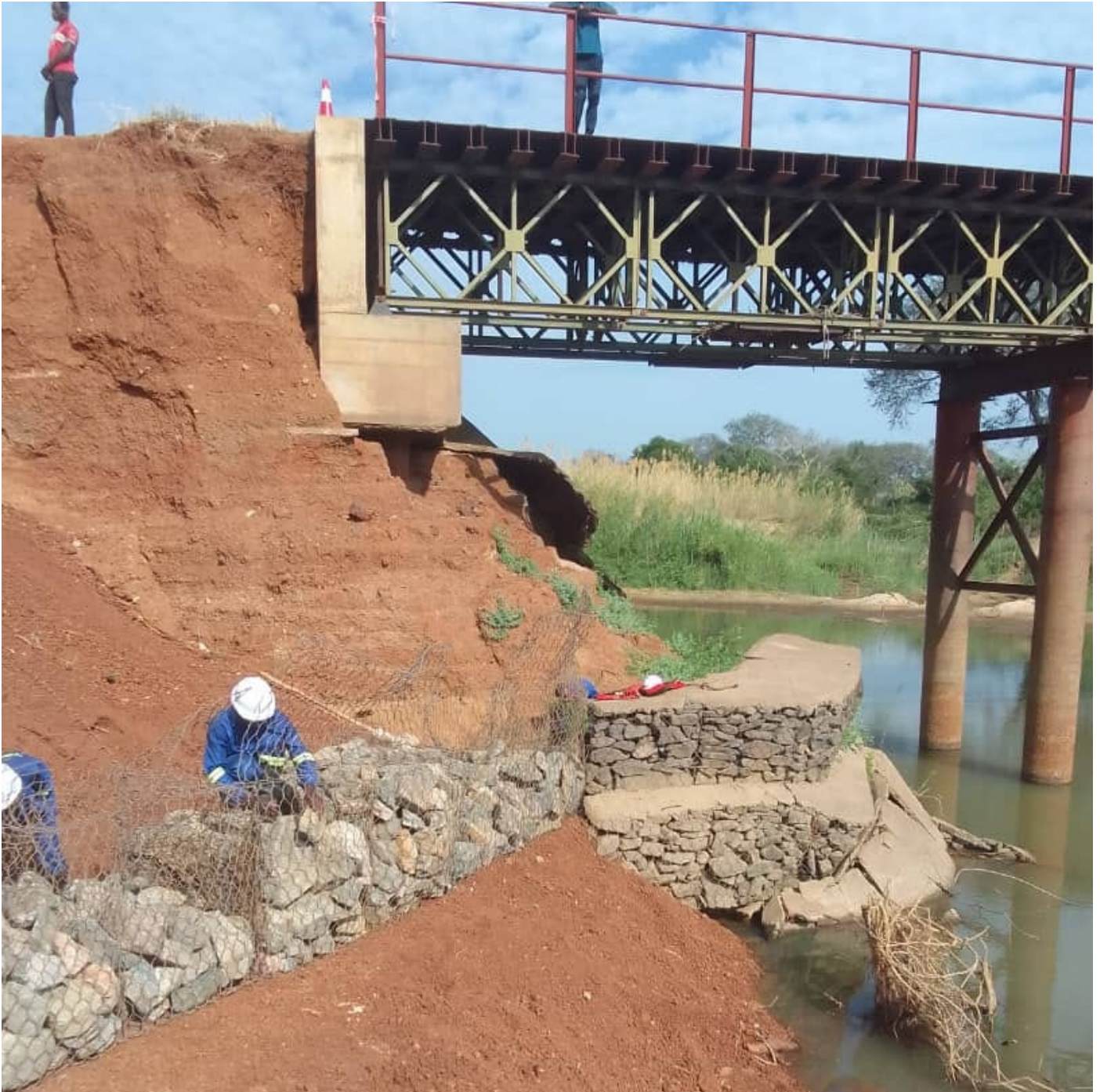
Emergency maintenance works on Luangwa Bridge along the Chama-Matumbo Road.

The embankments for the approach roads and abutments at Luangwa Bridge on the Chama-Matumbo Road were eroded during the 2022/2023 rainy season.