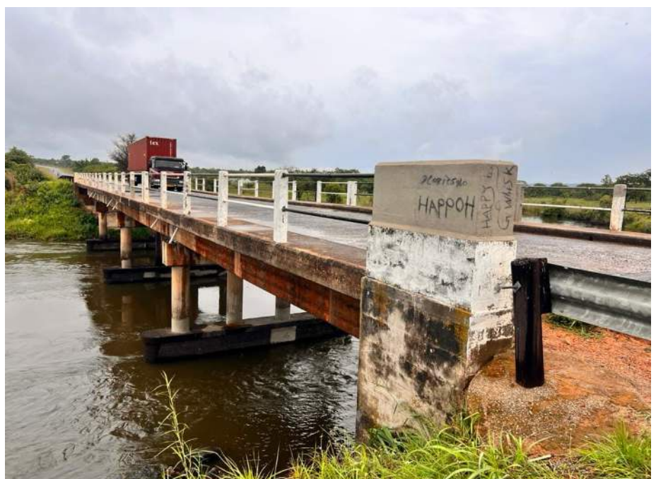
Lukulu Bridge along the Kasama-Luwingu Road.