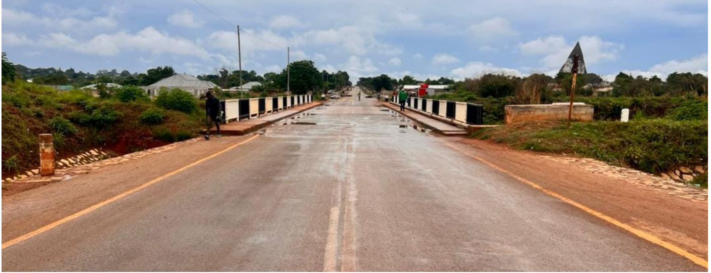
Lukashya Bridge in Kasama District.

R outine Bridge Maintenance is cardinal in ensuring the sustenance of crossing points in order for them to attain their design life span.