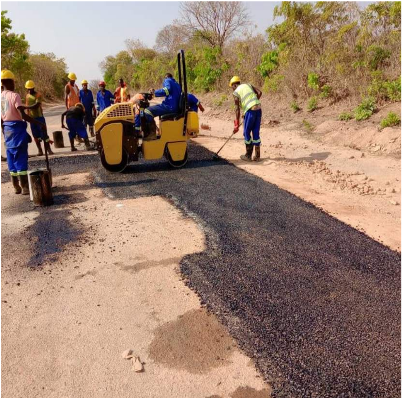
Lundazi-Chasefu Road in Eastern Province.