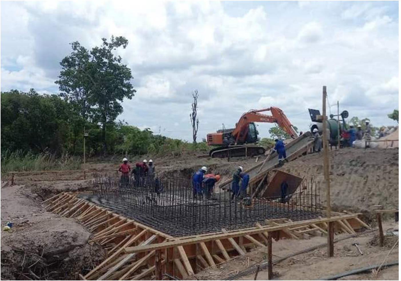
Construction works of the Aluni Mulonga ACROW Bridge.

T he Road Development Agency (RDA) is working with the Zambia National Service (ZNS) to construct the Aluni Mulonga ACROW Bridge in Kanchibiya District of Muchinga Province.