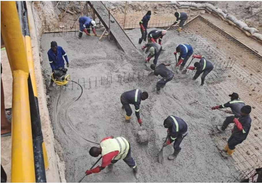
Construction works at the Gibson Chimfwembe and Lulamba box culverts in Chingola District.

T he Road Development Agency (RDA) is constructing two box culverts connecting Gibson Chimfwembe and Lulamba townships in the Chingola District on the Copperbelt Province.