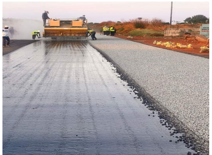
Reconstruction works on some sections of the Great North Road.