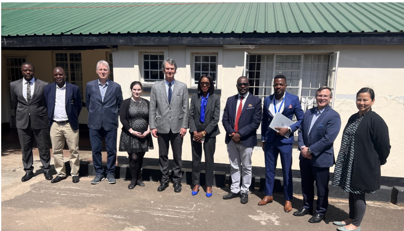
Group photograph of RDA and MCC officials after the meeting at RDA head office in Lusaka.

A team of technical officers from the Millennium Challenge Corporation (MCC) based in the United States of America (USA) recently engaged the Road Development Agency (RDA) in relation to the second Compact programme that will focus on directing investment towards supporting the growth of agriculture and agro-processing in Zambia.