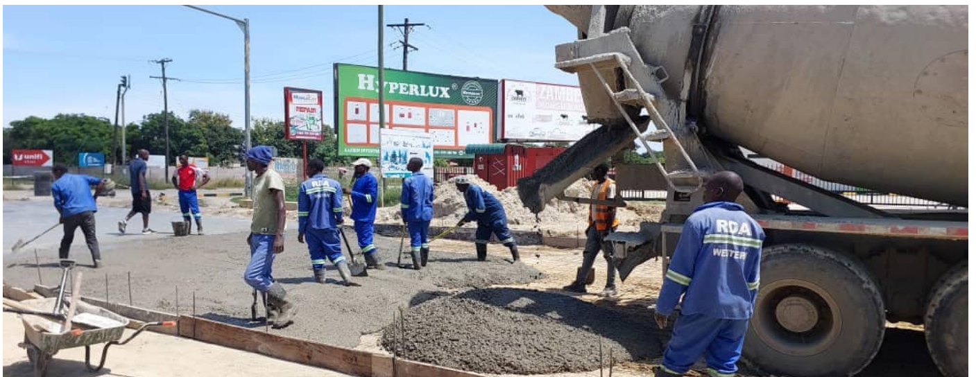
The construction of a 60 meters rigid pavement at Mongu traffic lights.

Project Risk Management is a critical process that helps ensure a project's success. By identifying potential risks, assessing their impact, and developing mitigation plans, the project team can reduce the likelihood of project failure.