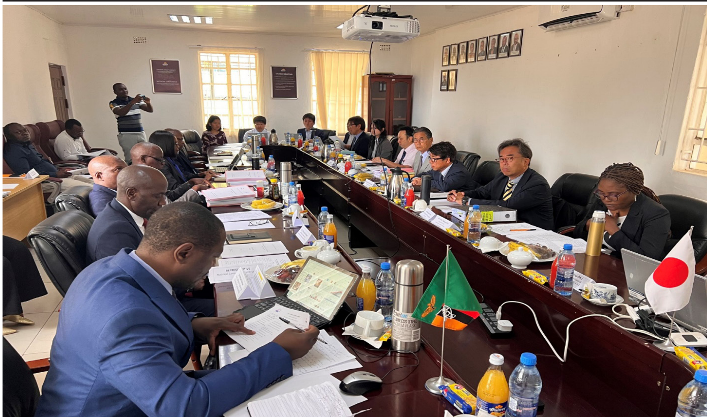
Participants to the 4th Joint Coordinating Committee (JCC) meeting of the JICA Technical Cooperation Project (TCP) at the RDA head office conference room.

The Zambian Government has assured Japan that the knowledge obtained from the Japan International Cooperation Agency (JICA) Bridge Maintenance Capacity Building Project shall be put to good and sustainable use.