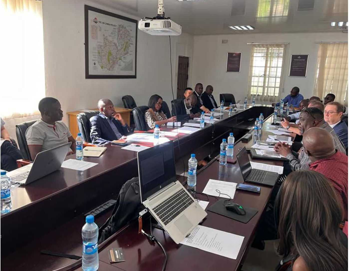
RDA officials during a meeting with representatives from some Copperbelt Mining Firms at RDA head office recently.

A s part of the programme to improve the road network, the Government through the Road Development Agency (RDA) has contracted Turbo Kachin Consortium (Turbo-KC) as the Concessionaire to rehabilitate the Chingola-Kasumbalesa Road under the Public-Private Partnership (PPP) Model.