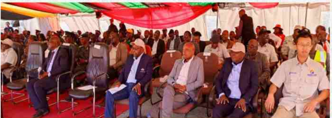
Invited guests following proceedings during the groundbreaking ceremony in Luanshya.