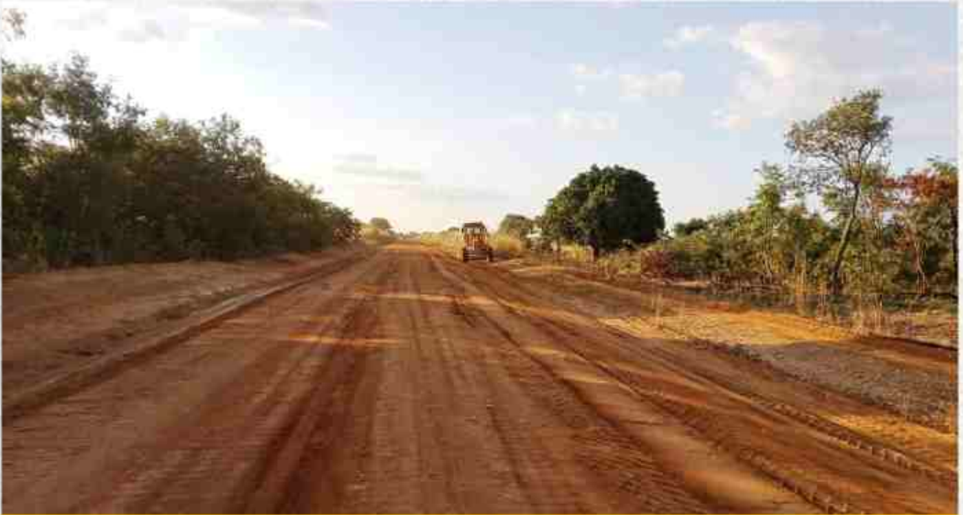
Spot improvement works on the Chama-Lundazi Road.