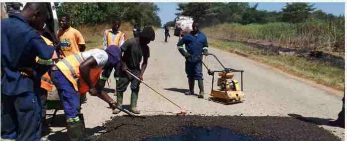
Mpika-Kasama Road maintenance works in Northern Province.