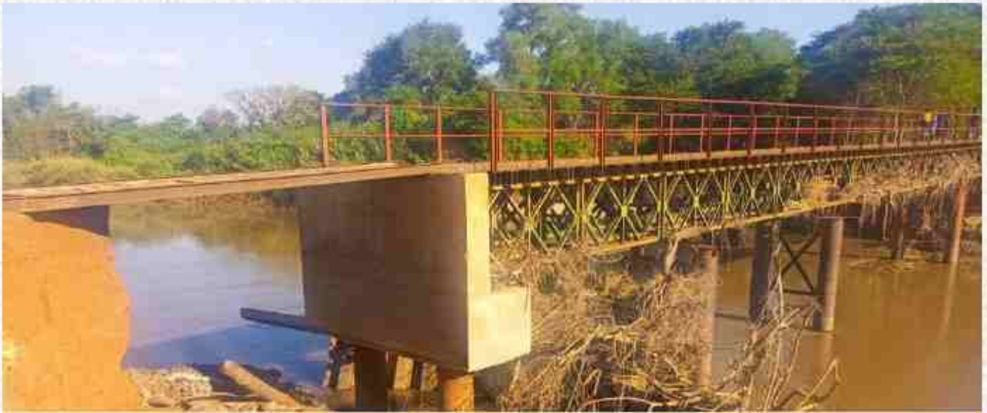
Luangwa Bridge repair works in Chama District.

Following the washaway of an approach embankment to Luangwa Bridge on 27 th January 2024 due to flash floods experienced in the area, the Chama-Matumbo Road was cut-off completely at Luangwa River.