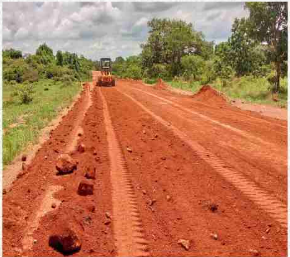
Mumbwa-Landless Corner Road works

The dumping and spreading of gravel are ongoing and physical progress attained stands at 40%.