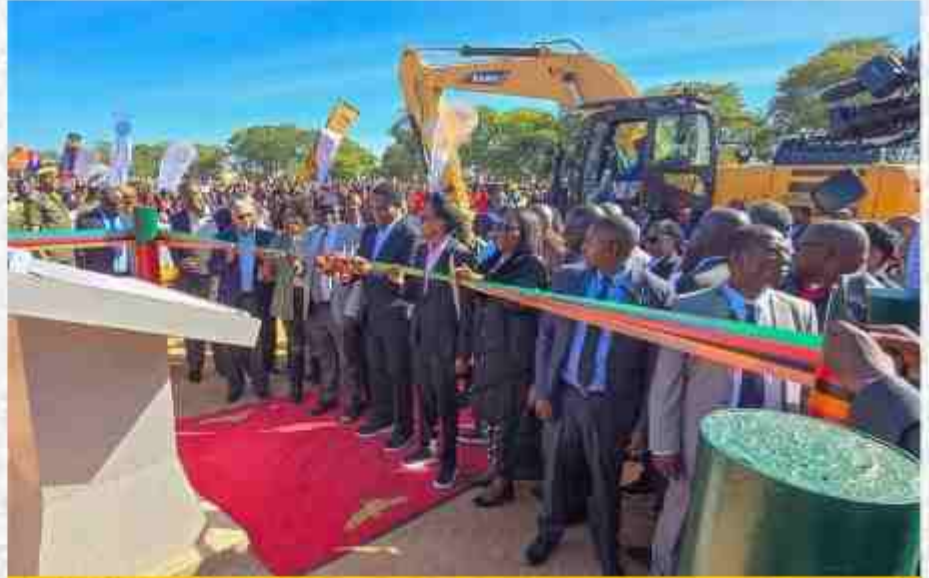
President Hakainde Hichilema cutting the ribbon (while others look on) during the groundbreaking ceremony for the construction of the Lusaka-Ndola Dual Carriageway.

Further by law, any Concession on a PPP project is mandated to reserve at least 20% of the works to Zambian contractors. So, Zambian contractors will also benefit from the project.