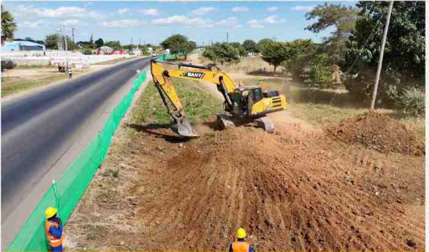
Preparatory works for the construction of Lusaka-Ndola Dual Carriageway