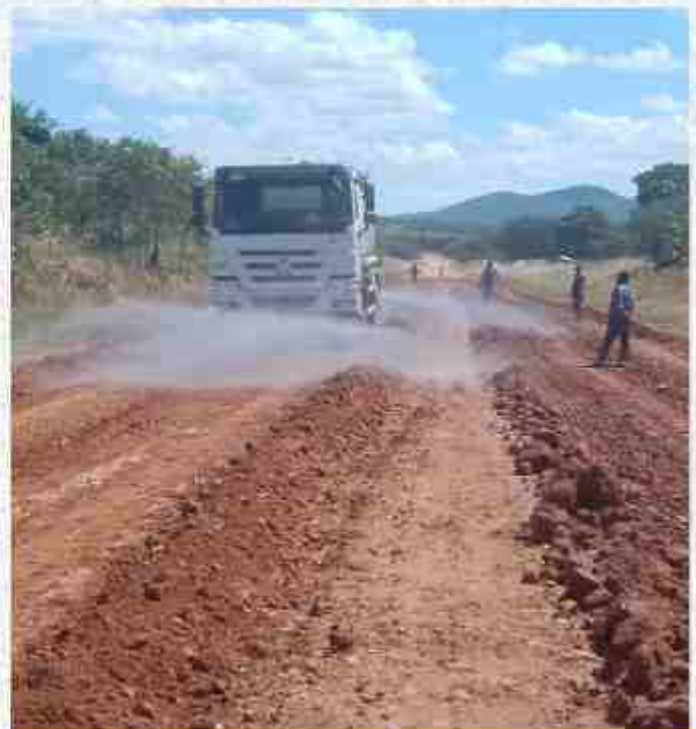
Spot improvement works on the Chipata-Vubwi Road.