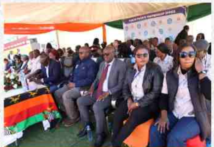
The guest of honour with invited guests at groundbreaking ceremony for construction of the Lusaka-Ndola Dual Carriageway in Chibombo District.