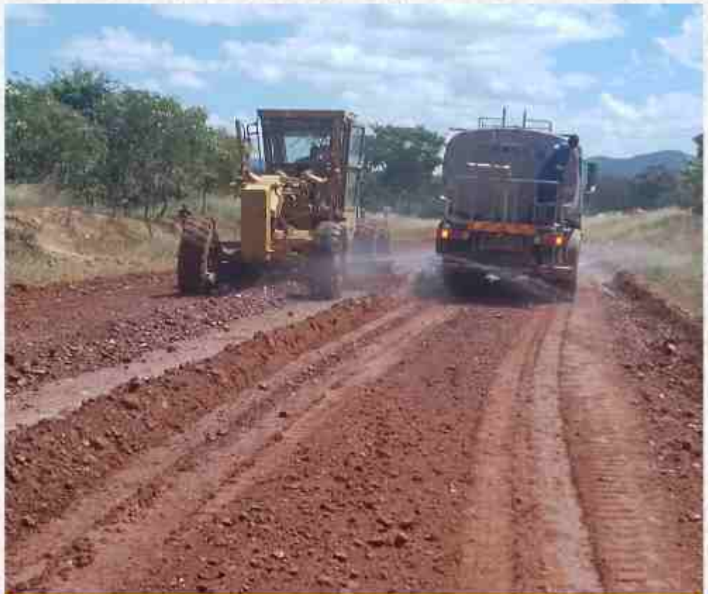
Spot improvement works on the Chipata-Vubwi Road in Eastern Province

The works are being undertaken on the section between Katambo Village and Mwami Hospital on the Chipata-Vubwi Road.