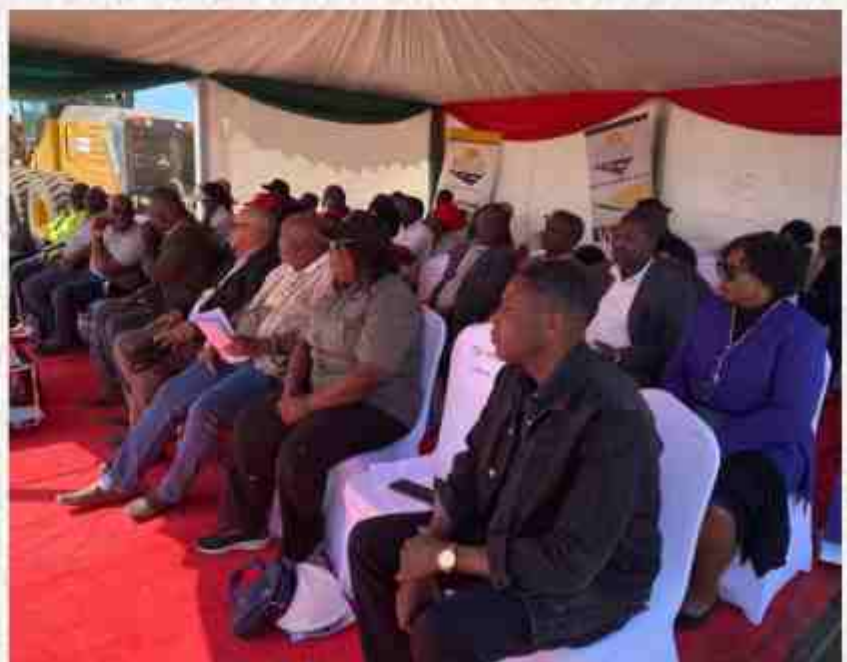
Invited guests following proceedings at 10 miles during the groundbreaking ceremony for construction of the Lusaka-Ndola Dual Carriageway.