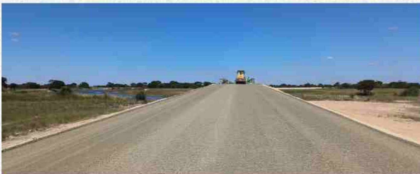
Works on the road connecting Luanginga and Silanda Bridges in Kalabo District.