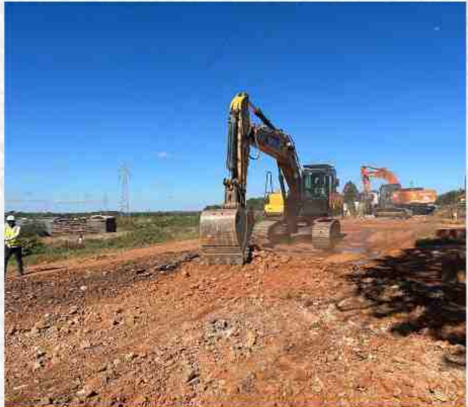
Clearing and grubbing works in progress on the Chibuluma Road in Kitwe.

The following were the planned works in May 2024: Clearing and grubbing, relocation of services, construction of pipe culverts, construction of the box culvert, earthworks, roadbed preparation, cement stabilised subbase construction, construction of concrete lined drains and construction of the rigid concrete pavement.