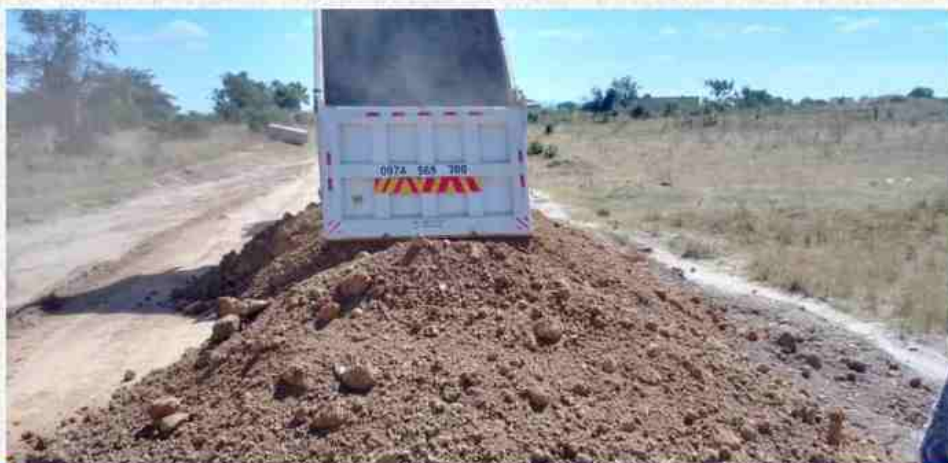
Rehabilitation of the Mungule-Katole Road in Chibombo District.

The rehabilitation of Mungule-Katole Road will facilitate quick transportation of farm inputs and produce to and from the farming community in the area. Travel time and vehicle operating costs shall drastically reduce and generally, a reduction in the cost of doing business will be achieved.