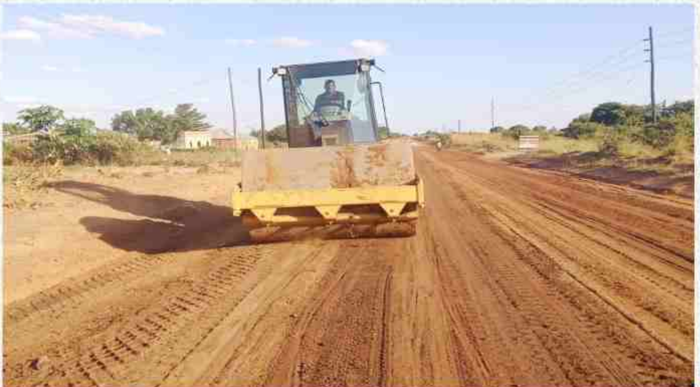
Spot improvement works on the Chama-Lundazi Road.

Currently, 7 kilometres of road formation has been completed.