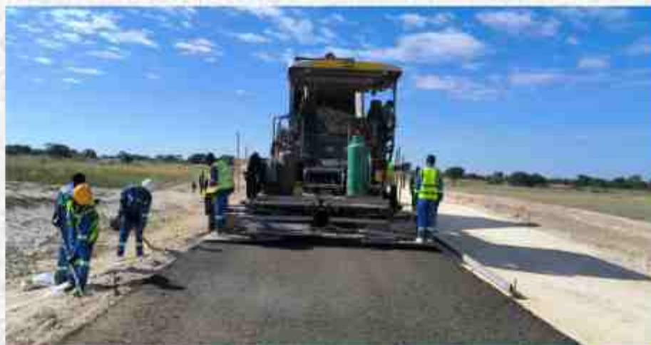
Laying of crushed stone base on the road connecting the Luanginga and Silanda Bridges in Kalabo District.

About 1 kilometre has so far been done and after a few days, asphalt works will also commence.