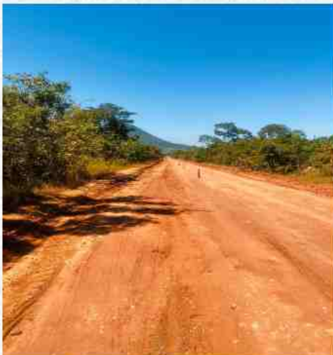
Spot improvement works on the Chipata-Vubwi Road.