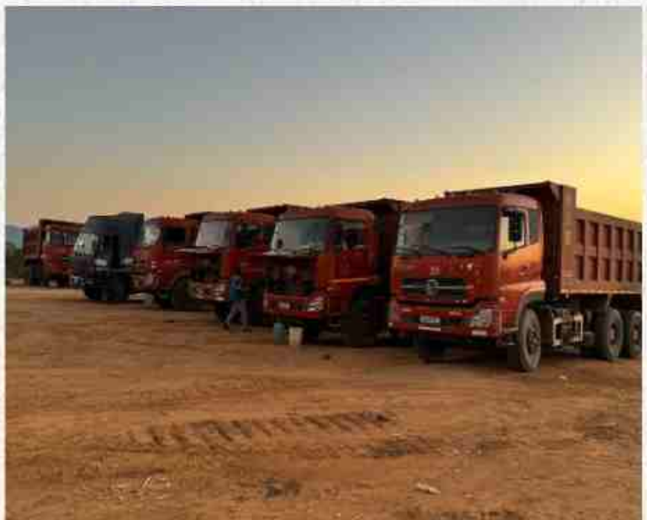
Site mobilization for rehabilitation works of the Batoka-Maamba Road in Southern Province.

The improved road will directly benefit Zambia's vital mining and agricultural sectors. Faster and more efficient transportation will connect producers to markets, unlocking economic potential and promote job creation.