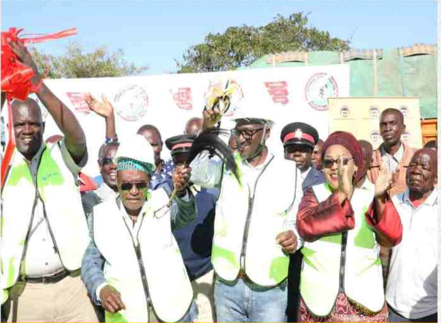
Minister of Green Economy and Environment, Hon. Eng. Collins Nzovu (third from left) cutting the ribbon during the groundbreaking ceremony for construction of the Lusaka-Ndola Dual Carriageway.

The groundbreaking ceremony for construction of the Lusaka-Ndola Dual Carriageway and rehabilitation of 45 kilometres Masangano-Fisenge-Luanshya Road was also held Chibombo District. The sub-avent was graced by Green Economy and Environment Minister, Hon. Eng. Collins Nzovu.