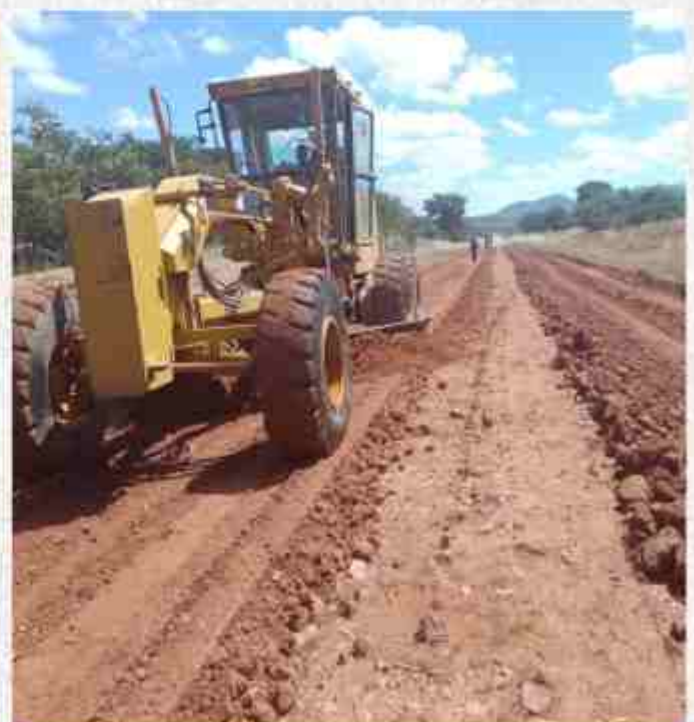
Mumbwa-Landless Corner Road works