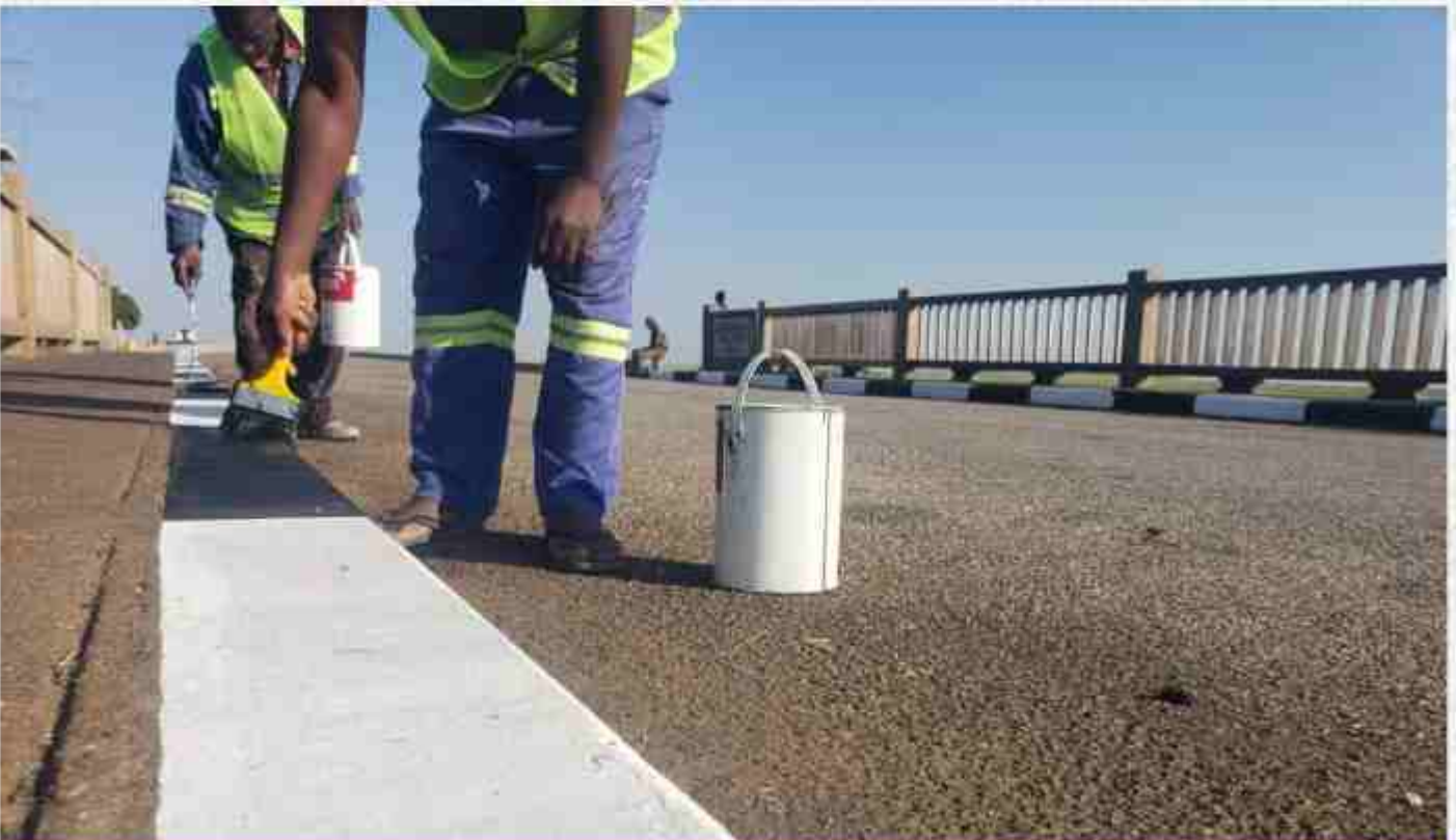
Mukuku Bridge on the Tuta Road in Leapula Province.