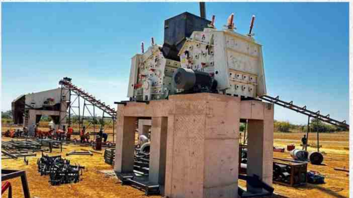
Crusher Plant installation for the Ndola-Mufulira Road Project.

The Concessionaire is currently setting up of the crusher plant in readiness for the works to be undertaken under the Public-Private Partnership (PPP) financing model.