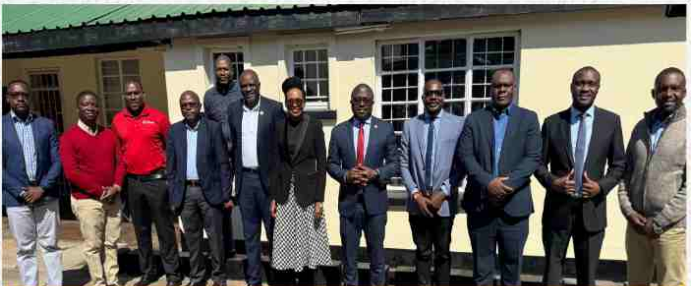
Group photo: Officials from the RDA and ZAMTEL.

Stakeholder management remains at centre stage of the Road Development Agency (RDA) strategic objectives as its a prerequisite for successful project implementation.