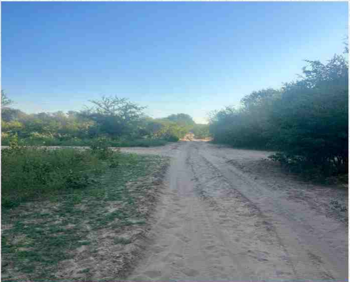
Current state of the Lusu-Imusho Road in Sesheke District in Western Province