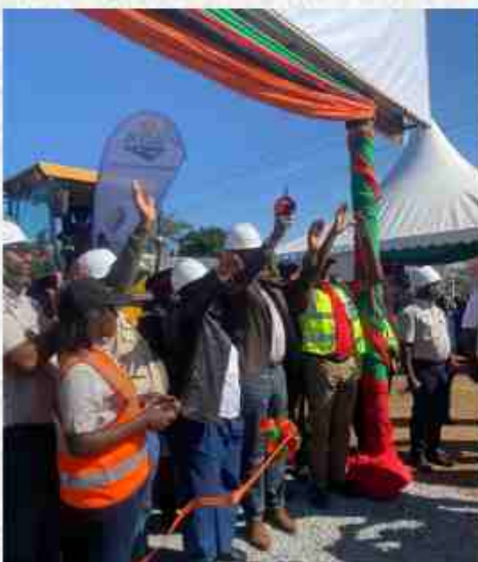
Technology and Science Minister, Hon. Felix Mutati graced the sub-event at 10 miles to mark the groundbreaking ceremony for construction of the Lusaka-Ndola Dual Carriageway.