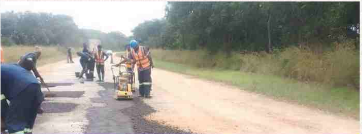
Mpika-Kasama Road maintenance works in Northern Province.