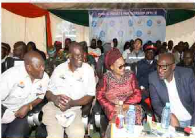
The guest of honour with invited guests during the groundbreaking ceremony for construction of the Lusaka-Ndola Dual Carriageway in Chibombo District.