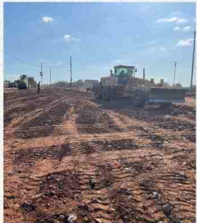
Chibuluma Road works in Kitwe.