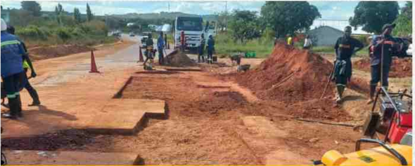
Mpika-Kasama Road maintenance works in Northern Province.