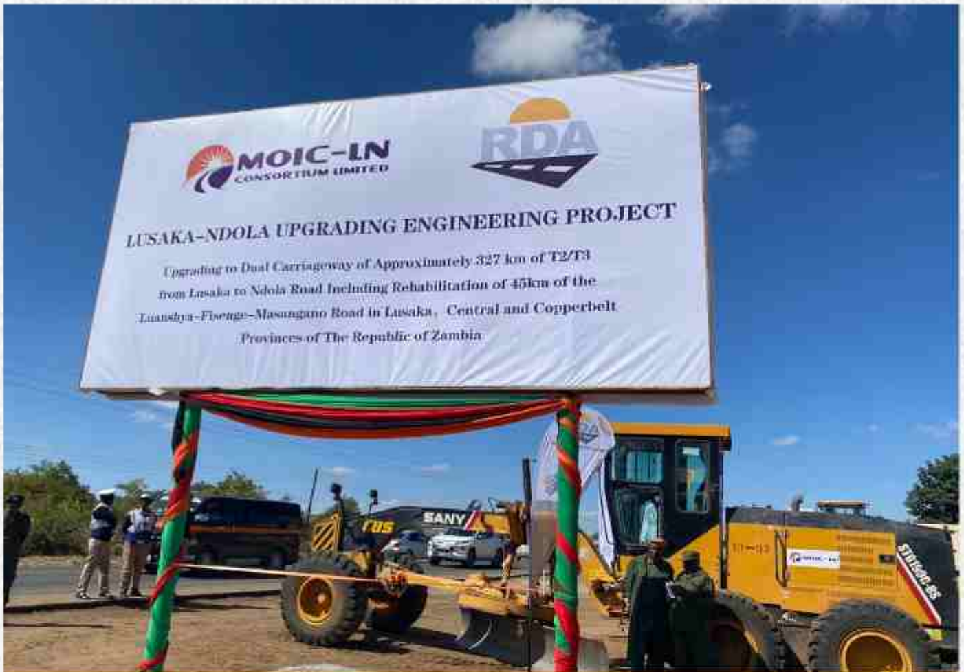
Billboard placed at 10 miles.

The groundbreaking ceremony for construction of the Lusaka-Ndola Dual Carriageway and rehabilitation of 45 kilometres Masangano-Fisenge-Luanshya Road at 10 miles. The sub-event was graced by Technology and Science Minister, Hon. Felix Mutati.