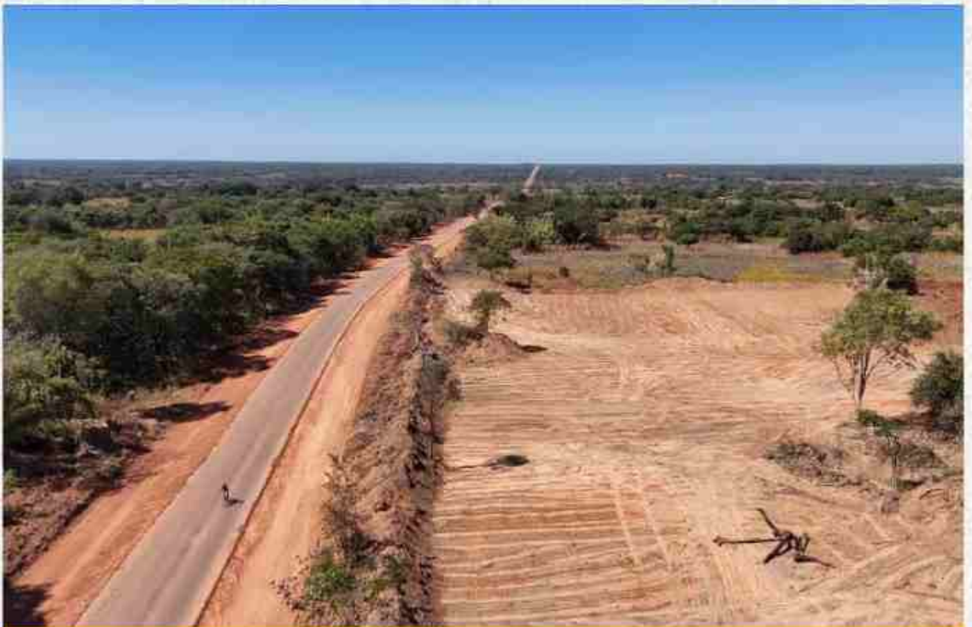
Aerial view of the Masangano-Fizanga-Luanshya Road