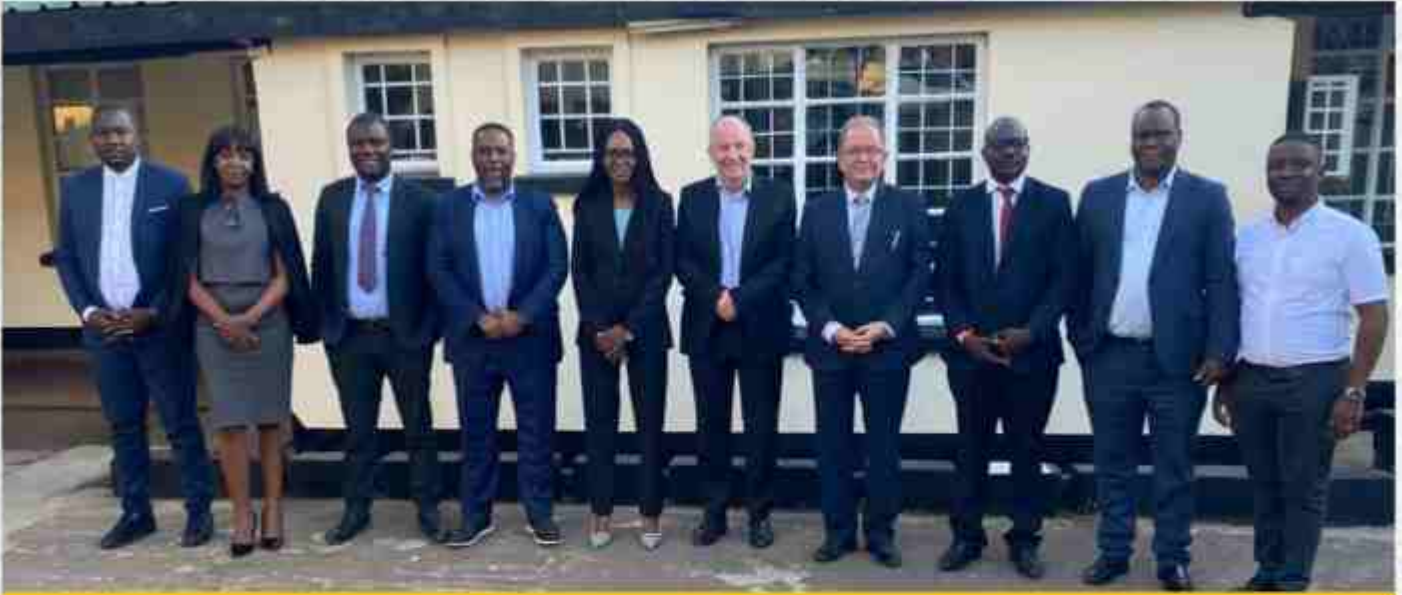
Group photo: Officials from the RDA and the World Bank.