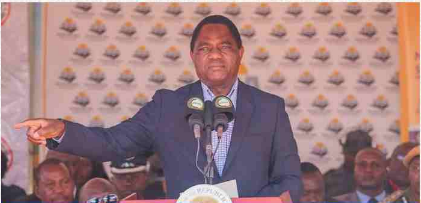
President Hakainde Hichilema delivering his keynote speech during the groundbreaking Ceremony to upgrade to dual carriageway the 327 kilometres Lusaka-Ndola Road and rehabilitation of the Masangano-Fisenge-Luanshya Road at one of the construction camps in Kapiri Mposhi District.

President Hakainde Hichilema on 21 st May 2024 officially launched the construction works of the Lusaka-Ndola dual carriageway, spanning 327 kilometers and also includes the rehabilitation of the Masangano-Fisenge-Luanshya Road.