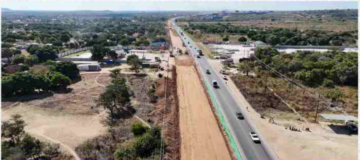
Aerial view of the works on the Lusaka-Ndola Dual Carriageway.