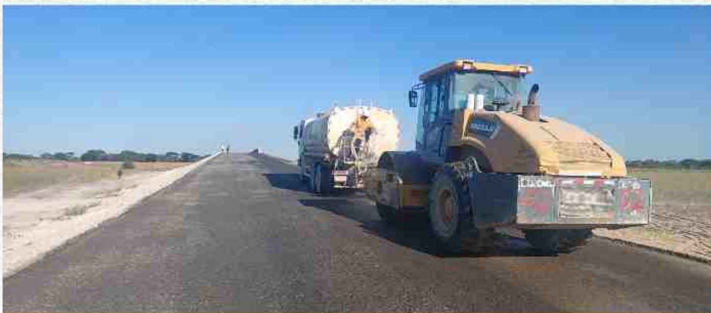
Laying of crushed stone base on the road connecting the Luanginga and Silanda Bridges in Kalabo District.