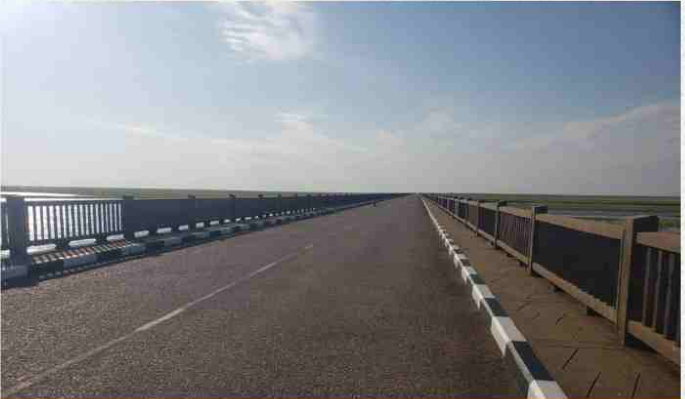
Painting works at Mukuku Bridge on the Tuta Road in Leapula Province.