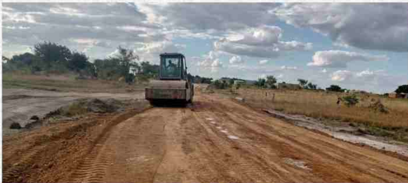
Rehabilitation of the Mungule-Katole Road in Chibombo District.

The Road Development Agency (RDA) has embarked on the project to rehabilitate the Mungule-Katole Road in Chibombo District.