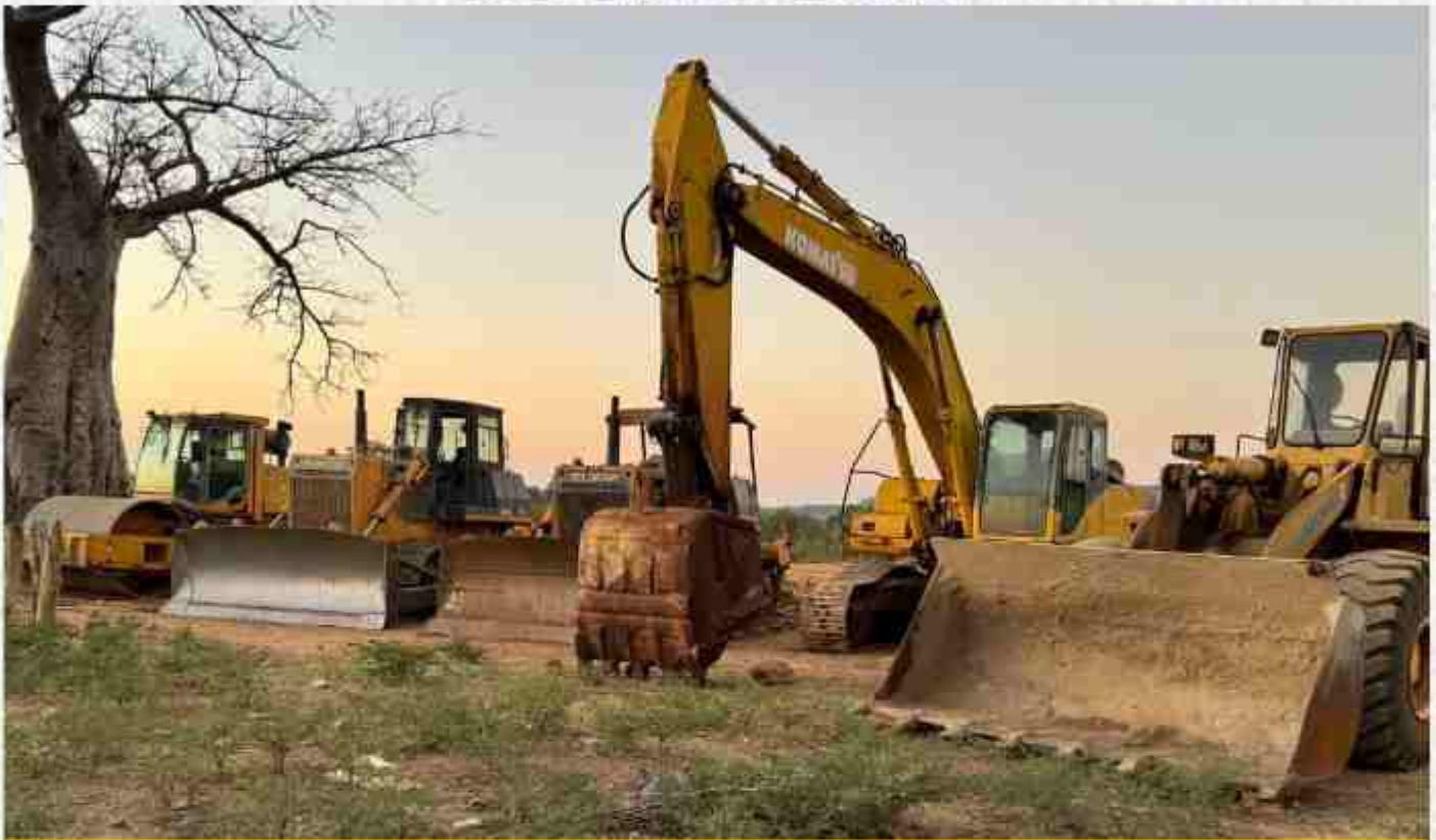
Site mobilization for rehabilitation works of the Batoka-Maamba Road in Southern Province.

China Geo-Engineering Corporation and Chipangano Builders Limited JV have started mobilising in readiness to commence rehabilitation works on the Batoka-Maamba Road in Southern Province.