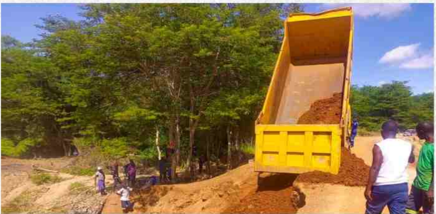
Luangwa Bridge repair works in Chama District.

The materials for the construction of the abutment have also been delivered on site.