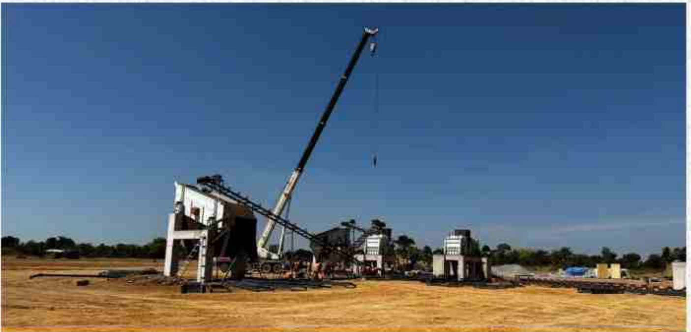
Crusher Plant installation on the Ndola-Mufulira Road Project.

The Concession Agreement for the finance, design, build, operate, maintain and transfer of 66 kilometres of the Ndola-Sakanla-Mufullira Road and border infrastructure at Sakanla on the Copperbelt Province was signed on 16 th October 2023 with Jaiyou Ports Limited.