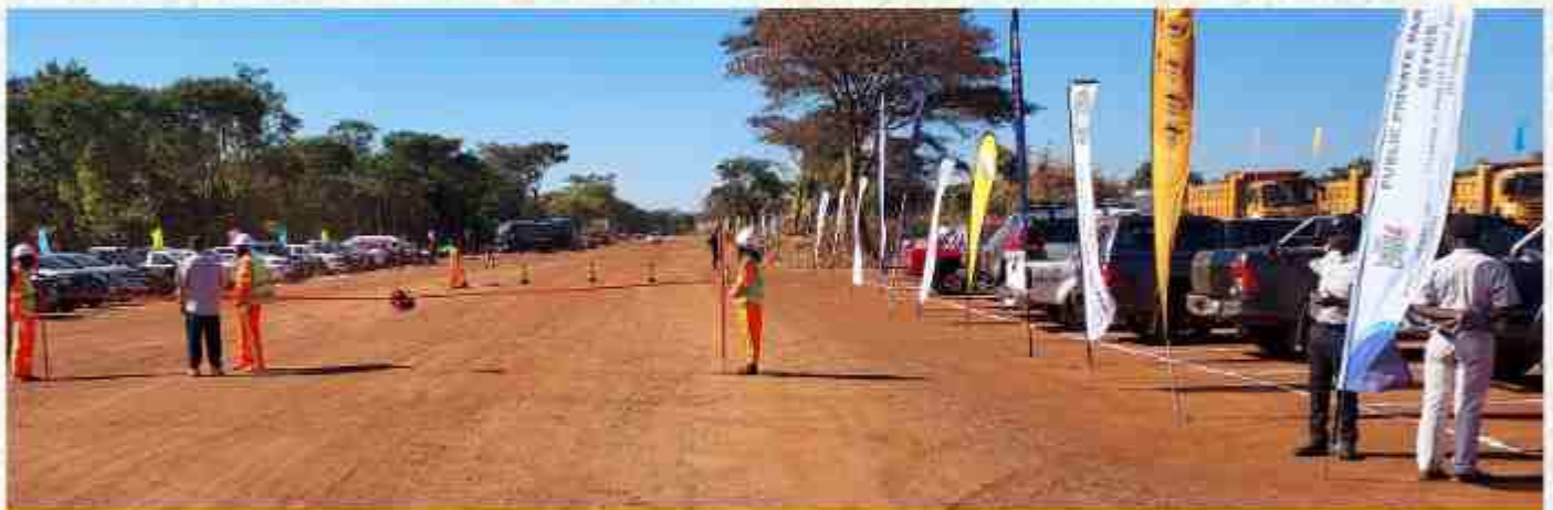
A section of the Masangano-Fisanga-Luanshya Road where the groundbreaking ceremony was held.