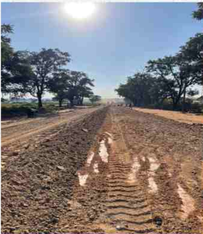
Chibuluma Road works in Kitwe.