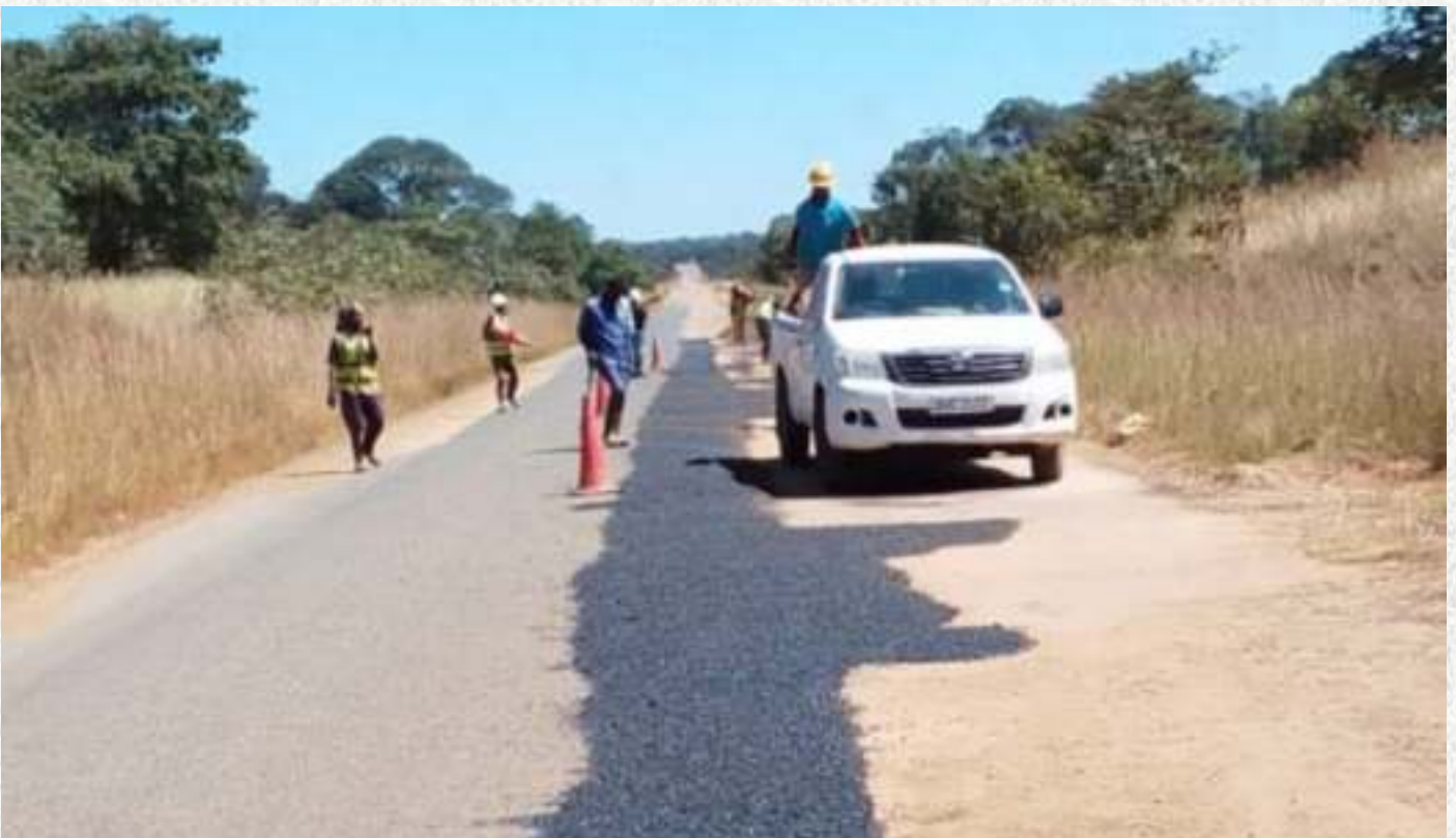
Pothole patching works on the Kisasa-Mwinilunga Road.