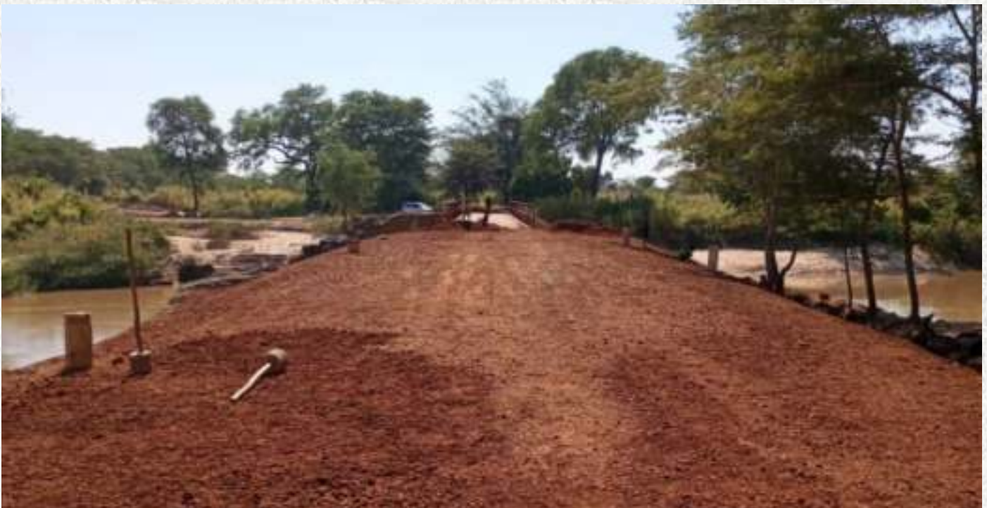
Works on approaches to the Luangwa Bridge on Chama-Matumbo Road.

Backfilling and reinstatement of the eroded embankment of the approach road on the Matumbo side has been substantially completed while excavations and casting of reinforced base for the abutment on the Chama side of the bridge has been completed.