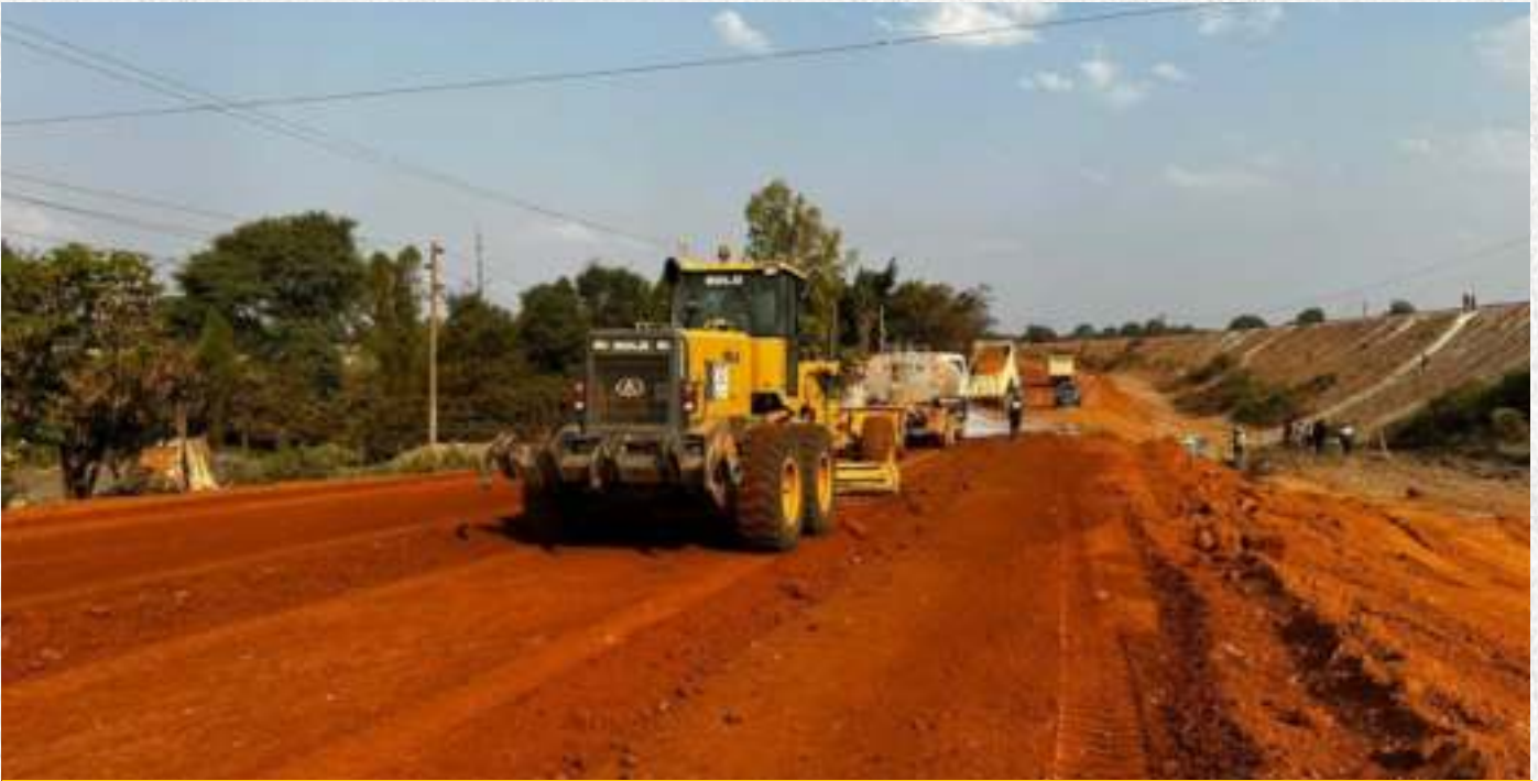
Chibuluma Road works.

The Road Development Agency (RDA) has engaged East to West Construction and Mining Limited to construct the 7 kilometres Chibuluma Road in Kitwe to concrete standard.