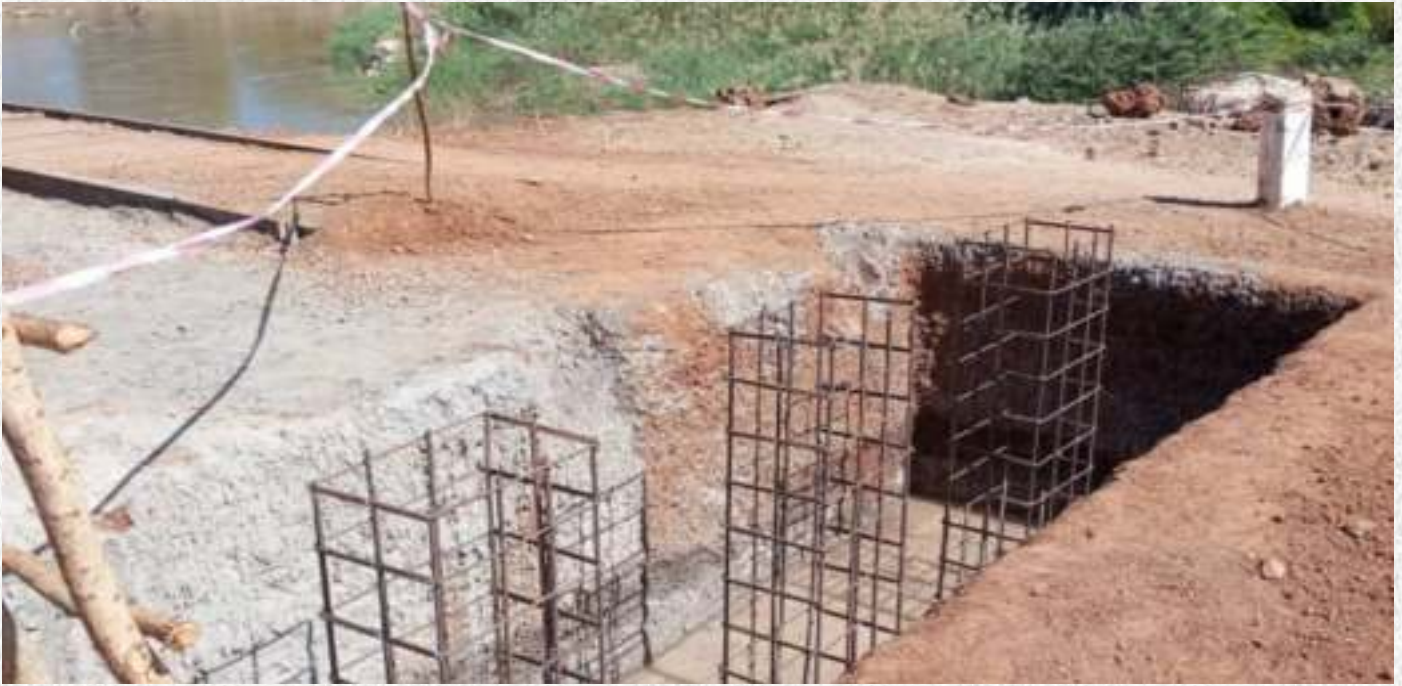
Works on approaches to the Luangwa Bridge on Chama-Matumbo Road.

Following the washaway of an approach embankment to Luangwa Bridge on January 27, 2024 due to flash floods experienced in the area, the Chama-Matumbo Road was cut-off completely at Luangwa River.