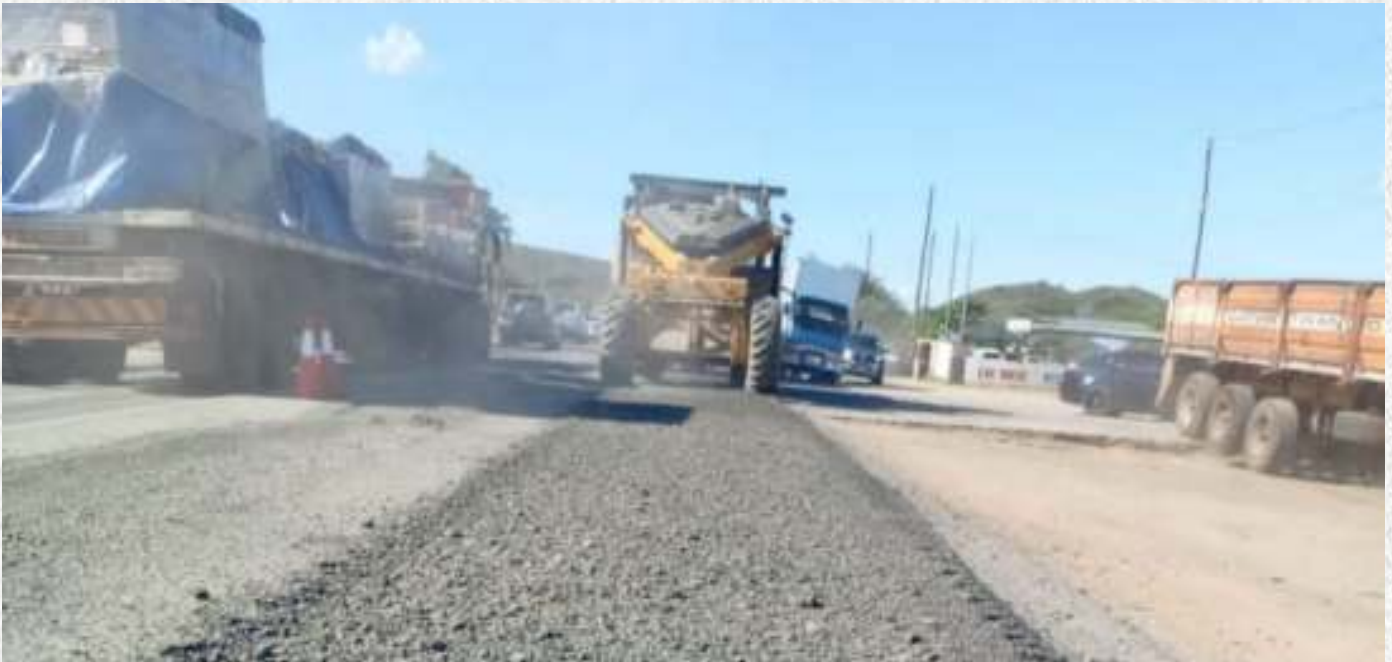
Lusaka-Chilundu Road works.

The Road Development Agency (RDA) has undertaken emergency works at the Kafue Road and Rail crossing along the Lusaka-Chirundu Road.