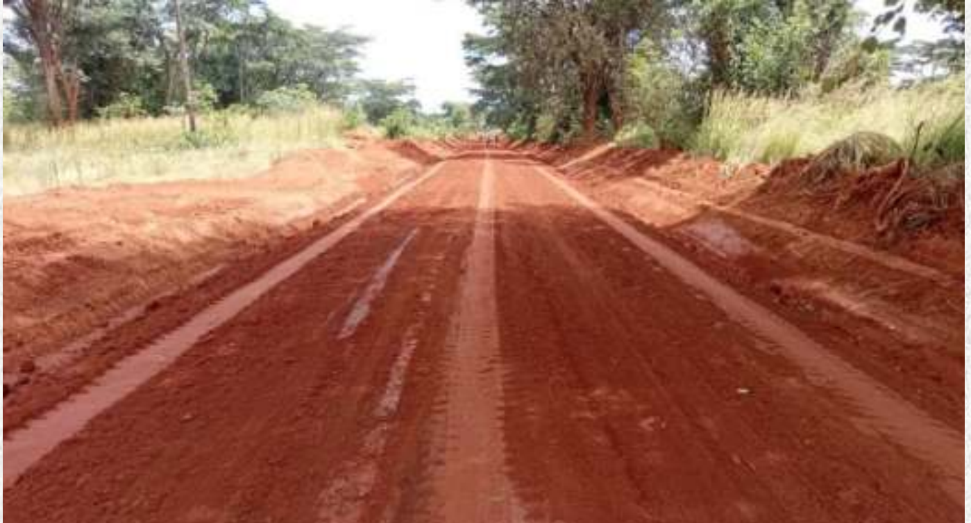
Works on access roads to tourism sites in Chinsali District.

The Road Development Agency (RDA) is undertaking works on selected roads to tourism sites in Chinsali District in Muchinga Province.