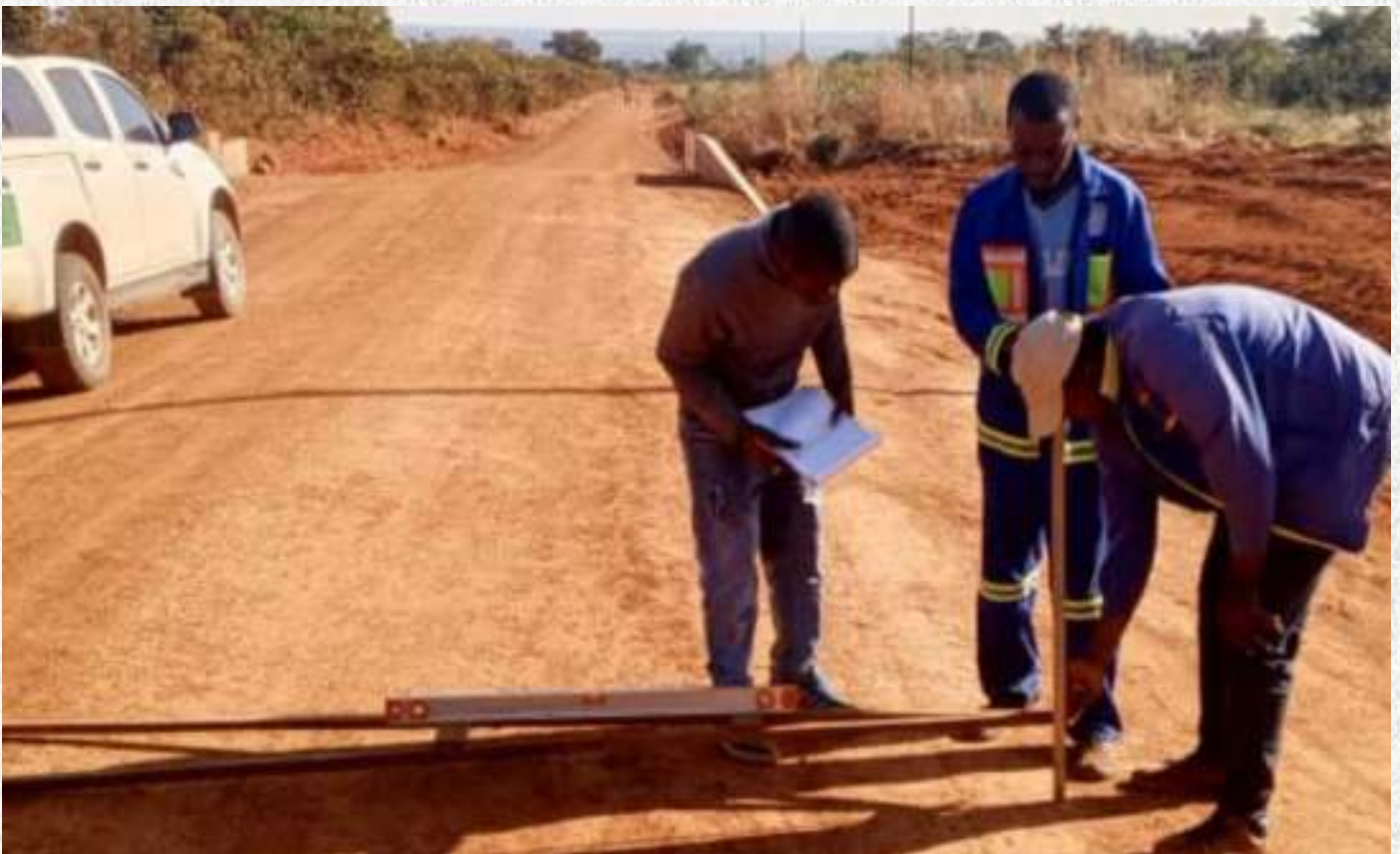
Quality checks on IRCP road works.

Below are images on works being undertaken under Package 14 in Chinsali and Shiwangandu Districts in Muchinga Province.