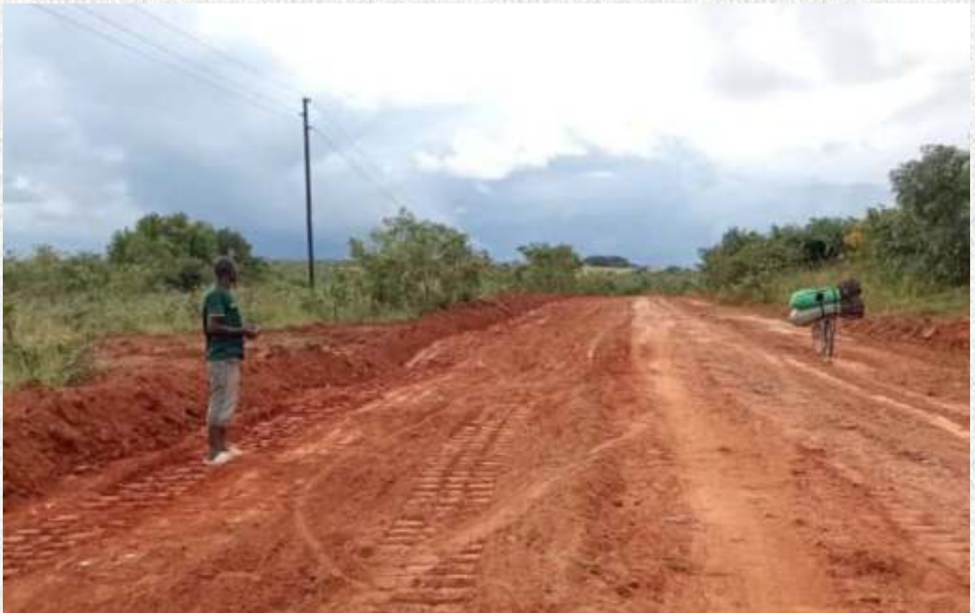
Nakonde-Kanyala Road works.