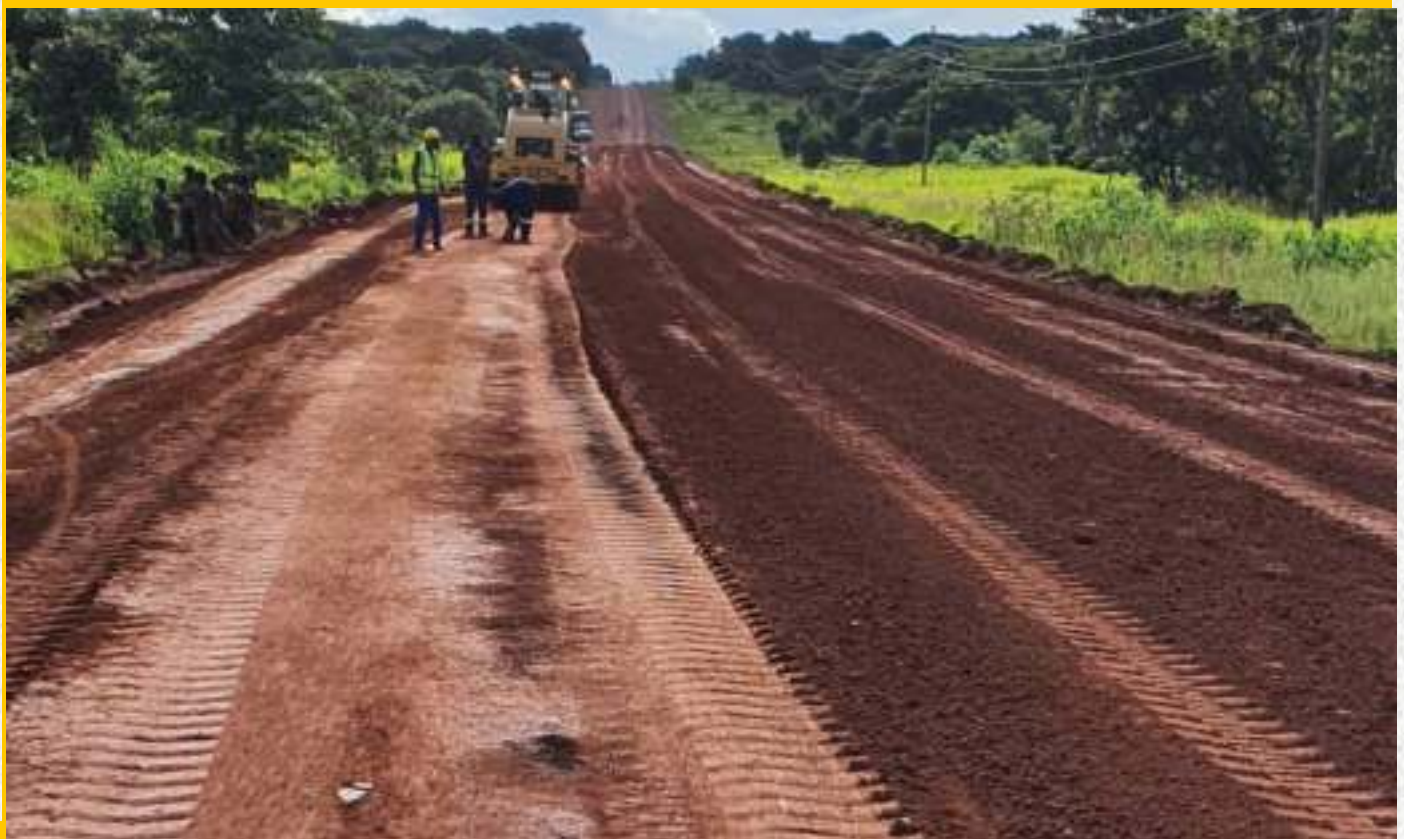
Holding maintenance works on the Kisasa-Mwinilunga Road.