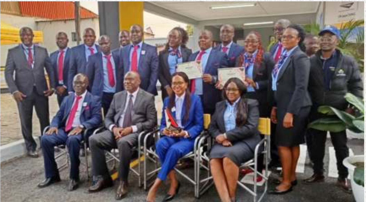
Group photo after the award ceremony

The RDA was at it again and scooped the first prize under the Most Innovative Public Sector category while the Zambia Revenue Authority (ZRA) scooped the second prize.