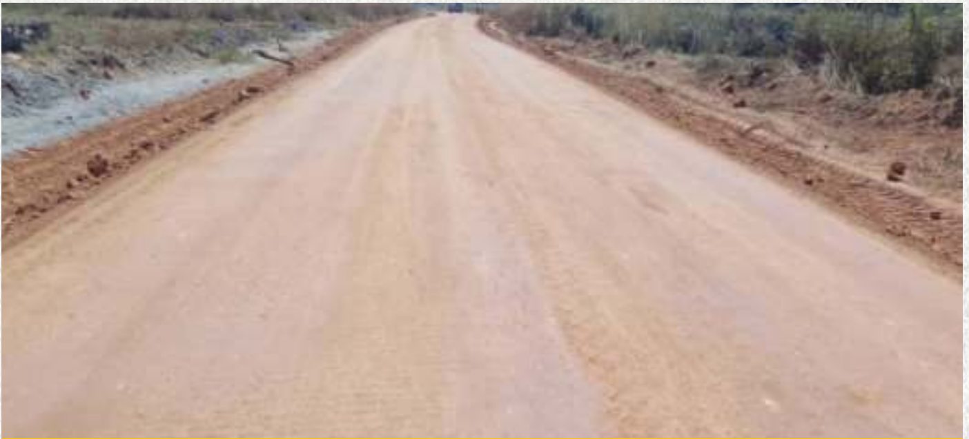
IRCP road works in Muchinga Province.

The Government through Road Development Agency (RDA) has been rehabilitating feeder roads under the Improved Rural Connectivity Project (IRCP).