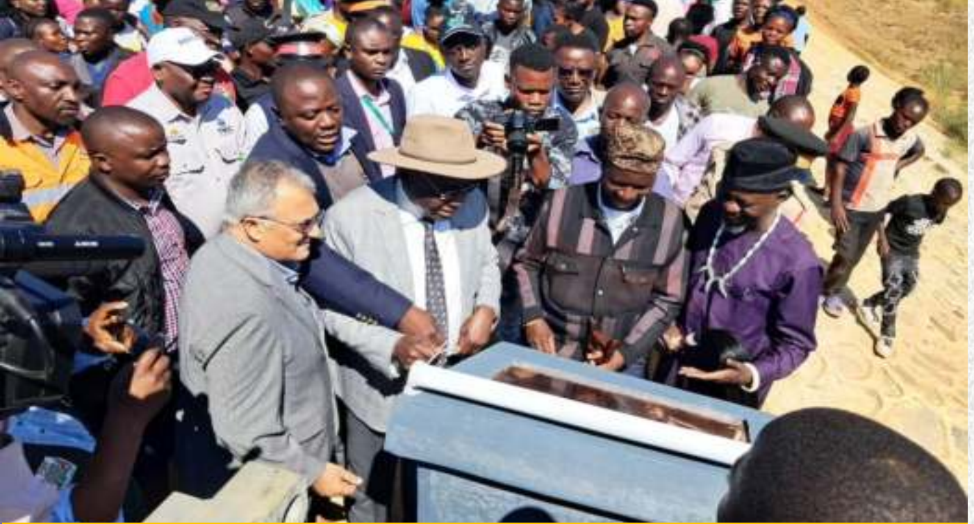
Infrastructure, Housing and Urban Development Minister, Hon. Eng. Charles L. Milupi unveiling the plaque during the commissioning of the ACROW Bridge in Northern Province.

He said the ACROW Bridges comprises single and multi-span structures of one and two-lane widths ranging from 12 meters to more than 100 meters in length and were being installed throughout the country by local Zambian engineers, technicians and contractors, trained in the field on assembly, installation and maintenance.