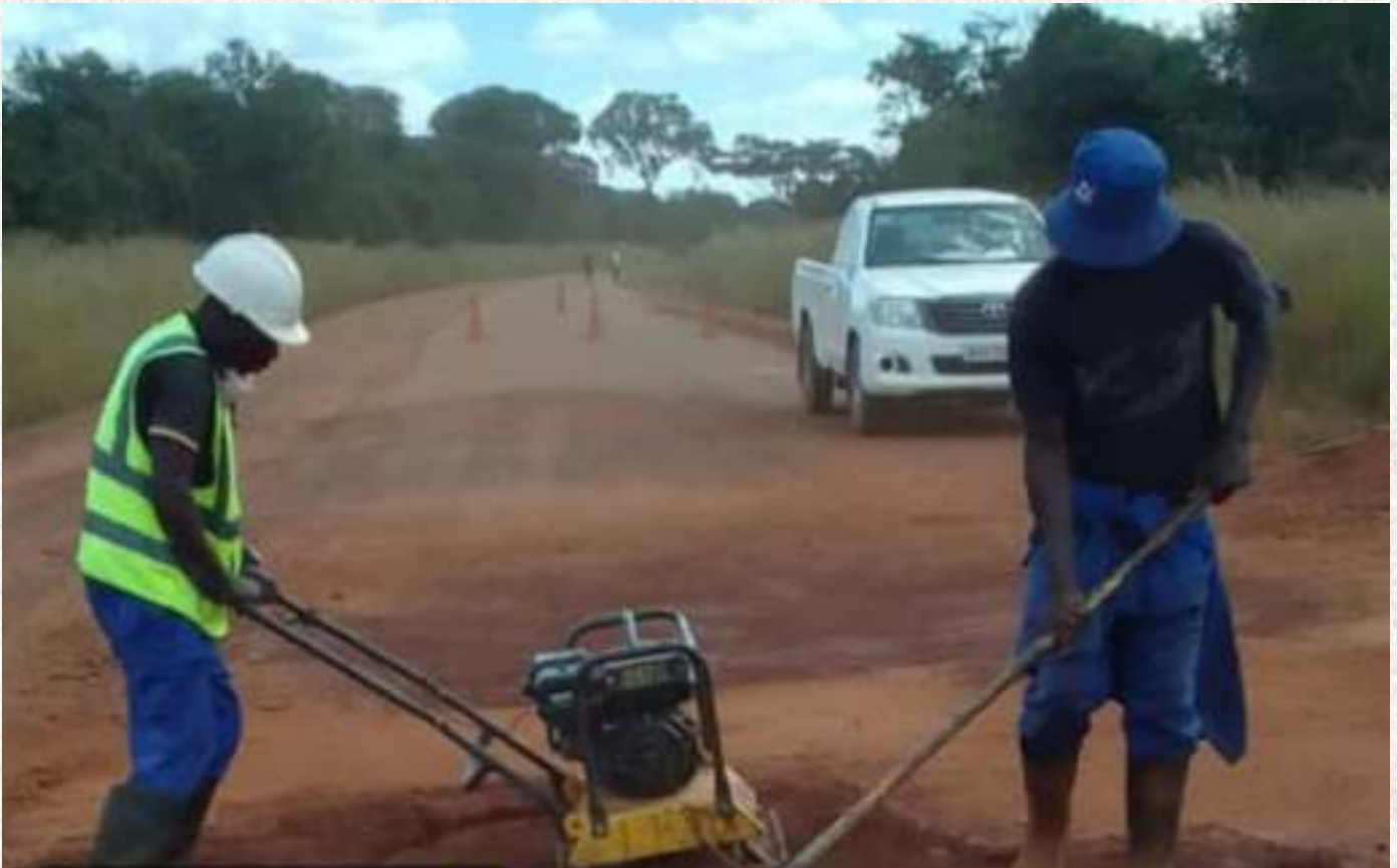
Pothole patching works on the Kisasa-Mwinilunga Road.