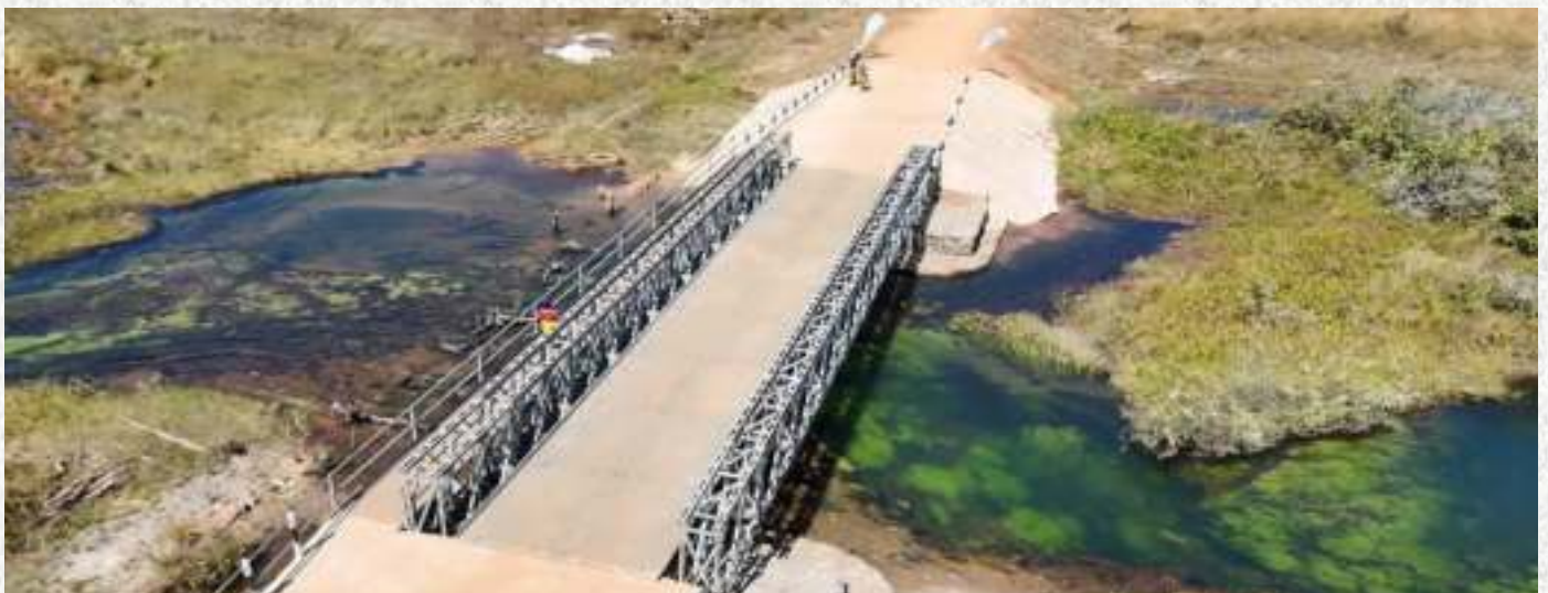
Aerial view of Lukulu ACROW Bridge.

“We will continue to use our own in-house engineering skills in undertaking these construction works and through the engagement of our all-weather partners, the Zambia National Service (ZNS) and the Zambia Army (ZA). Through this systematic approach we are confident that all the 131 ACROW Bridges will be installed within the available financial resource envelope,” he said.