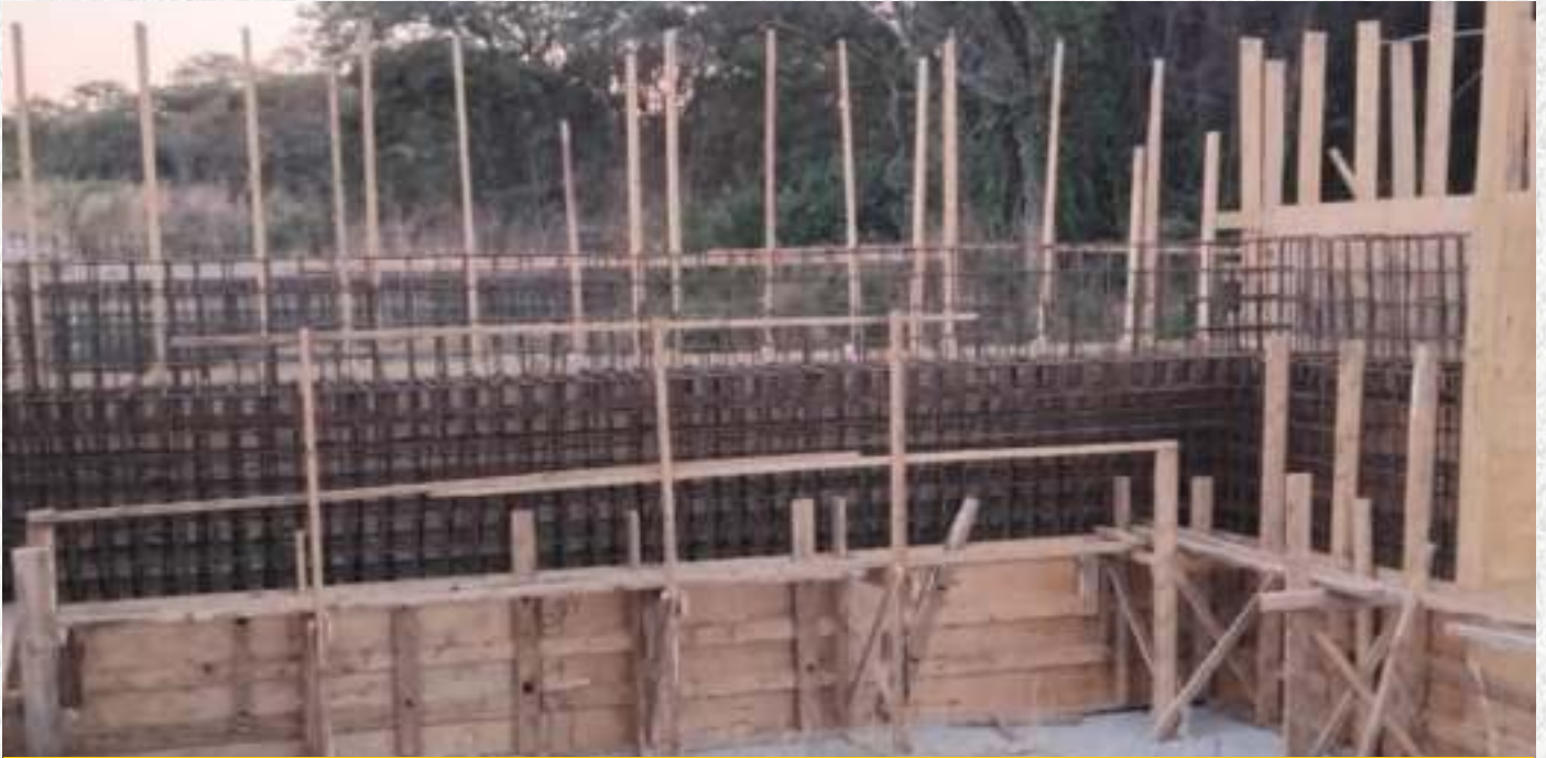
Lwamfumu ACROW Bridge under construction

The Road Development Agency (RDA) has embarked on the construction and installation of an ACROW Bridge at a crossing near the Zambia National Service (ZNS) camp at Lwamfumu in Mansa District in Luapula Province.