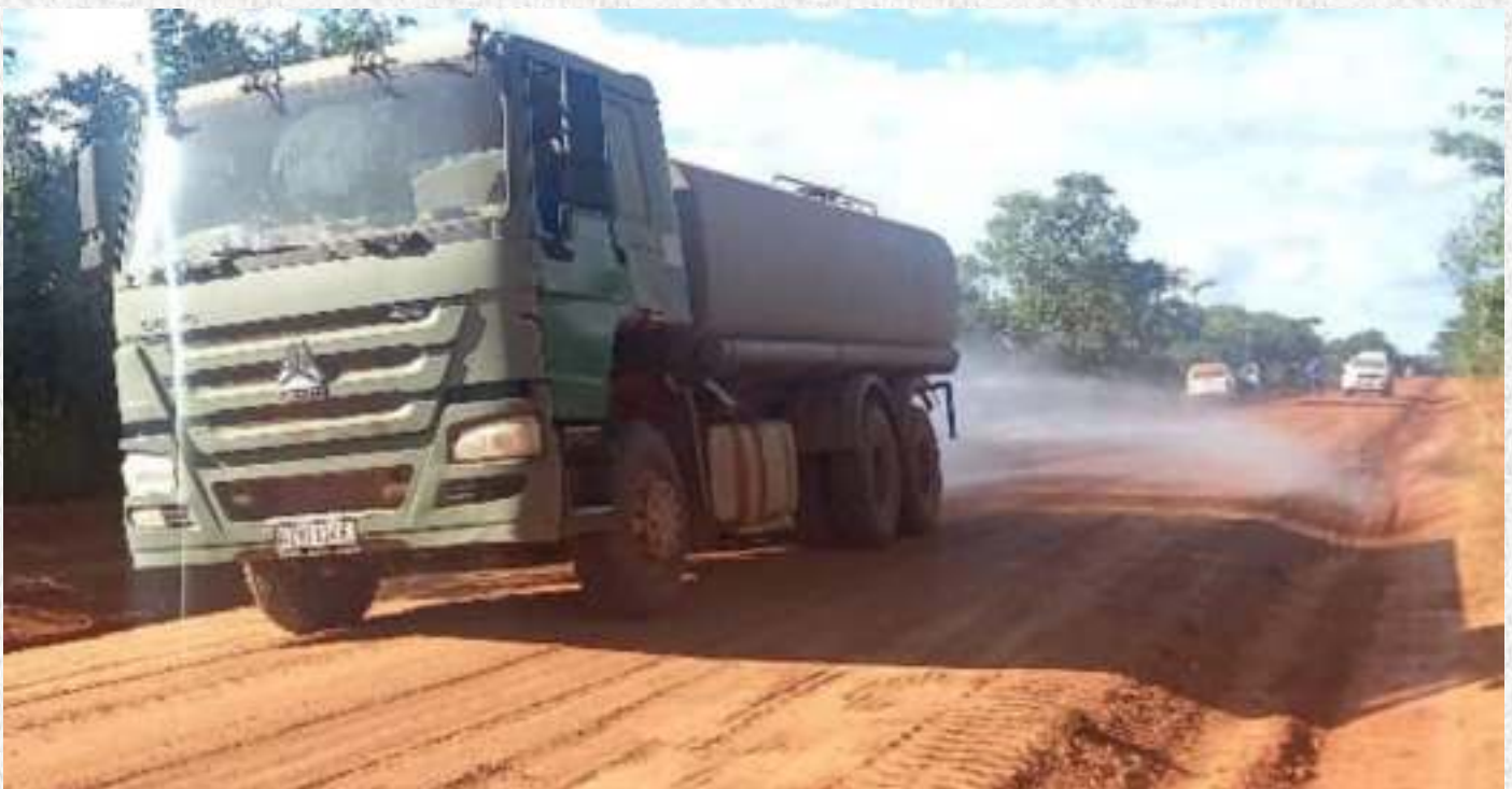
Works on access roads to tourism sites in Chinsali District.

The installation of culverts is also underway.