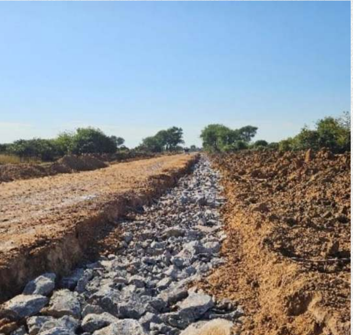
Monze-Niko Road works.

The Road Development Agency (RDA) is rehabilitating the first 29.5 kilometres section of the Monze-Niko Road and upgrading to bituminous standard that last 41.5 kilometres of section of the same road.