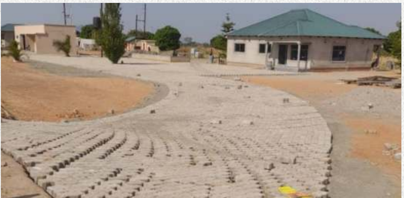
Paving works at Toll Station houses.

The RDA is also mandated under the Tolls Act No. 14 of 2011 to administer and implement the National Tolling Programme and it has appointed the National Road Fund Agency (NRFA) as the Lead Tolls Agent.