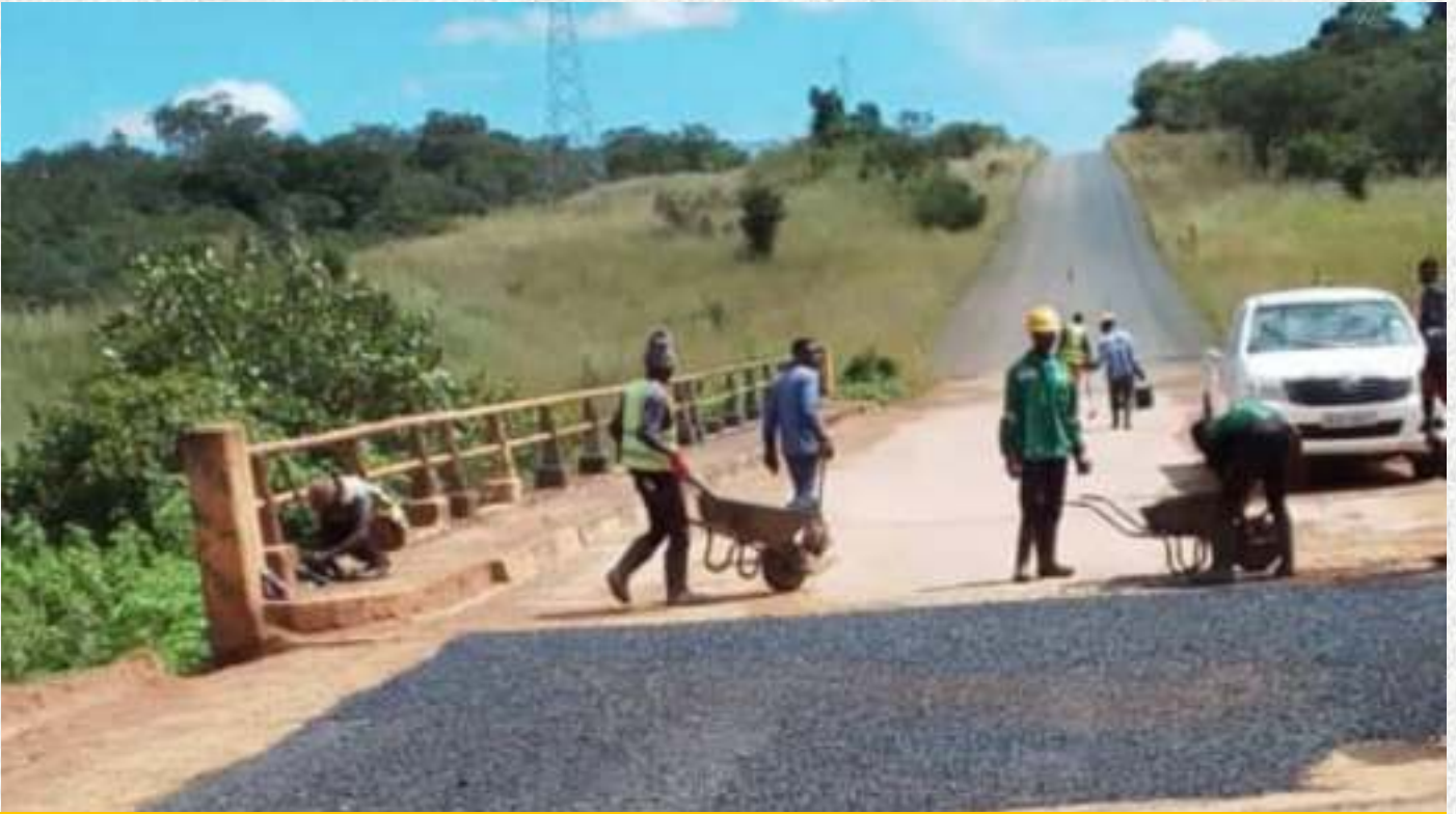
Pothole patching works on the Kisasa-Mwinilunga Road.