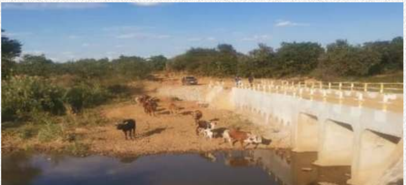
Chibila box culverts in Mumbwa.

installation of 3-line 2400x2400 millimetres box culverts including relief pipe culverts, erosion protection works and ancillary road works.