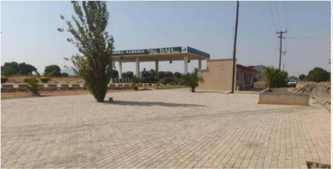
Additional works at Rueben Chitandika Kamanga Toll Station.

In order to enhance security and service delivery at Rueben Chitandika Kamanga and Alexander Grey Zulu Toll Stations in Eastern Province, the Road Development Agency (RDA) is undertaking the following works: