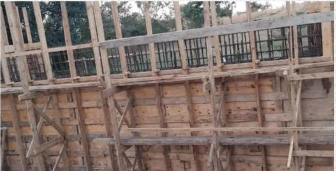
Lwamfumu ACROW Bridge

The bridge is expected connect the ZNS camp to the security loop which runs along the Luapula River from Chembe District to Mwense District.