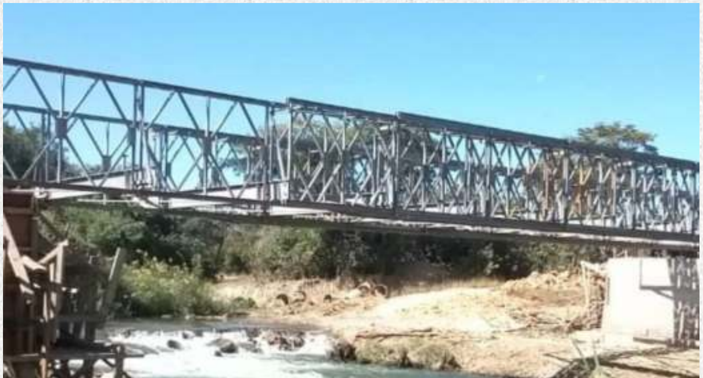
Aluni Mulonga ACROW Bridge works.

Once the bridge is constructed, this will ease travel challenges that the surrounding communities are facing as there is no crossing point to enable them cross either side of the river.