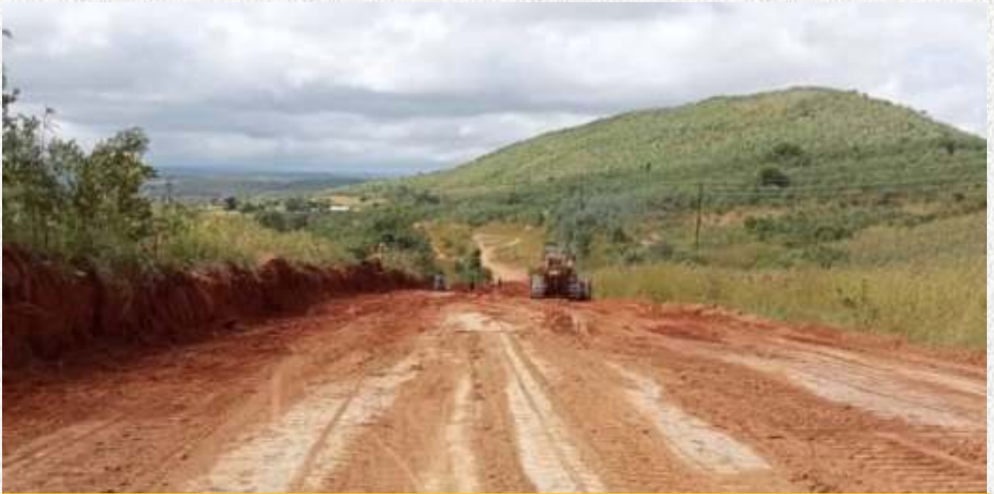
Nakonde Kanyala Road works.

The Road Development Agency (RDA) has commenced maintenance works which involves regravelling of the 30 kilometres Nakonde-Kanyala Road in Muchinga Province.