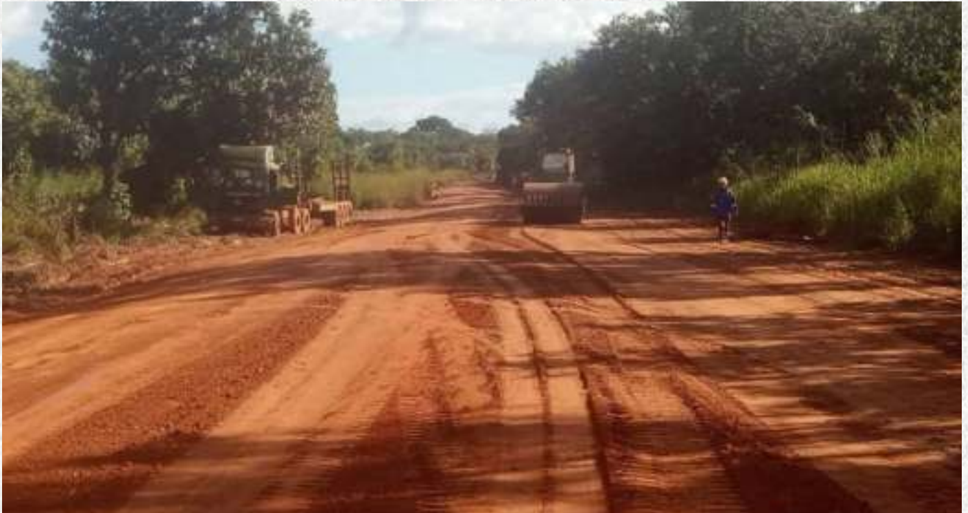
Solwezi-Kipushi Road works.

E mergency holding maintenance works on selected sections of the Solwezi-Kipushi Road in North-Western Province are underway.