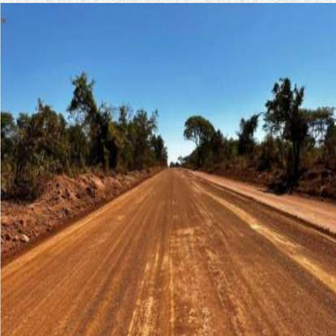
Road works in progress.

Clearing and grubbing has been achieved on the 32 kilometres stretch of the Masangano-Fisenge-Luanshya. Further, roadbed preparation has been undertaken on the 32 kilometres stretch.