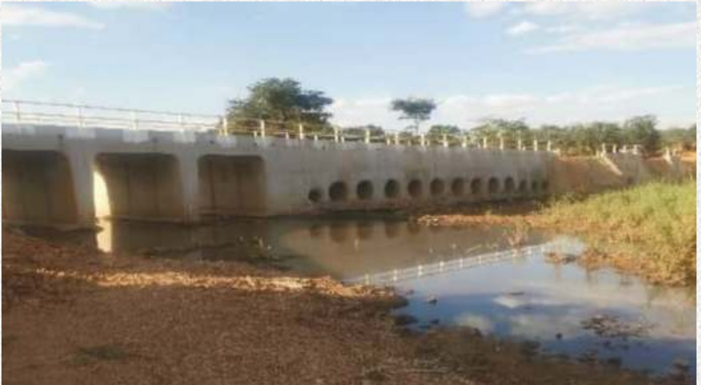
Chibila box culverts in Mumbwa.

The Road Development Agency (RDA) has completed the construction of Chibila box culverts in Mumbwa District in Central Province.