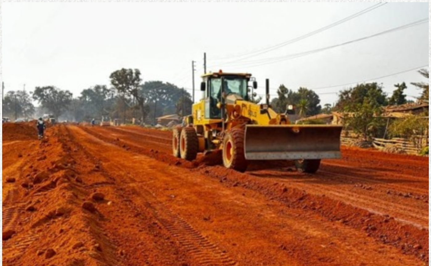
Chibuluma Road works.

services, construction of pipe culverts, construction of the box culvert, earthworks, roadbed preparation, cement stabilised subbase construction, construction of concrete lined drains and construction of the rigid concrete pavement.