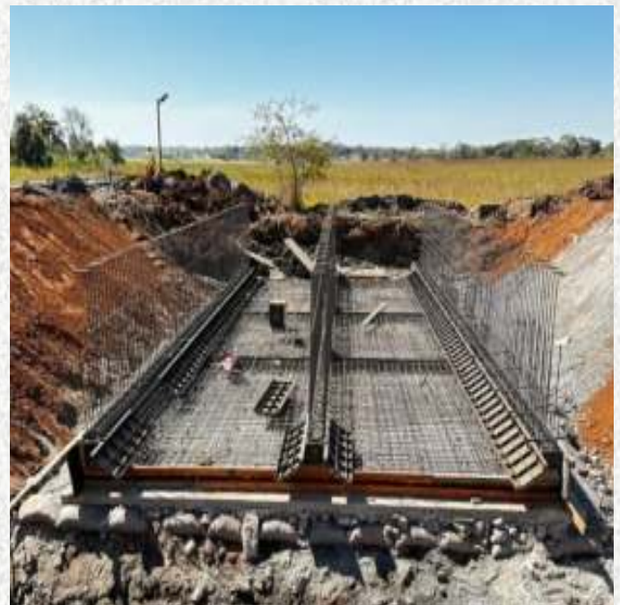
Works on the Masangano-Fisenge-Luanshya Road.