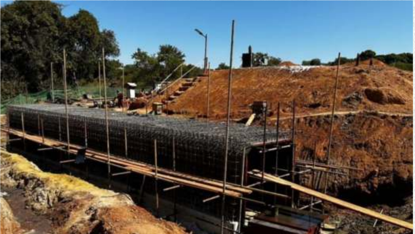
Drainage works in progress.

Works on the Lusaka-Ndola dual carriageway project are progressing well.